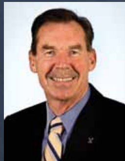
▶ Dick Quax