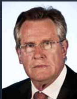
▶ Sir John Walker