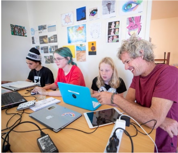
Aotea Learning Hub.