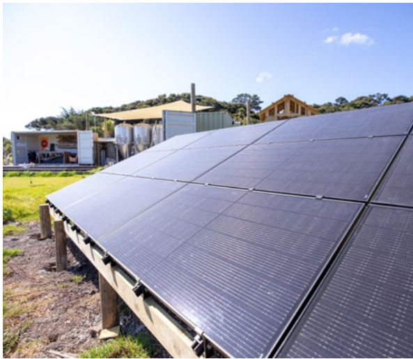
Solar panels outside Aotea Brewing Company