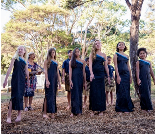
Youth from Okiwi school performing kapa haka.