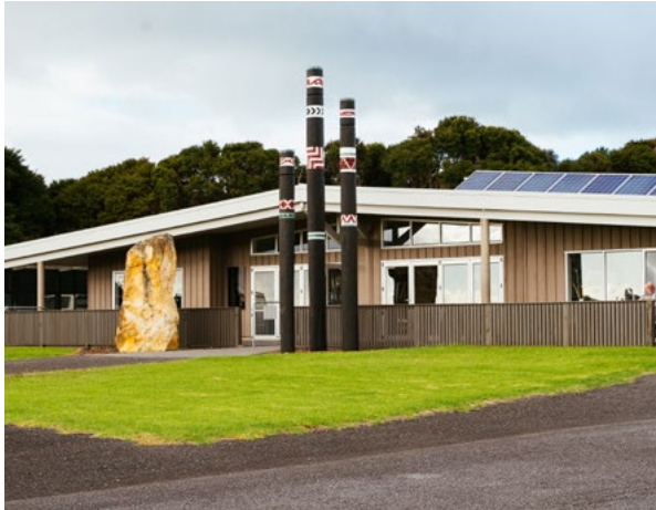
Aotea / Great Barrier Claris airport