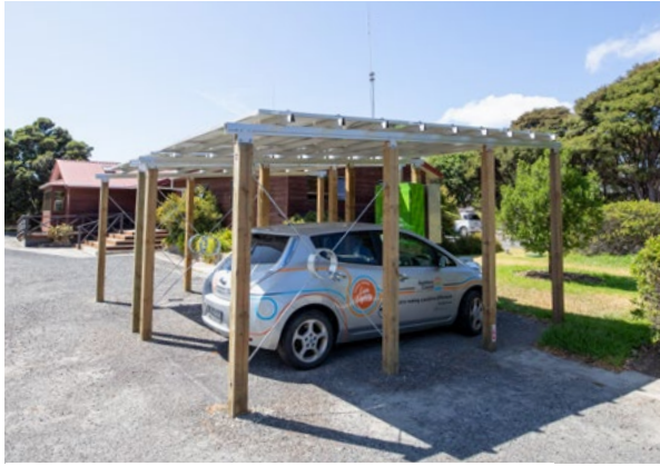
Electric vehicle charging station outside the Aotea / Great Barrier Island Service Centre.