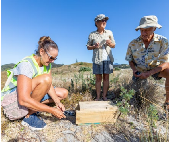
Oruawhoro Medlands Ecology Vision Group at Medlands Beach