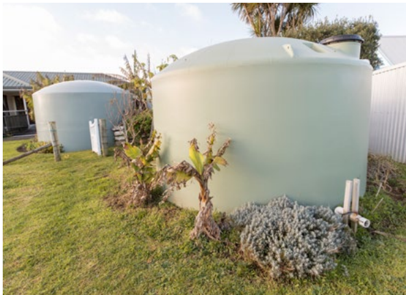
Water tanks located near community garden in Medlands.