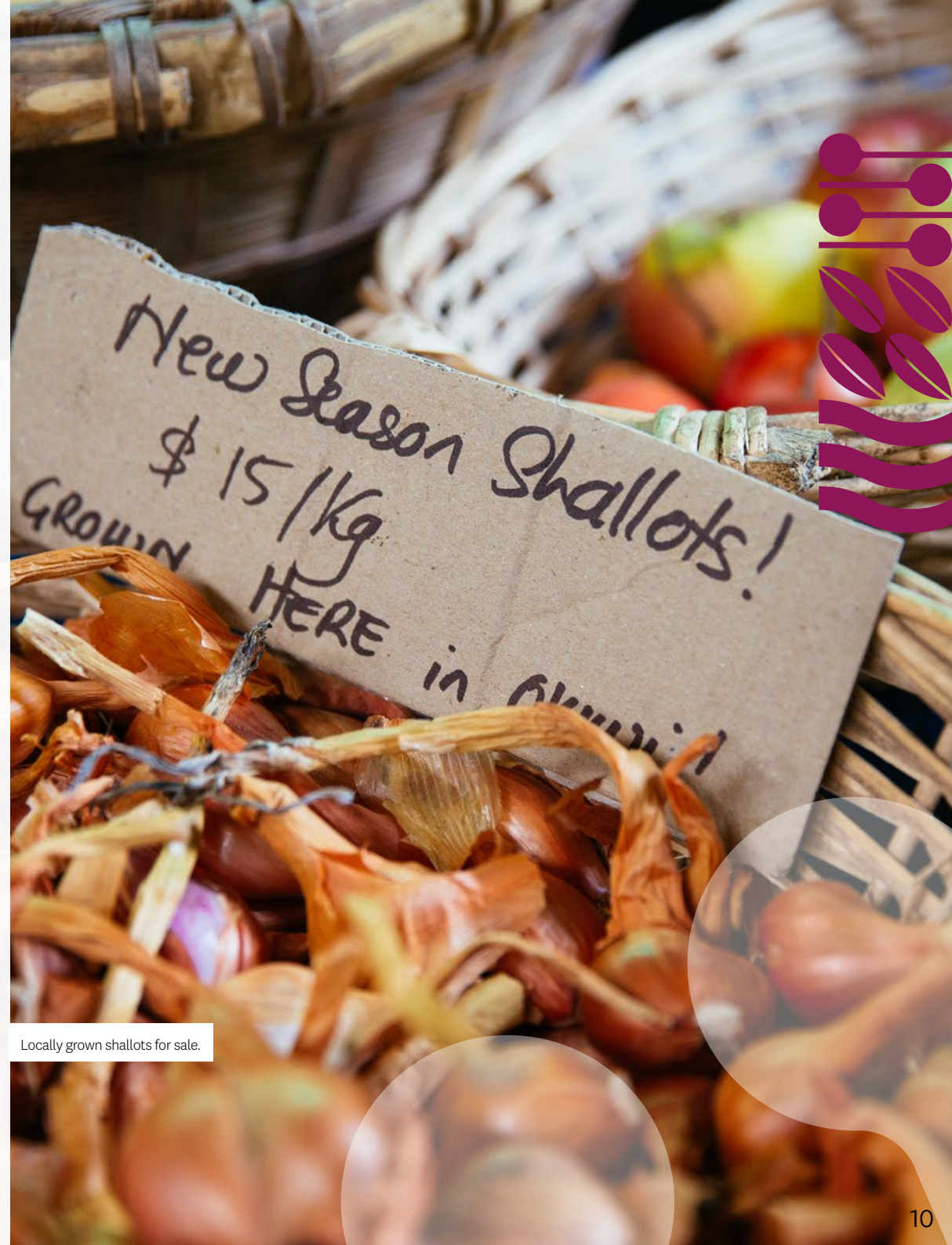
Locally grown shallots for sale.

“ We are resilient by nature and this is a chance to strengthen our local sustainability practices ”