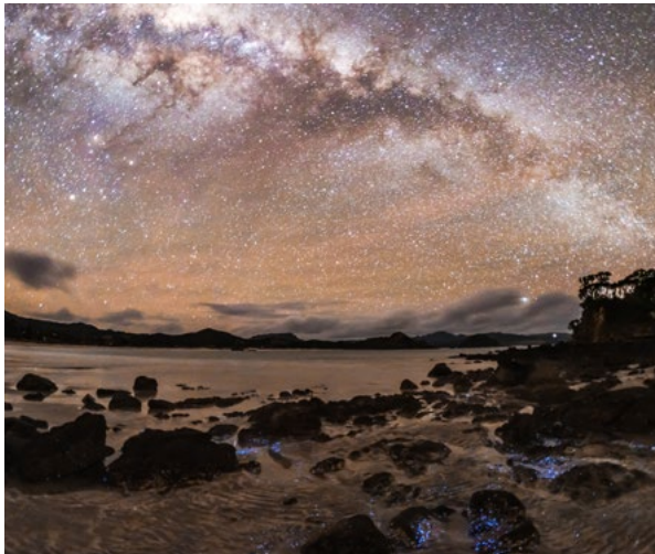
International Aotea / Great Barrier Island Dark Sky Sanctuary