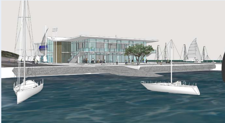
Concept image of the multi-use centre at The Landing

The development of the Akarana Marine Sports Centre on the site of the current Royal Akarana clubhouse has been a long-held aspiration of the Royal Akarana Yacht Club, which was established in 1895. This development, now led by Akarana Marine Sports Charitable Trust with Royal Akarana Yacht Club and others as tenants, will create a lively multi-use centre as a hub for marine activity, events and education. The planned completion date is 2018.