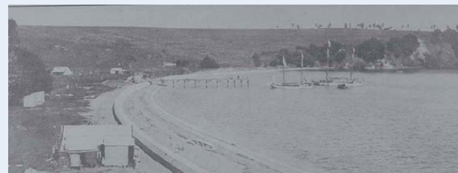
The bay looking towards where The Landing is now, early 20th Century. It shows Ngāti Whātua's village and the sewer pipe built in front of it. Ref. 7-A2929.