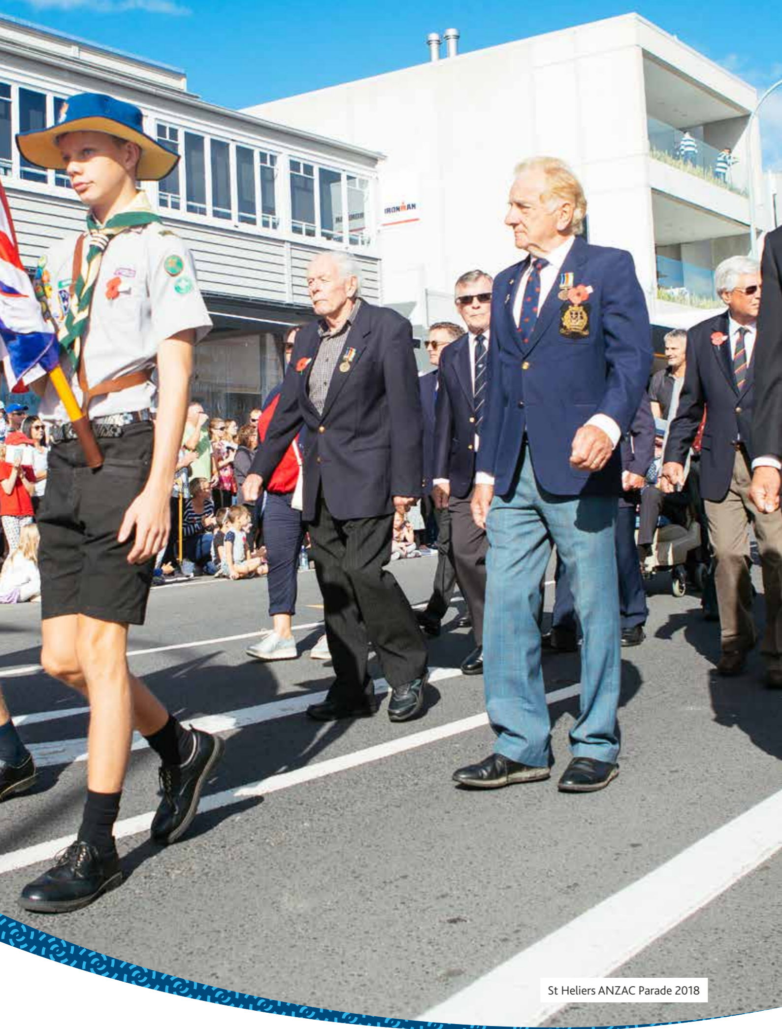
St Heliers ANZAC Parade 2018