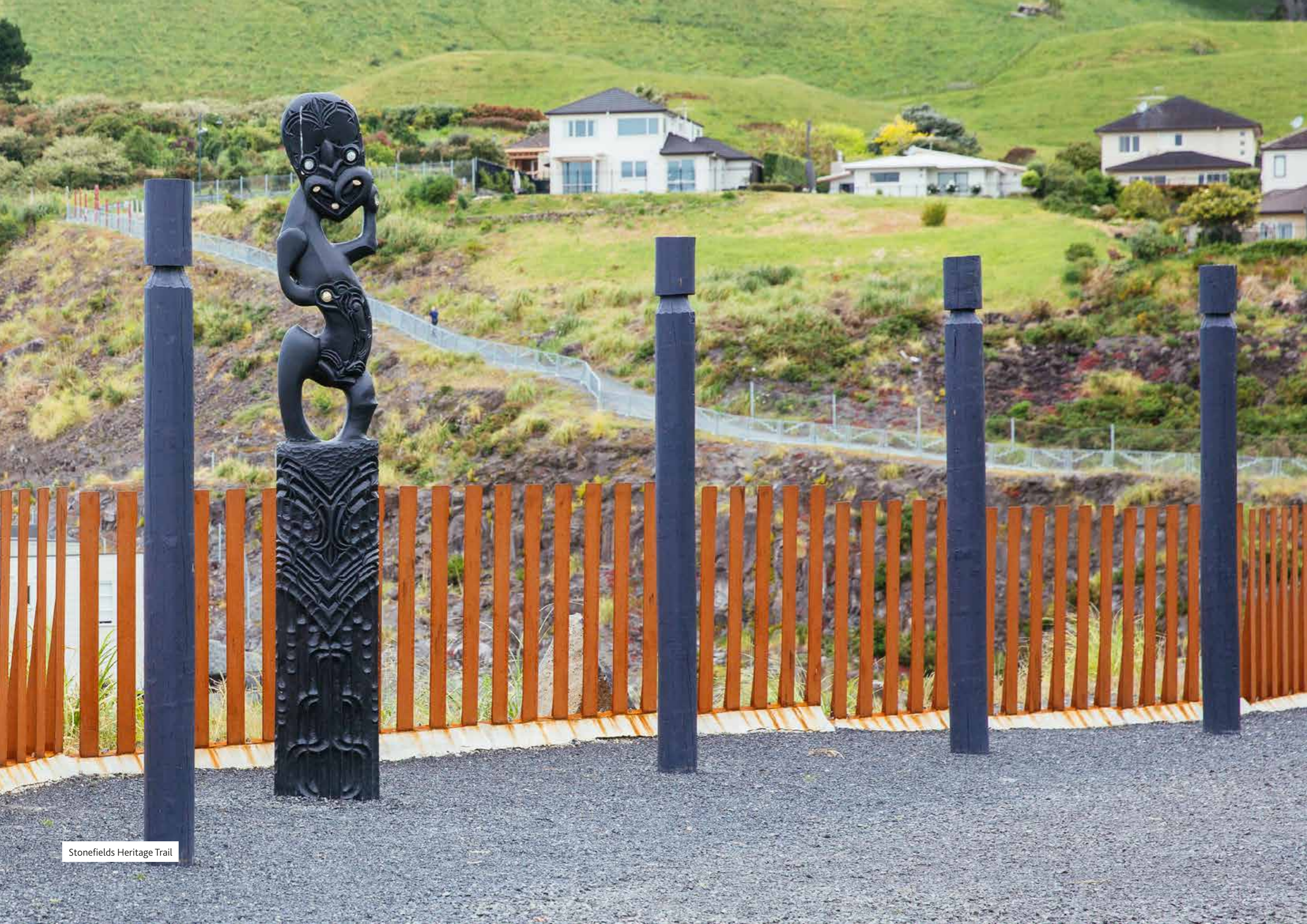
Stonefields Heritage Trail