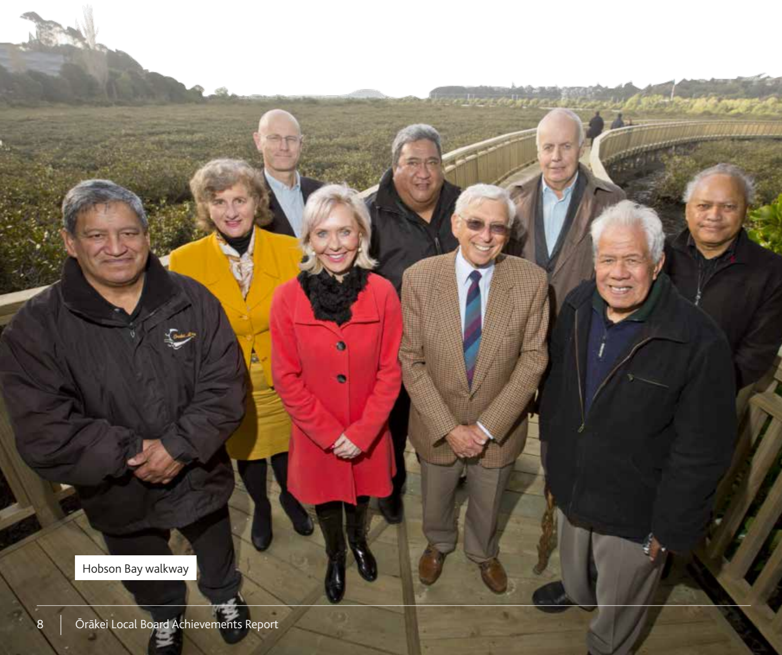
Hobson Bay walkway

Hobson Bay walkway – Orakei Point to Shore Road