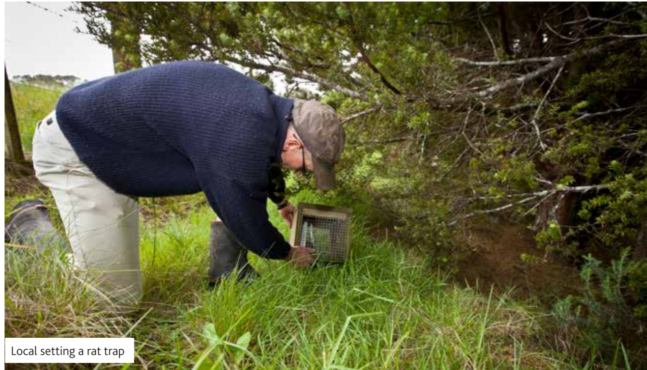
Local setting a rat trap