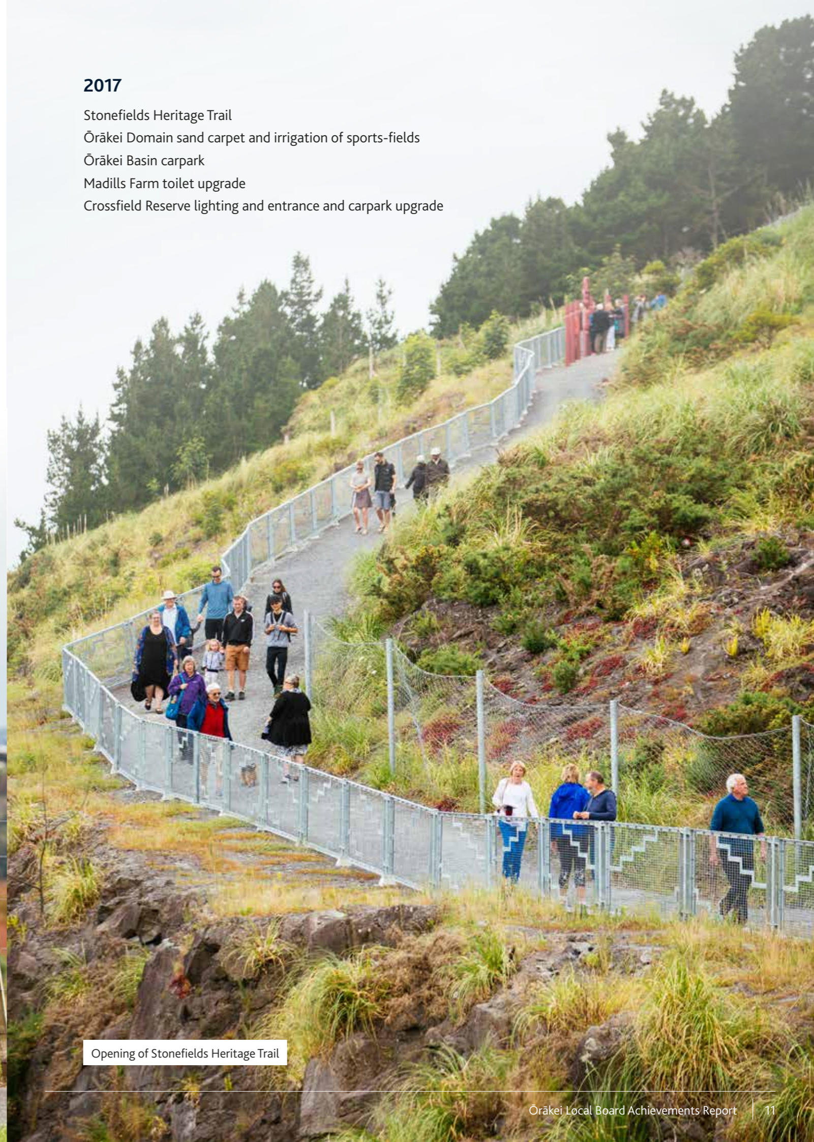
Opening of Stonefields Heritage Trail