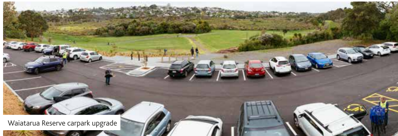
Waiatarua Reserve carpark upgrade

Meadowbank Community Centre redevelopment approval Tāmaki Drive / Ngapipi Road intersection safety upgrade Tāmaki Link bus launch Successful advocacy for funding for Gowing Drive link to the Glen Innes to Tāmaki Drive shared path Michaels Avenue Reserve lighting and sound wall Ōrākei Impact of Events report Inaugural Ōrākei Local Board Business Awards Shore Road Reserve and Waiatarua Reserve carparks Ōrākei Basin: State of the Basin monitoring report Kepa Bush Reserve Integrated Plan