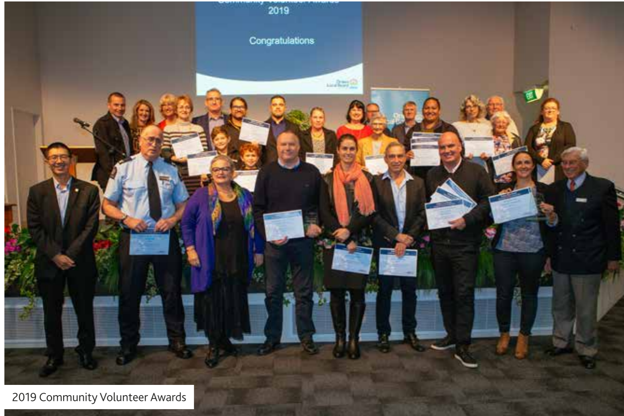
2019 Community Volunteer Awards

The awards ceremony recognised the hard work of all our volunteers and highlighted the outstanding effort from the category winners and those highly commended.