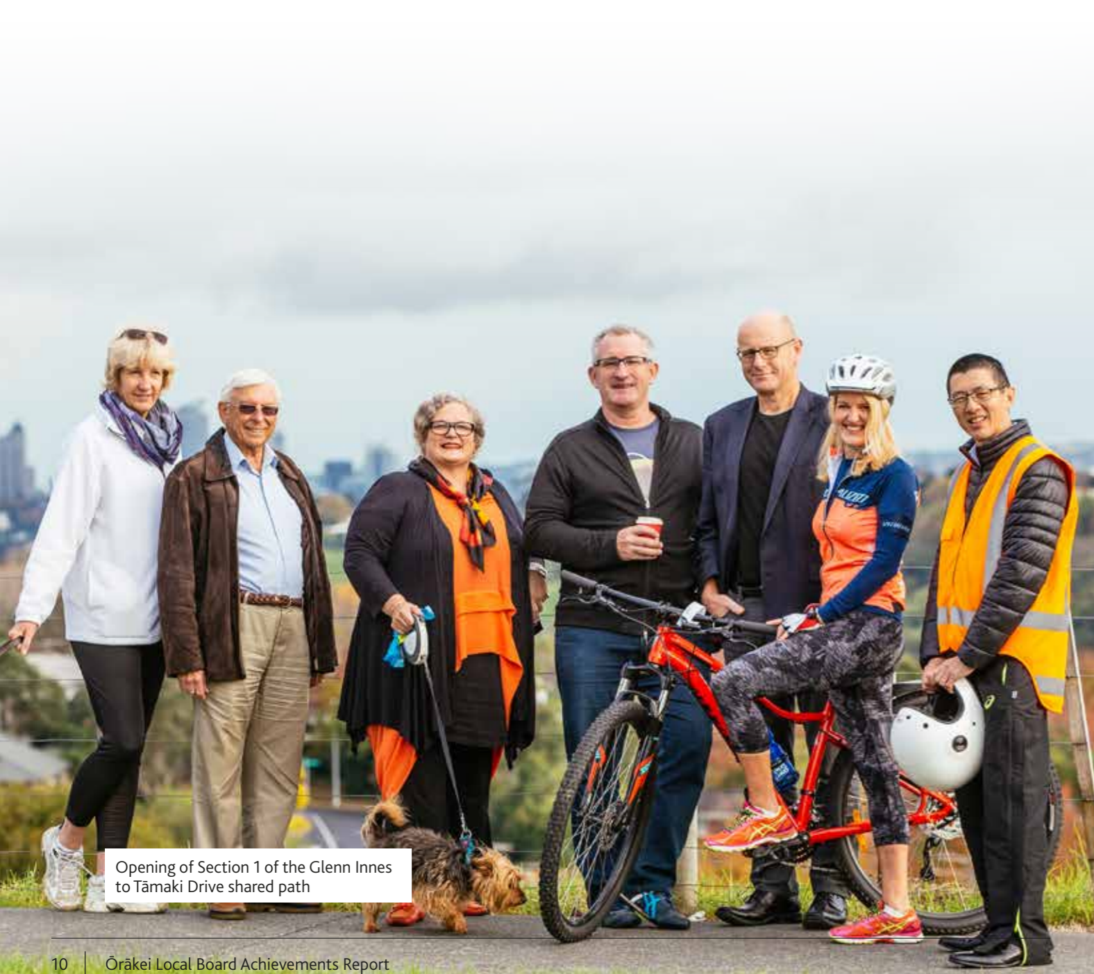
Opening of Section 1 of the Glenn Innes to Tāmaki Drive shared path