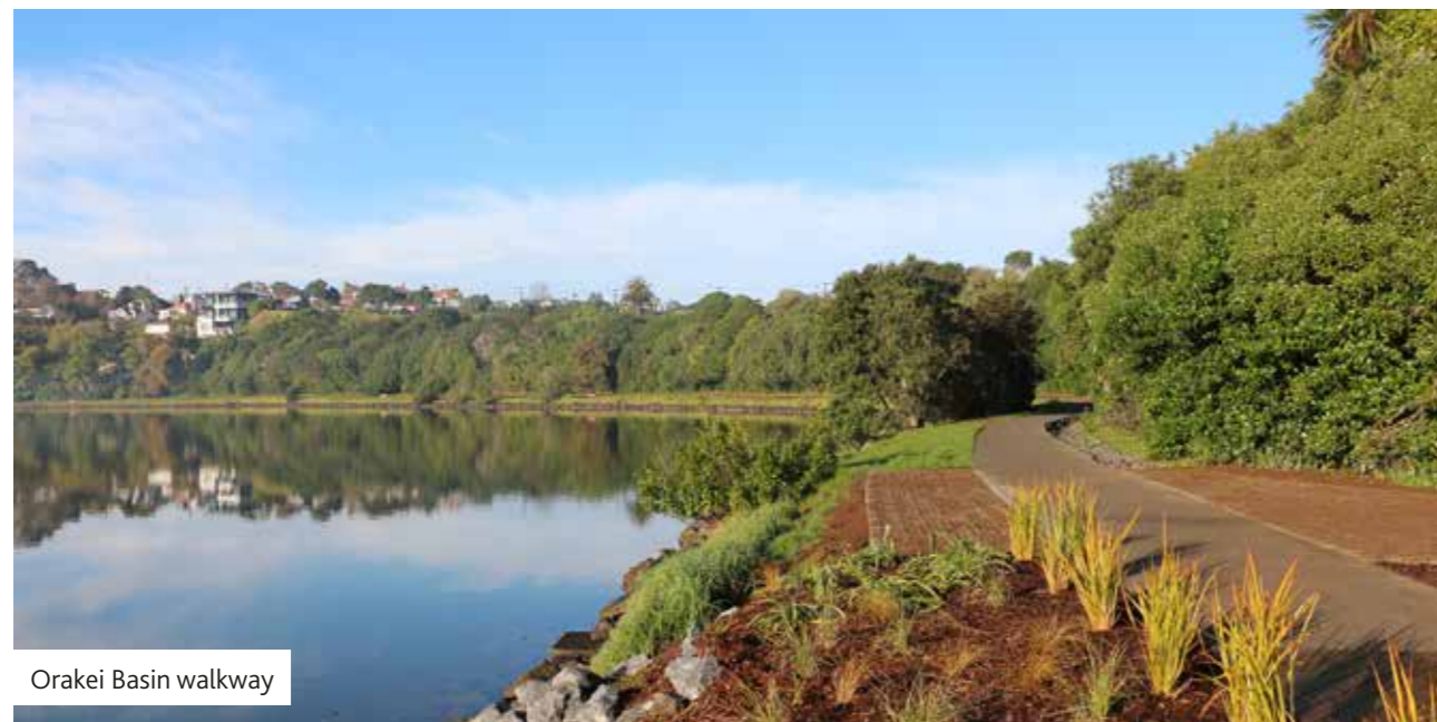
Ōrākei Basin walkway

Ōrākei Basin walkway Tahapa Reserve Concept Plan Tāmaki Drive Searchlight emplacements Kupe South Reserve development Wairua Reserve playground renewal