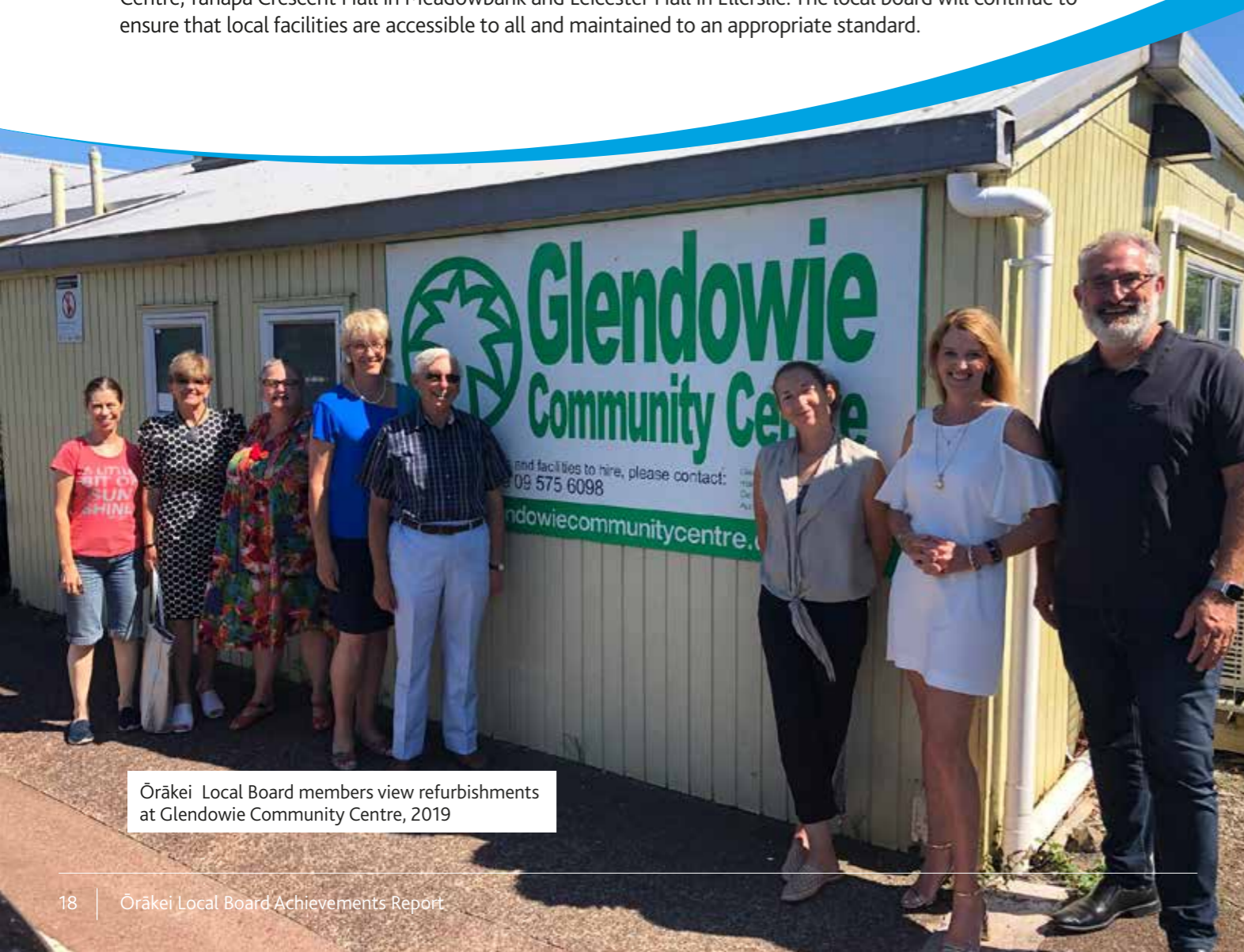
Ōrākei Local Board members view refurbishments at Glendowie Community Centre, 2019

The students aim to reduce food waste and to provide a facility where community will share their own fruit and vegetables.