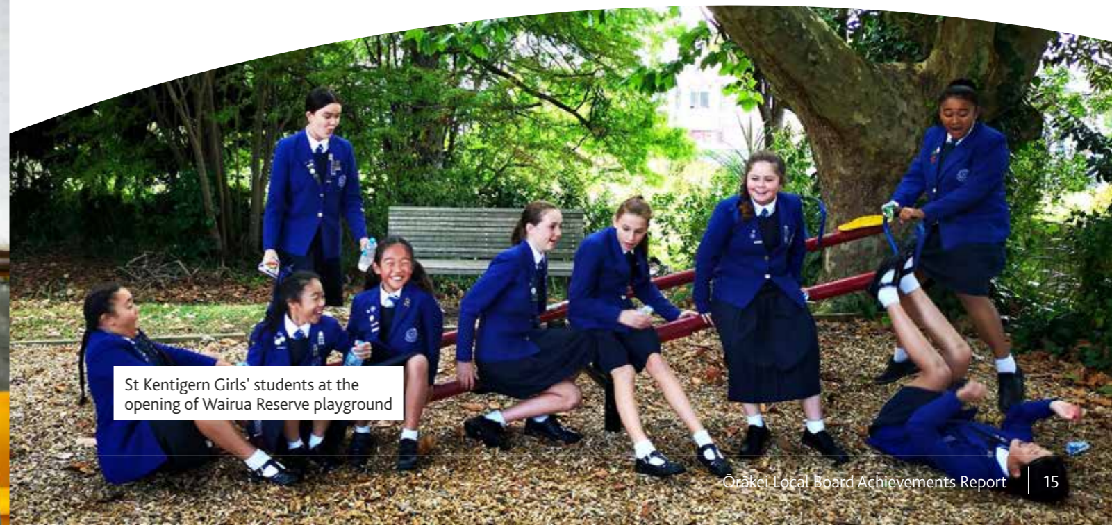
St Kentigern Girls' students at the opening of Wairua Reserve playground

Students from St Kentigern Girls' School helped to design and paint archways for the project.