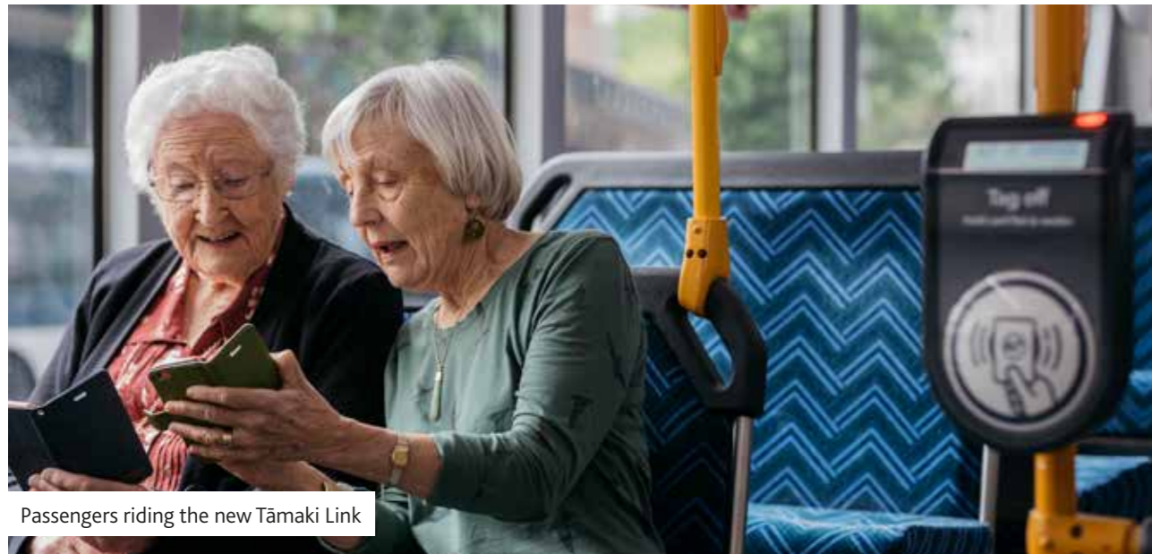
Passengers riding the new Tāmaki Link

The local board has advocated for a number of years for a loop bus to better connect its local communities. As part of the new central bus network, the Tāmaki Link was launched. The new service is a great way to get to and from the beaches, shops and cafes along the waterfront in the eastern bays. The frequent service runs every 15 minutes between 7am and midnight. The Tāmaki Link travels from Britomart along Tāmaki Drive, passing Ōkahu Bay, Mission Bay, Kohimarama and onto the St Heliers shops before heading to Glen Innes train station. The service also provides better access for residents wanting to take the train to Sylvia Park and Middlemore.