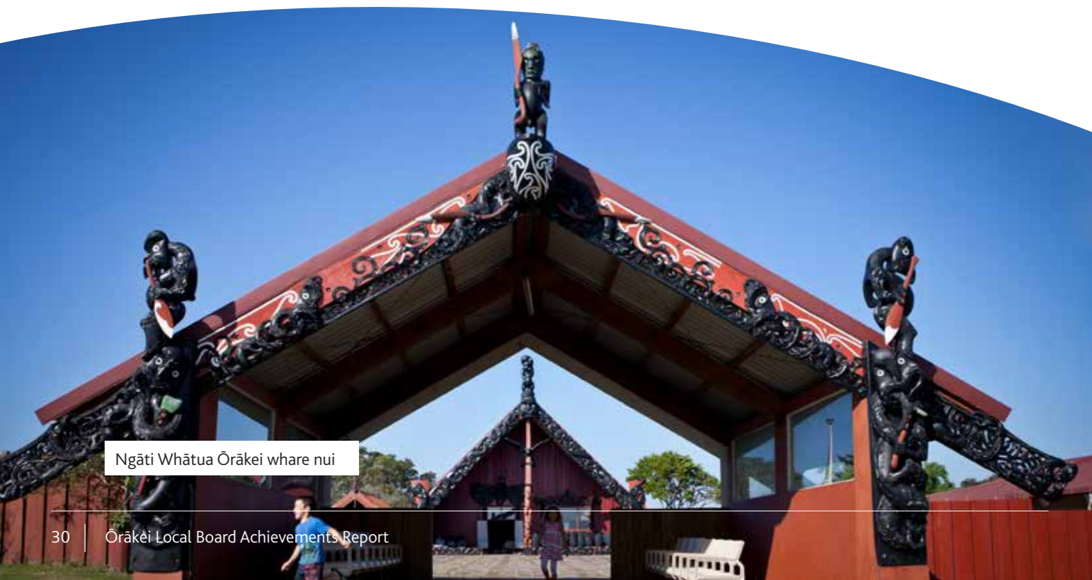
Ngāti Whātua Ōrākei whare nui

The formal meeting was the first in nine years for the local board since the formation of Auckland Council.