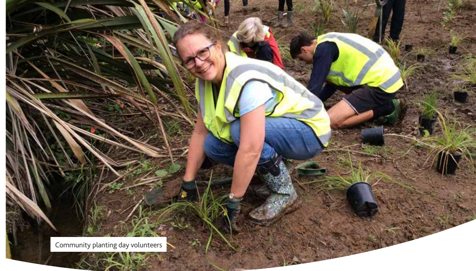
Community planting day volunteers

From the Deck is now in its second year of the project and has had great success connecting with more neighbours and building resilience for the environment of the Newmarket and Remuera Streams. It has completed a five-year management plan and continues with volunteer planting days with a focus on increased planting in the riparian environment. The group has also conducted rat pulses and is working on how to improve trapping.