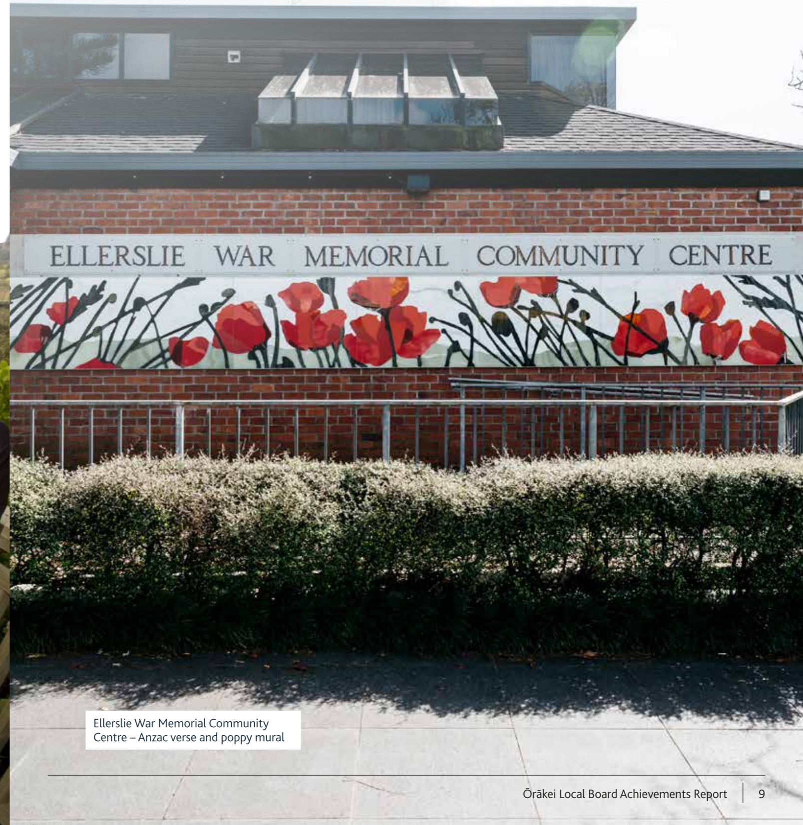
Ellerslie War Memorial Community Centre – Anzac verse and poppy mural