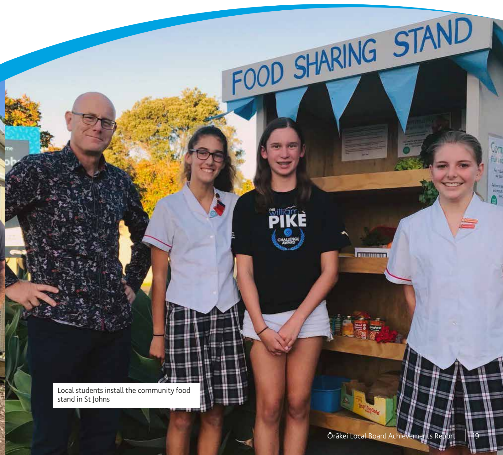
Local students install the community food stand in St Johns