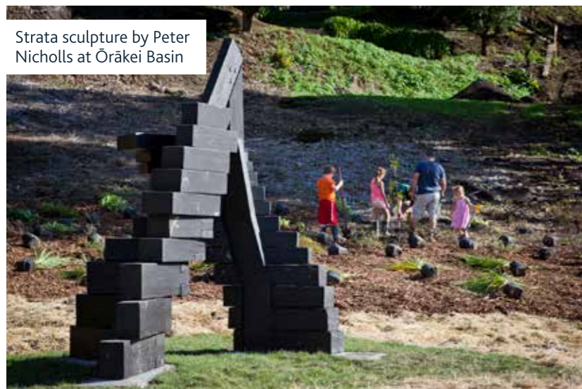
Strata sculpture by Peter Nicholls at Ōrākei Basin

Crossfield Reserve, Glover Park and Madills Farm Masterplan Ōrākei Local Board Local Economic Development Plan Wilson's Beach upgrade Ōrākei Road railway walking/cycling overbridge Sculptures at Ōrākei Basin ( Strata ) and Stonefields ( Genoa )