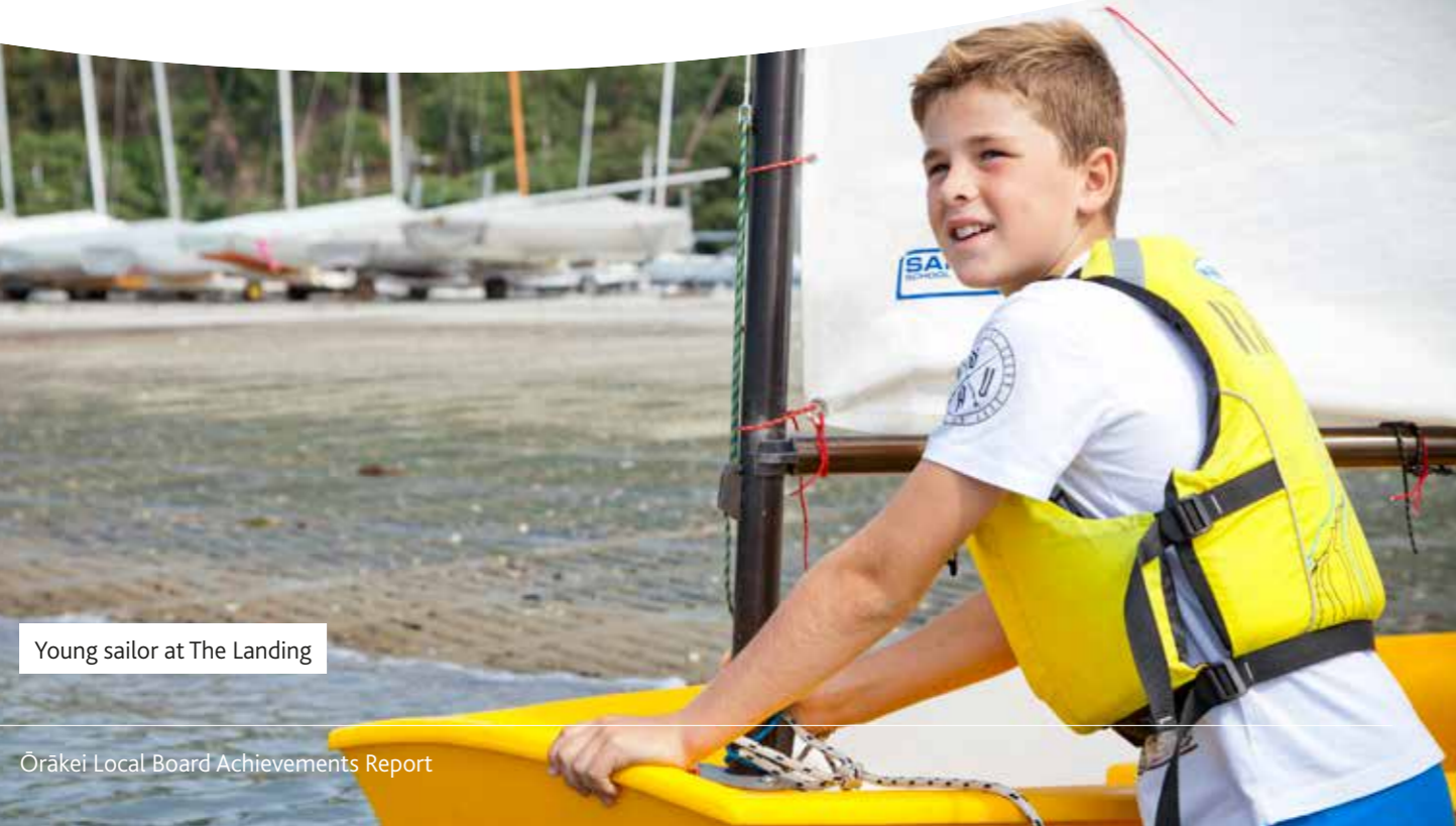
Young sailor at The Landing

The Ōrākei Local Board is also investigating easier dinghy ramp access at The Landing on the western side. This would provide safe access for boat owners who need to move their boats out of Ōkahu Bay by July 2019.