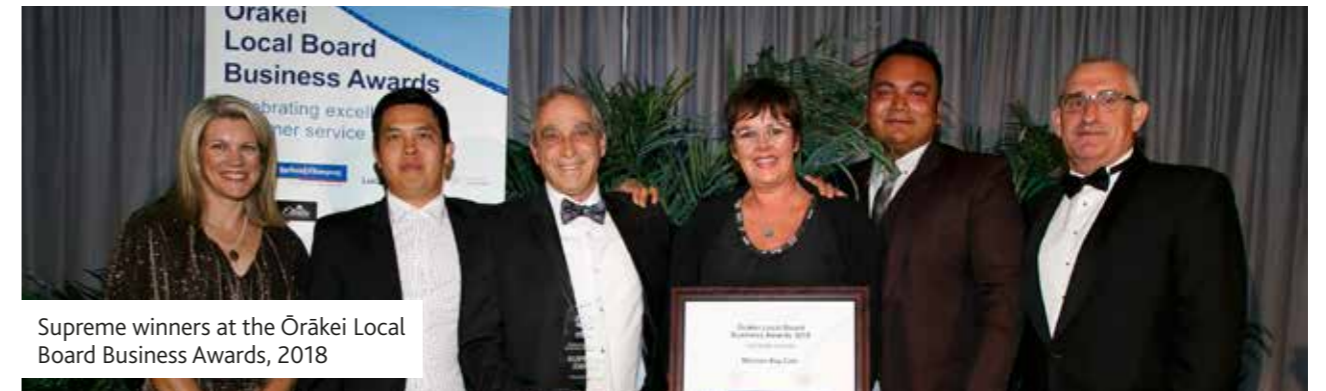
Supreme winners at the Ōrākei Local Board Business Awards, 2018

The evening provided an excellent networking opportunity and the local board is proposing to hold the awards on a biennial basis due to the positive feedback from businesses.