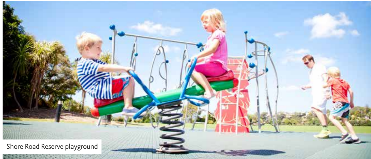
Shore Road Reserve playground

Ōrākei Basin walkway – stage 1 and 2 New Shore Road Reserve playground