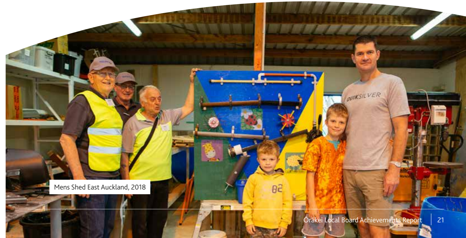
Mens Shed East Auckland, 2018

The group provides a place for men and women to meet, creating a new community hub where people can share skills and work on practical tasks individually and as a group, such as rat traps to reduce pests in our environment.