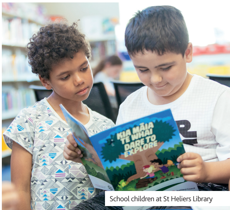
School children at St Heliers Library

Every year the Ōrākei Local Board sponsors the Win with Words competition at St Heliers and Remuera Libraries. The competition encourages creativity outside of the classroom for students in years seven and eight in our area. In 2017, 350 students entered the competition, writing a short story of no more than 500 words. The two prize-giving events are always a highlight of the programme and we were honoured to read excerpts from the winning stories at the ceremonies.