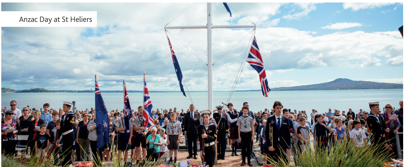
Anzac Day at St Heliers

Our Board area has three commemorative services with the Board represented at each one: College Rifles in Remuera, Ōrākei RSA and St Heliers War Memorial.