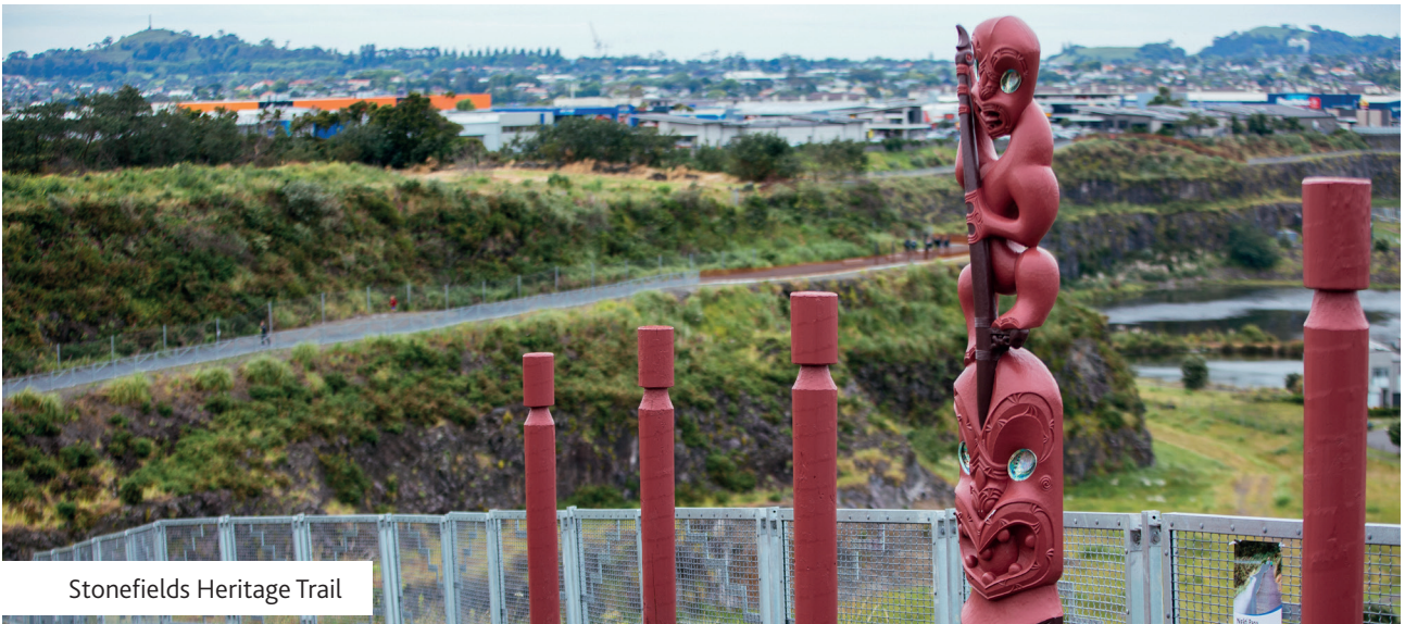
Stonefields Heritage Trail