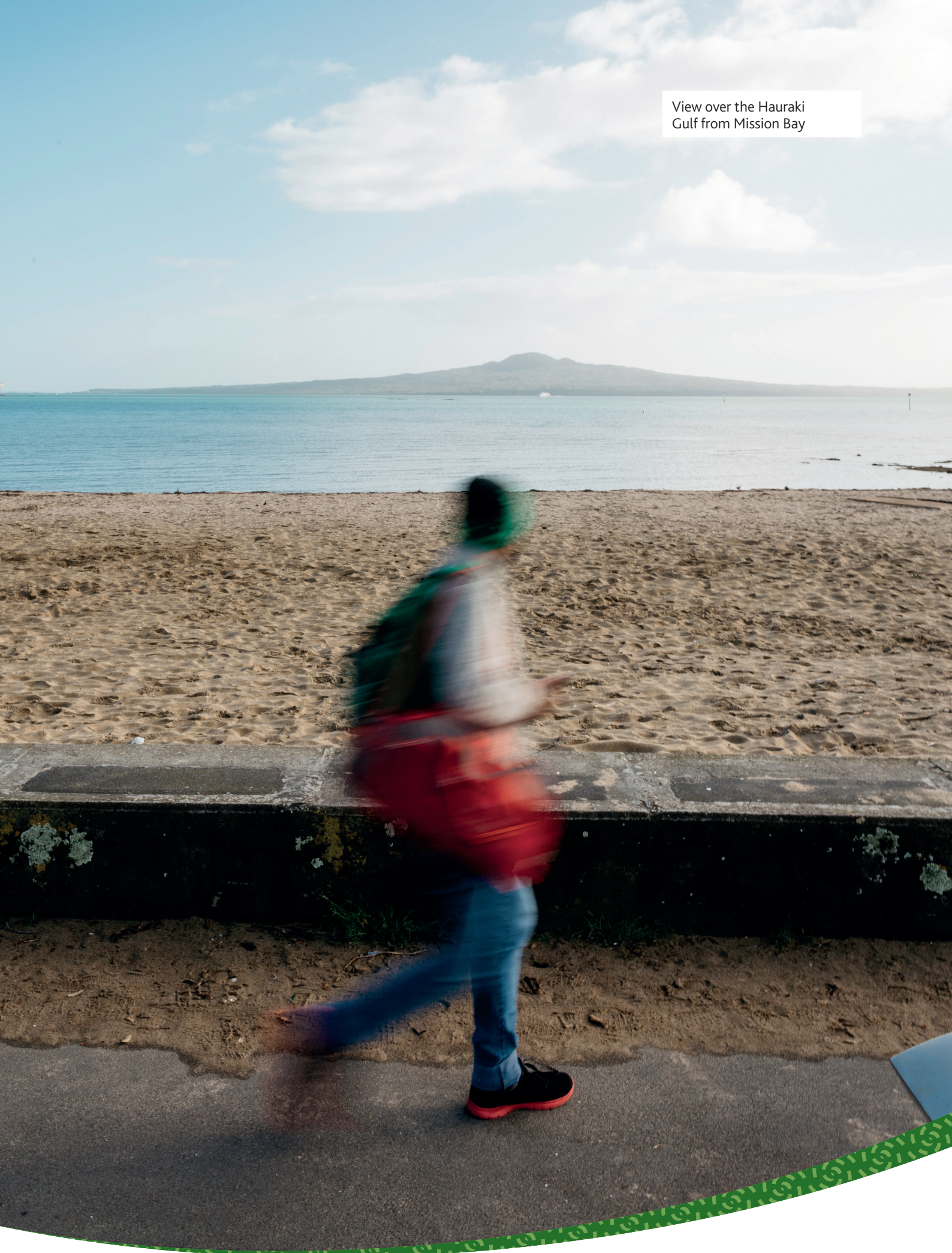
View over the Hauraki Gulf from Mission Bay