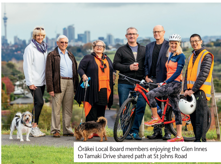
Ōrākei Local Board members enjoying the Glen Innes to Tamaki Drive shared path at St Johns Road

The first stage of the Shared Path links Glen Innes to St Heliers. It is a 1.6km section that runs beside the Meadowbank Pony Club, through Apirana Reserve and connects to St Johns Road.