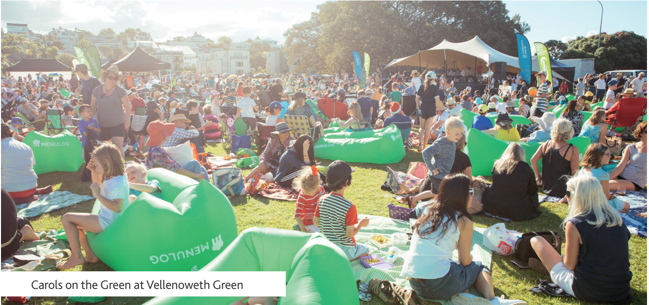
Carols on the Green at Vellenoweth Green

Every December the Ōrākei Local Board holds Carols on the Green at Vellenoweth Green in St Heliers. The event provides free, fun and family-friendly entertainment and is delivered as zero-waste and smoke-free. Children and adults were able to enjoy the local performances and carol singing, visit Santa's Grotto and make their own free Christmas cards.