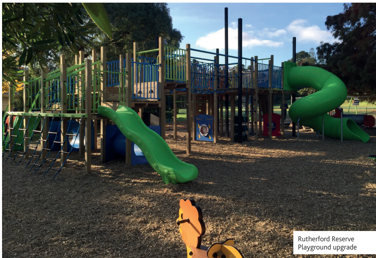
Rutherford Reserve Playground upgrade

The Board incorporated a range of creative play equipment to meet the needs of various age groups, such as the static train for younger children and flying fox for older children and adults.