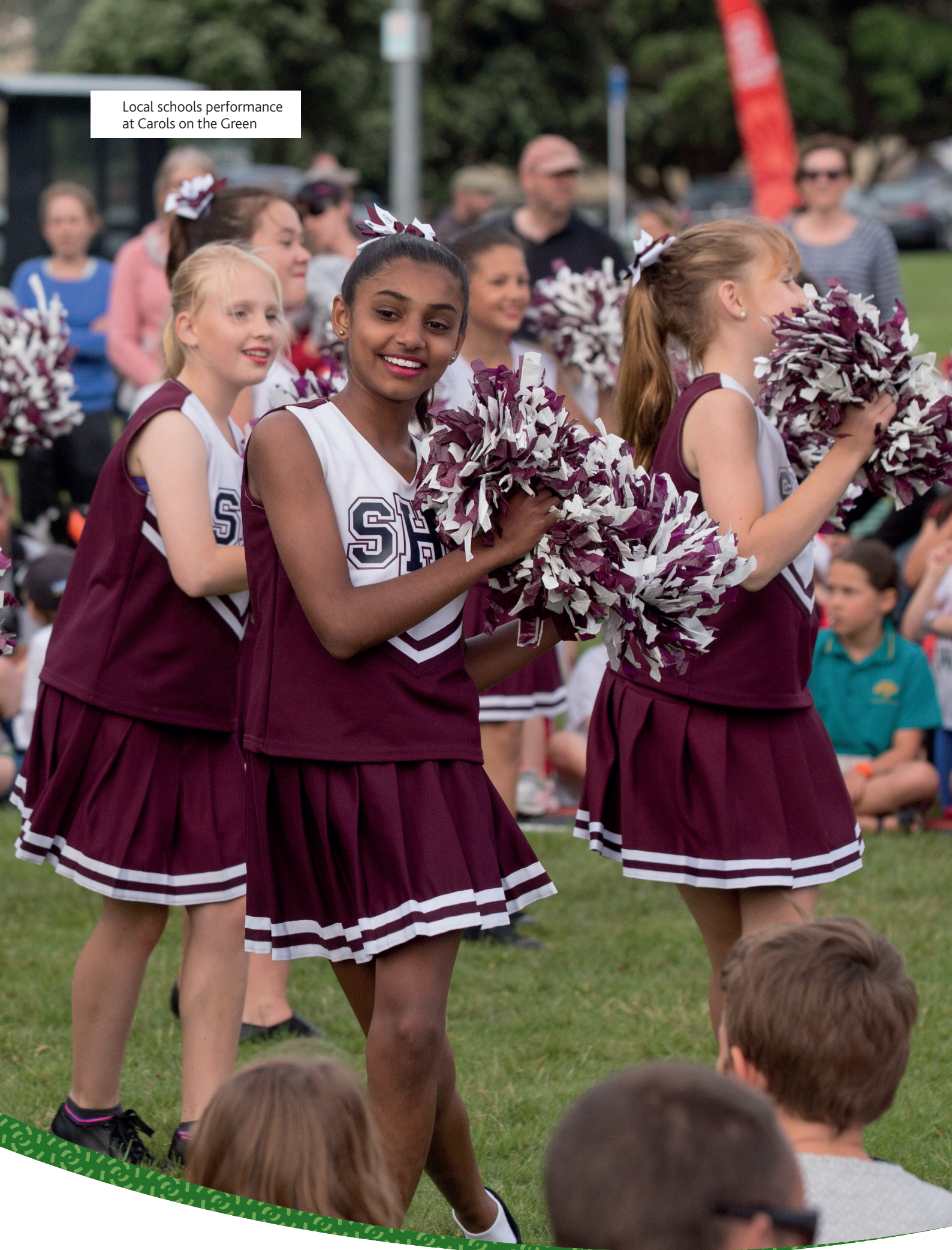
Local schools performance at Carols on the Green