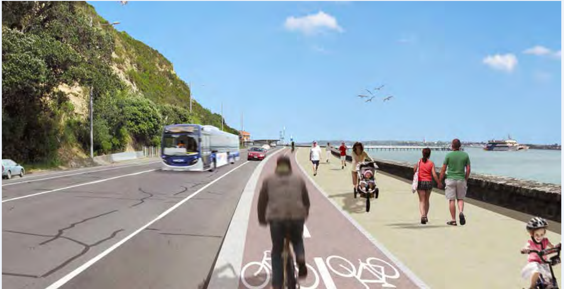
A future vision – providing a range of ways of getting around includes improving frequency of bus services, improving facilities for local commuter cyclists and creating a widened seaward promenade.