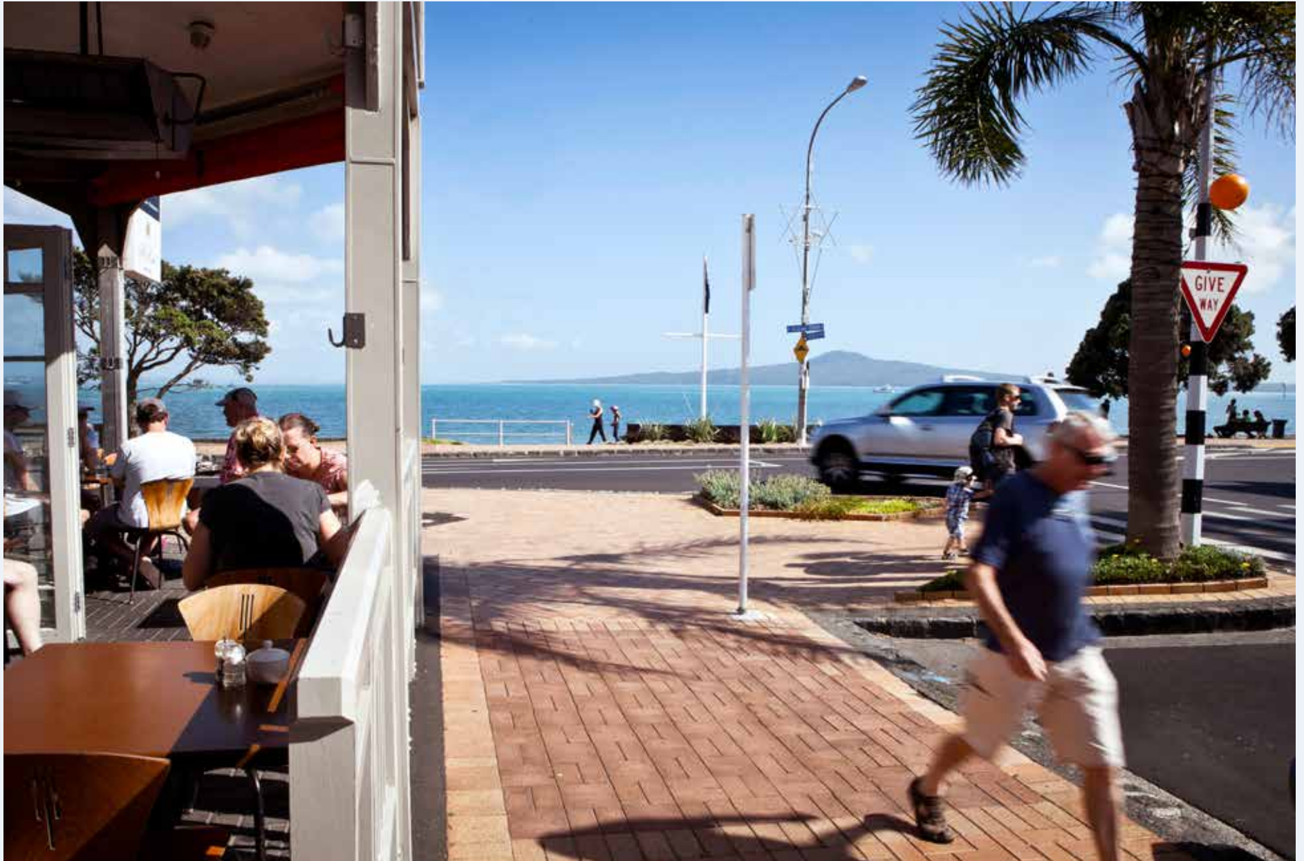
Village life in St Heliers.