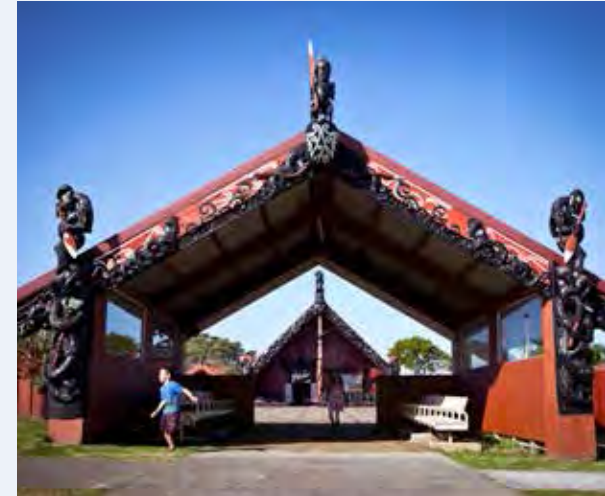
The Orākei Marae.