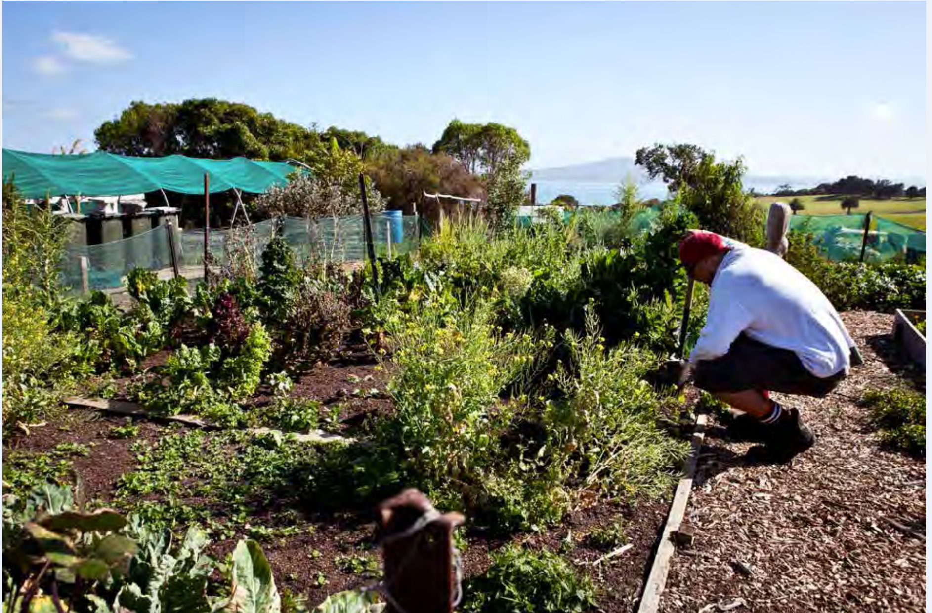
The nursery and Whenua Rangatira.