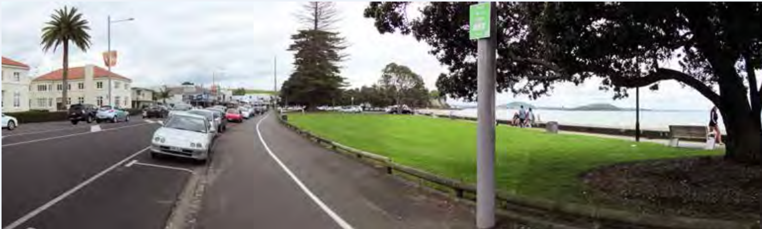
Existing situation – arriving in Mission Bay from Kohimarama.