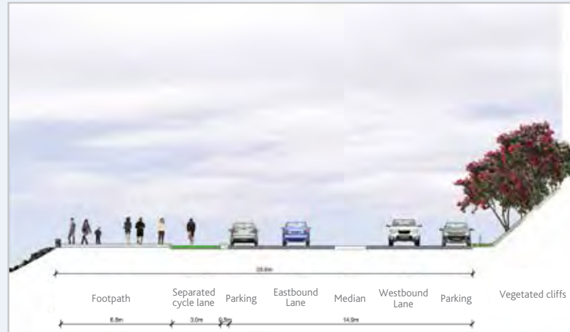
An example of how more space for leisure could be achieved.

However, the masterplan does propose that any future improvements to the road corridor should be designed and planned in such a way that it is sensitive to the special coastal setting. Transport design and planning will need to respond to the unique seaside character and Tāmaki Drive's special sense of place. This may mean thinking differently about scale and the types of materials that are used.