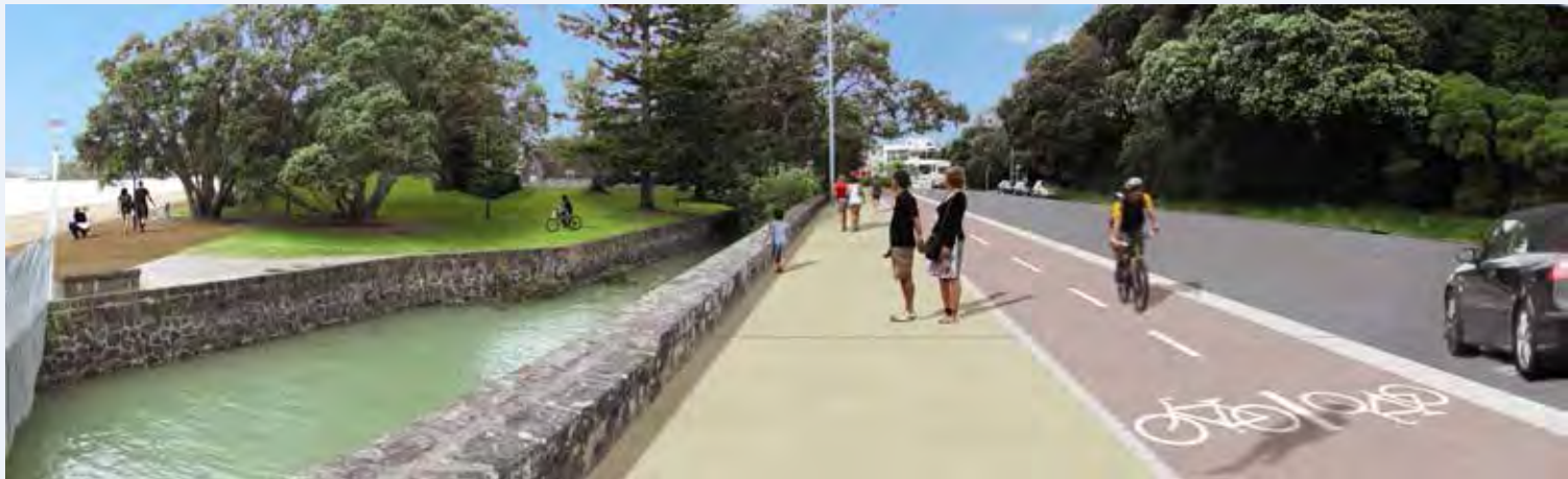
A future vision – arriving at Mission Bay and Selwyn Reserve.