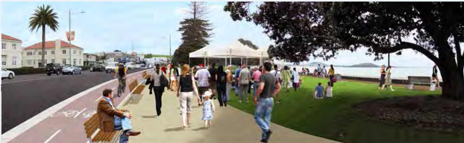
A future vision – arriving in Mission Bay from Kohimarama to enjoy a Farmers' Market.