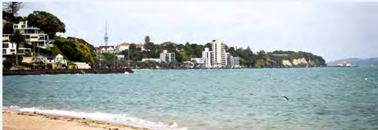
The Tāmaki Drive cliff line from St Heliers.