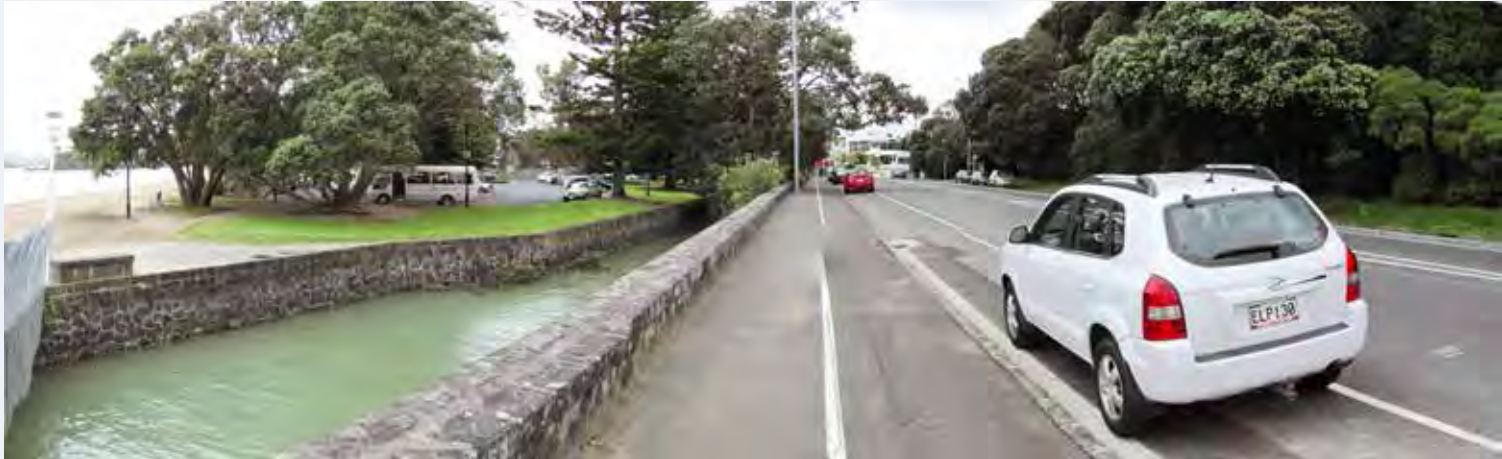
Existing situation – arriving at Mission Bay and Selwyn Reserve.