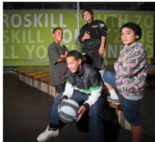
Roskill Youth Zone facility located in Wesley