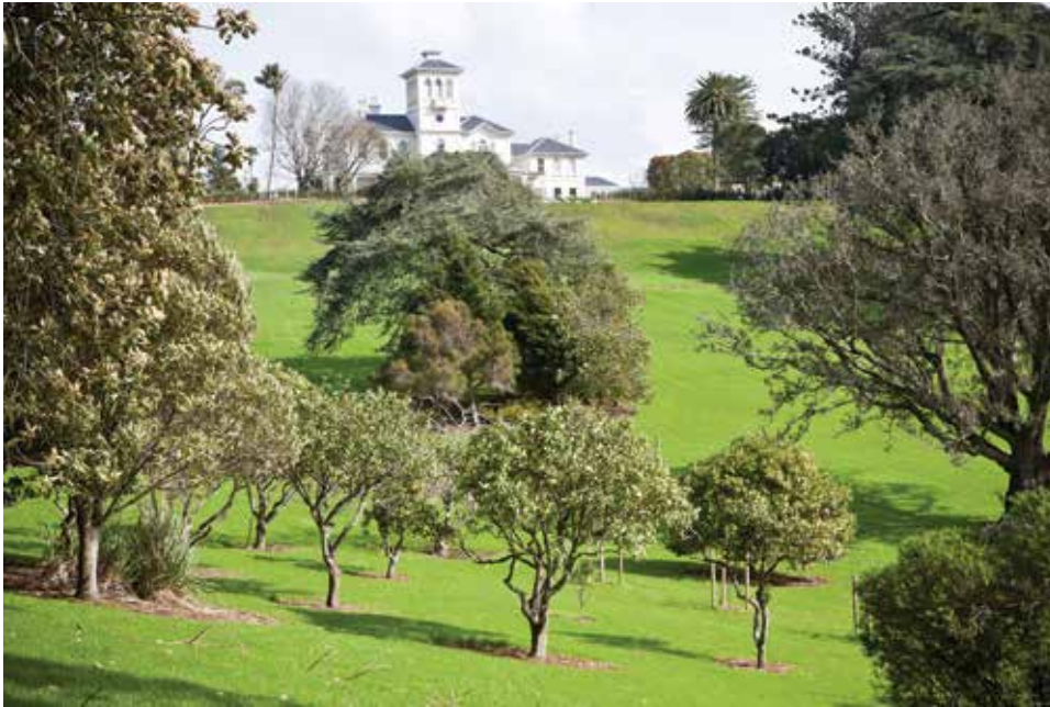
Pah Homestead - Puketāpapa's most prominent and celebrated heritage site