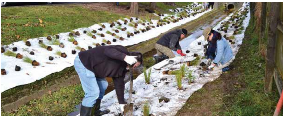
Members of the community planting the wetland at Molley Green Reserve

We are happy with the works that have happened at Molley Green Reserve and more importantly the community that has rallied around it. We have enjoyed working with local residents to form the 'Friends of Molley Green Reserve' group, who are actively involved in improving the reserve and making it a safer and better place for the community. Complementing the improvements that have been funded by the Local Board is a mural designed, painted and funded by some talented young local residents, which has contributed to lifting the profile and local stewardship of this reserve.