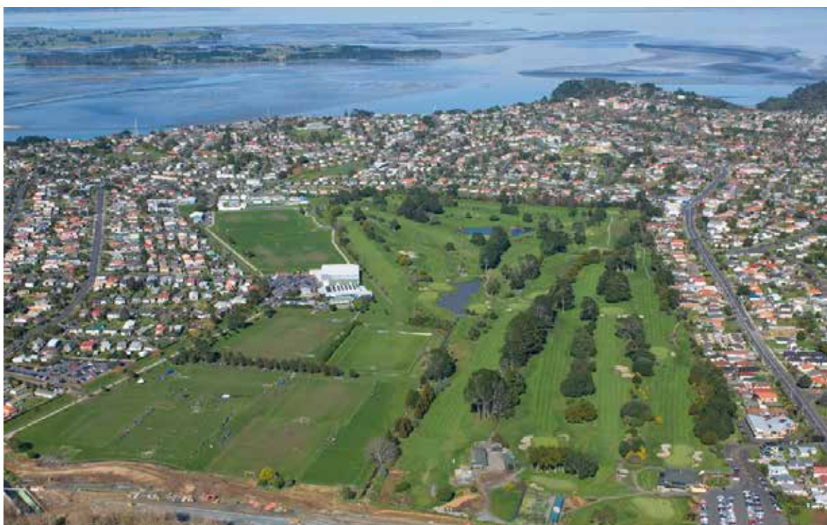
Aerial photo of Keith Hay Park and Akarana Golf Course, Mt Roskill

We have joint funds with the Albert-Eden Local Board, for a new bridge that will cross over Oakley Creek connecting both Underwood and Owairaka Parks and the communities of the two local board areas. Resource consent for the bridge is being sought currently. This important connection is a key link in the Puketāpapa Greenways Network.