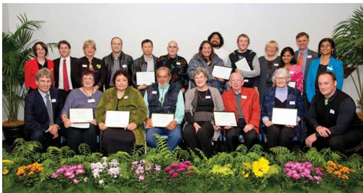
Puketāpapa Local Board members with Puketāpapa Community Awards 2012 recipients