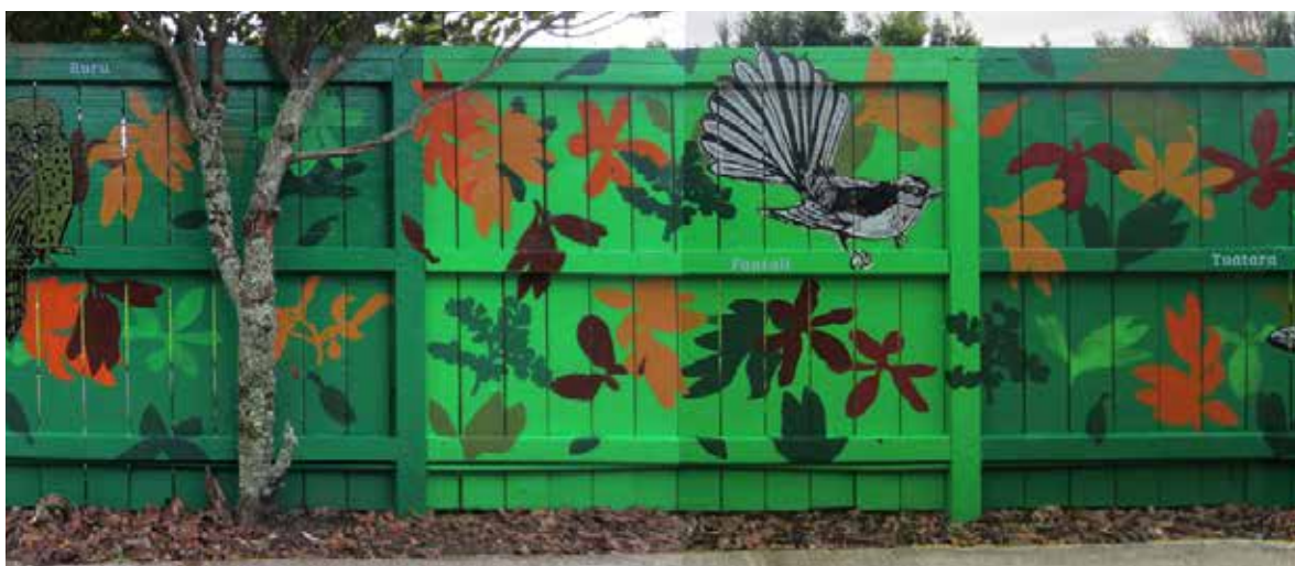
Mural at Bob Bodt Reserve

To improve the aesthetics of the narrow driveway entrance to Bob Bodt Reserve, we supported some improvements that included replacing the garden bed with low maintenance plants and arranging for the painting of a mural contributed to by the kindergarten children located on the reserve. We hope the involvement of the local kids will nurture their sense of ownership and pride in their local reserve. We are currently working with the kindergarten to look at establishing a small community garden in the reserve.