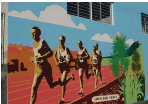
Mural at corner Keystone Ave and Dominion Rd