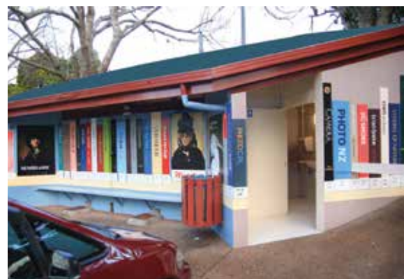
Mural on toilets opposite Mt Roskill library