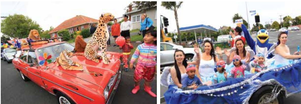
Puketāpapa's celebrated its first Santa Parade in November 2011

A key priority of the Board is to empower and grow the capacity of our community to deliver events that bring out the best in our people and proudly showcase our ethnic and cultural diversity.