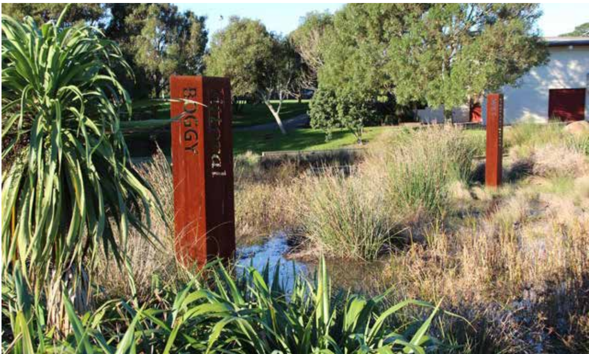
Improvements at Lynfield's Margaret Griffen Reserve

Margaret Griffen Reserve is located in the heart of the Lynfield community. We have continued to build on previous improvements made in recent years including the construction of a wetland area, through the installation of new seating, picnic tables, litter bins, art work elements and replacement of the playground. These artworks comprised of a 'farm' fence and turn stile representing the former Griffen Brothers strawberry fields, a concrete path with an artistic steel inlay of native flora, fauna, fish and birds and interpretative signage in the wetland. These signs represent the different functioning areas within the wetland and show the distance from the park to local significant features such as the Whau River.