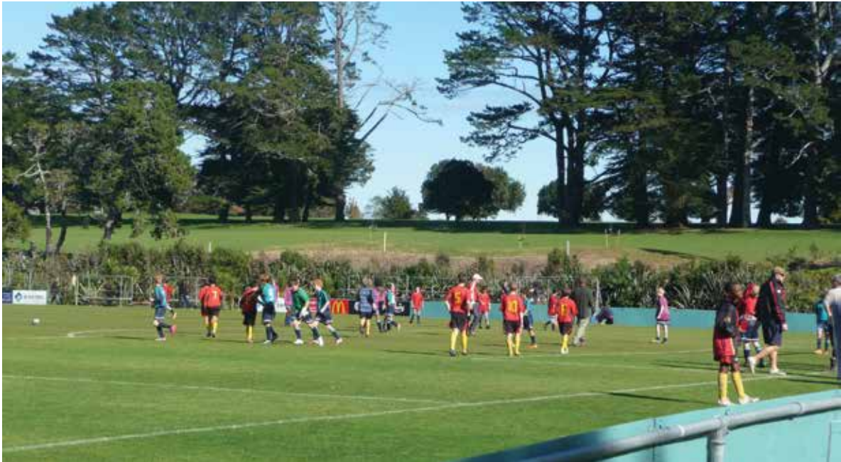
Football match on Mt Roskill's extremely popular and highly utilised Keith Hay Park