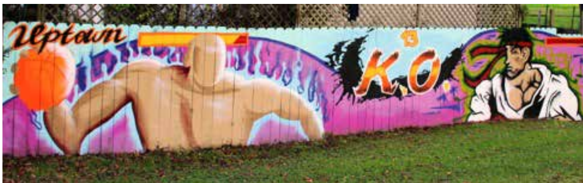
New mural at Turner Reserve

Participants were made aware of the Board's environmental priorities and the relevance to the reserves project through presentations on the Greenways Project and the environmental state of Puketāpapa. Valuable connections were established and a number of people indicated that they would like to be involved in various environmental projects, such as the proposed resource recovery centre.