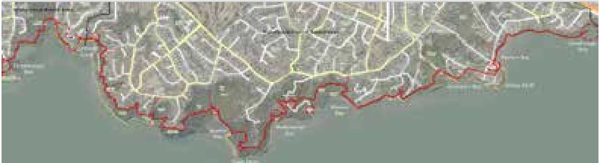
Manukau walkway preferred routes map

The implementation of the Network Plan is a major capital project for the Board, and we have confirmed funding of approximately $2.8 million over 10 years. Investigations into the first stage, Onehunga to Bamfield Place, have begun and we will consult with local community and other stakeholders further about this over the coming year. Further to this, a suite of directional signage will be developed for the whole network and a Wayfinder Project has been initiated to assess the information needs and frequency of signs.