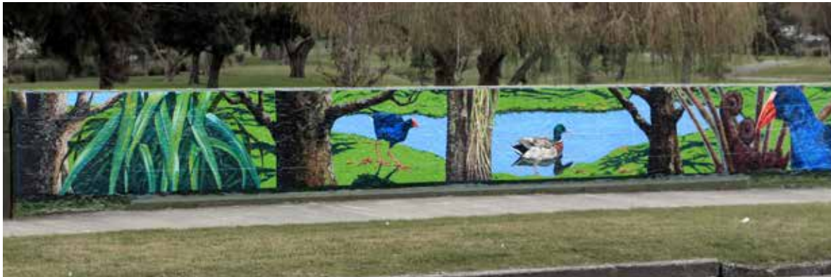
Mural along Sandringham Rd extension

Finally, the Board and Community Development and Safety officers have been supporting the Roskill Community Network (RCN) to transition to a community-led network. The focus is to develop the network, drive interest from members, and develop leadership to drive theme-based working groups. One of the working groups has been set up to focus on community safety.