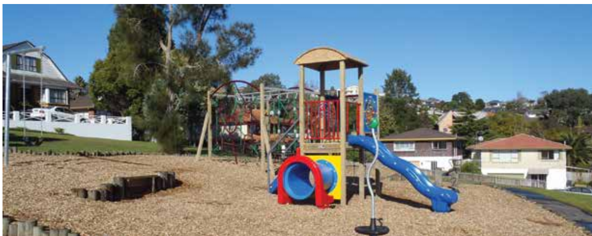
New playground at Stranolar Reserve

Residents surrounding this reserve actively submitted to the Board through the Local Board Plan process seeking improvements to the park to better meet the needs of the community. With this clear direction, we funded the maintenance of existing playground equipment as well as the installation of more challenging play equipment so that this playground caters for children of a wider age range. The new climbing cube, 'spika' spinner, new T-bar swing set to replace the old and new picnic table have really spruced up this playground and we hope the neighbourhood kids get to enjoy many hours of fun there. New park benches and a grove of fruit trees will also be added to the reserve to improve its amenity. A job well done to local residents whose advocacy made this happen.