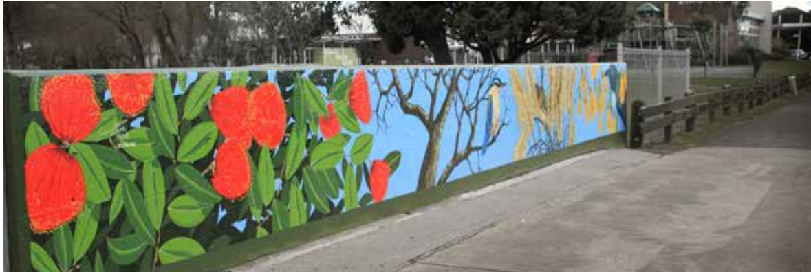
Mural along Sandringham Rd extension