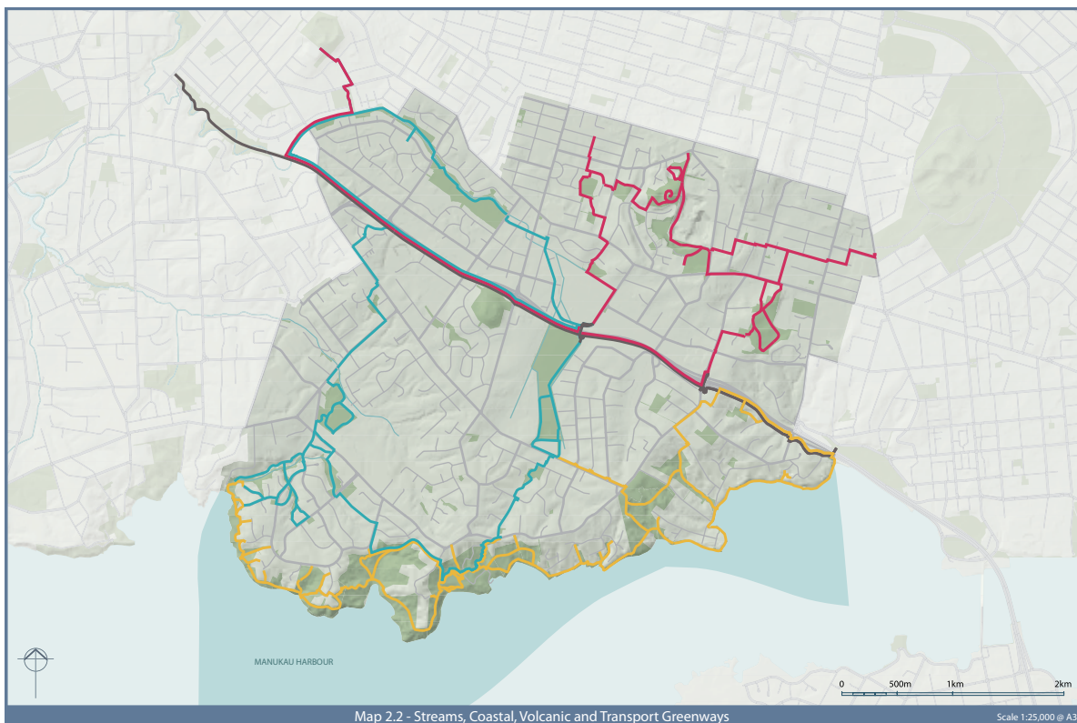
The interconnecting volcanic, stream and coastal 'threads' of the Puketāpapa Greenways Network

Along the greenways network opportunities exist for native planting, archaeological conservation, education through interpretative signage, stream daylighting and restoration, riparian planting, water quality improvements, reduced flooding, enhanced ecosystems, improved access to and along waterways and the coast, weed management, pest control, new track development and track upgrades, and improved signage.