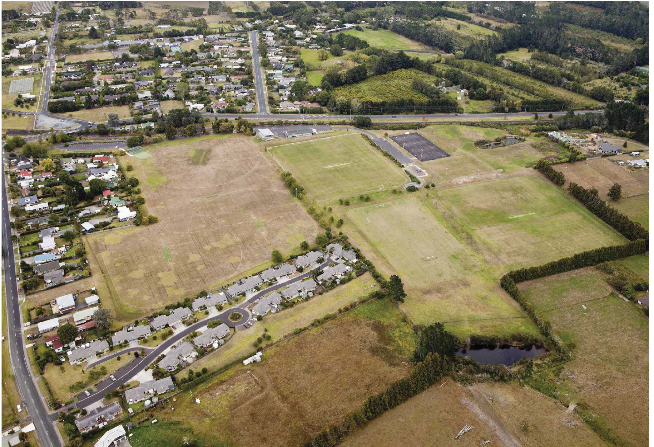
Huapai, view over Huapai Domain.