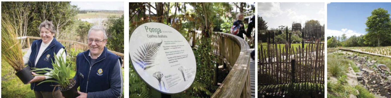
STREAMS AND ECOLOGICAL AREAS