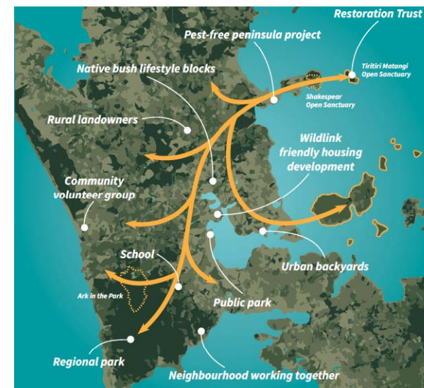
The North-West Wildlink, initiative by Forest and Bird.