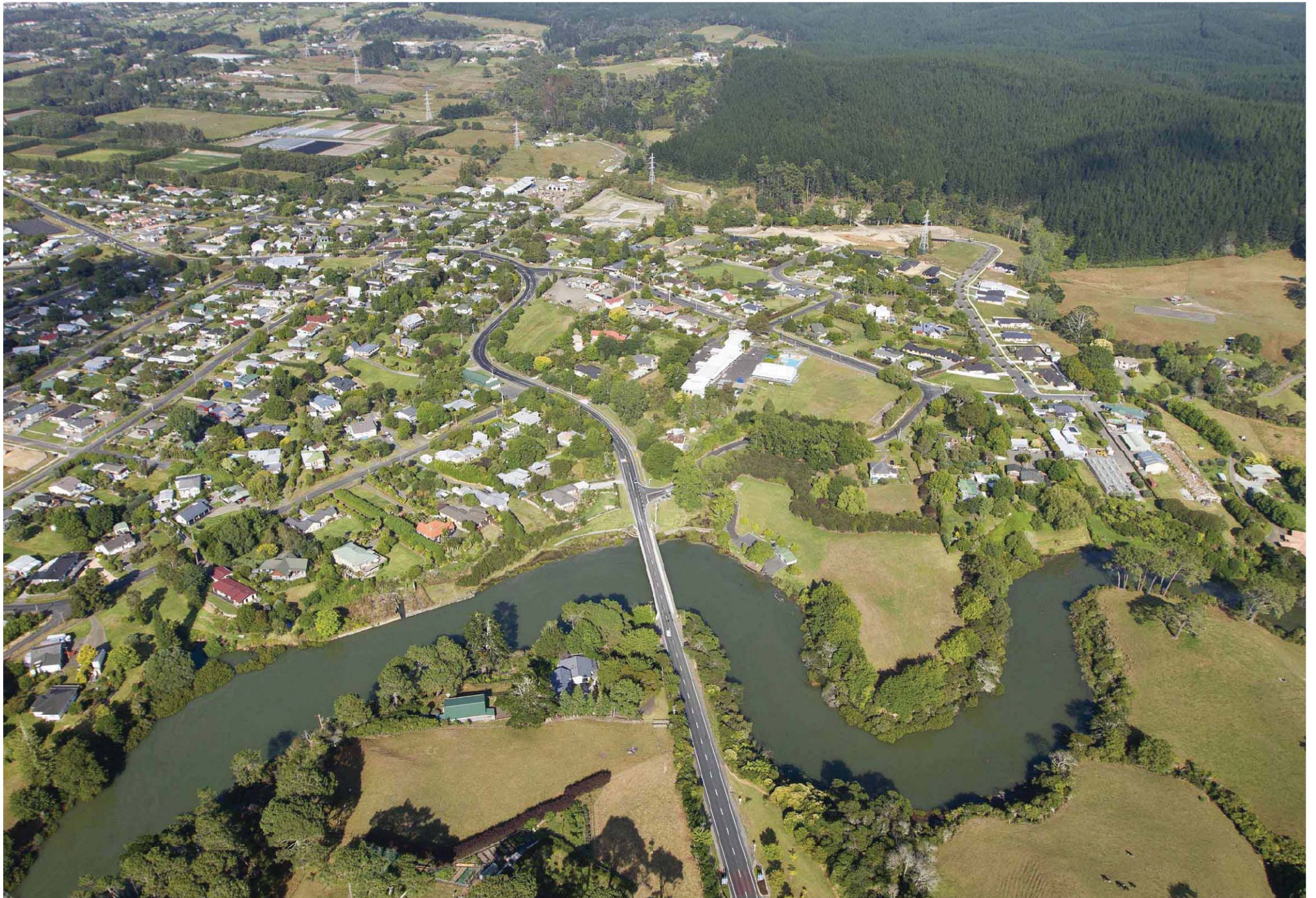
Riverhead, overlooking Rangitopuni Stream, the Coatesville Riverhead Highway shown centre image.