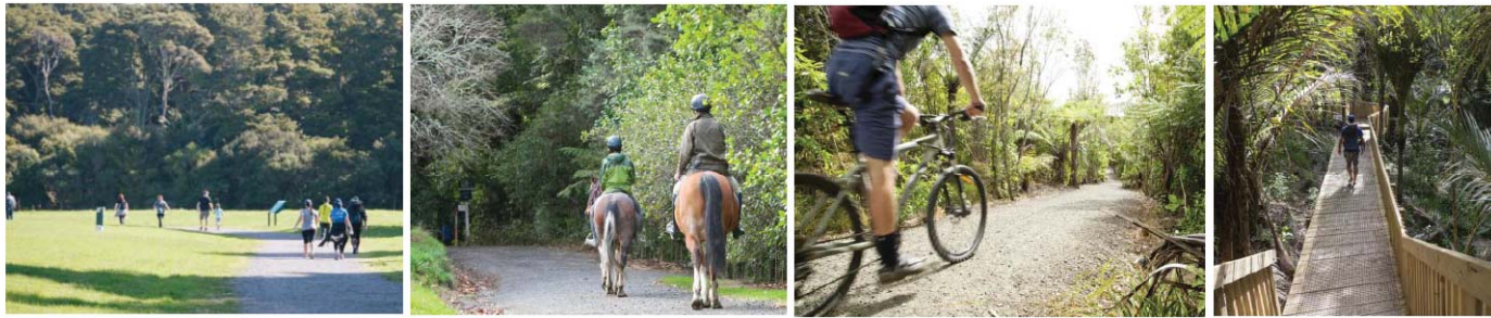
CONNECTIONS IN OPEN SPACES