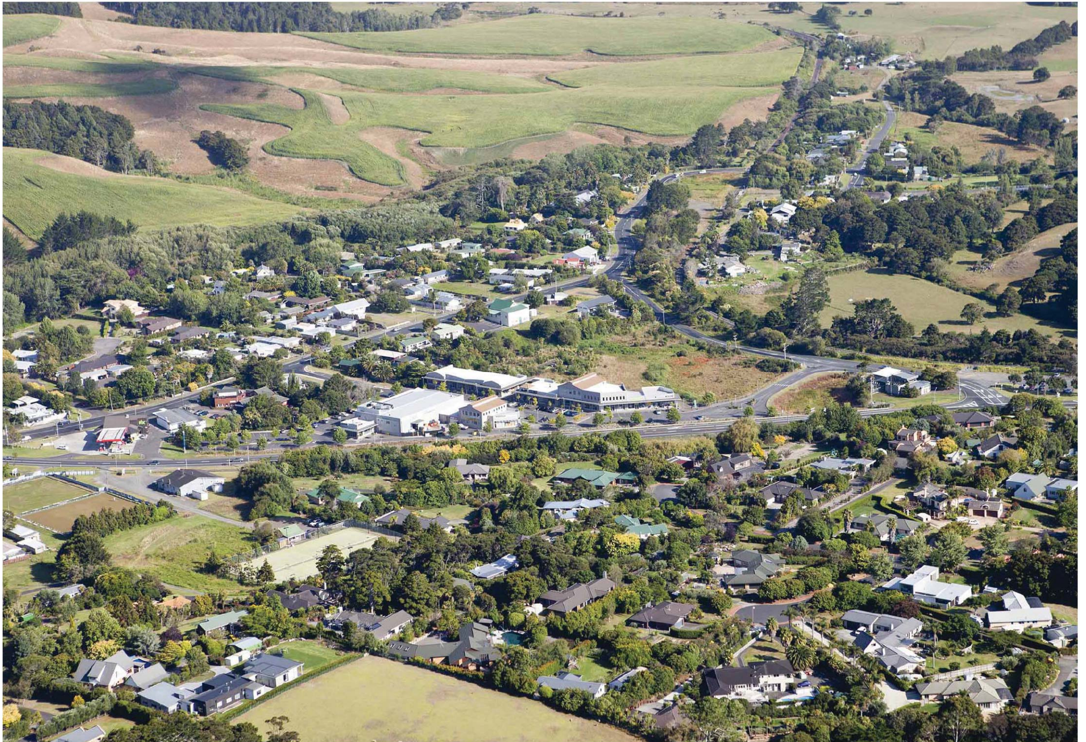
Waimauku, the Waimauku Tennis Club on the right, Waimauku Village in the centre.