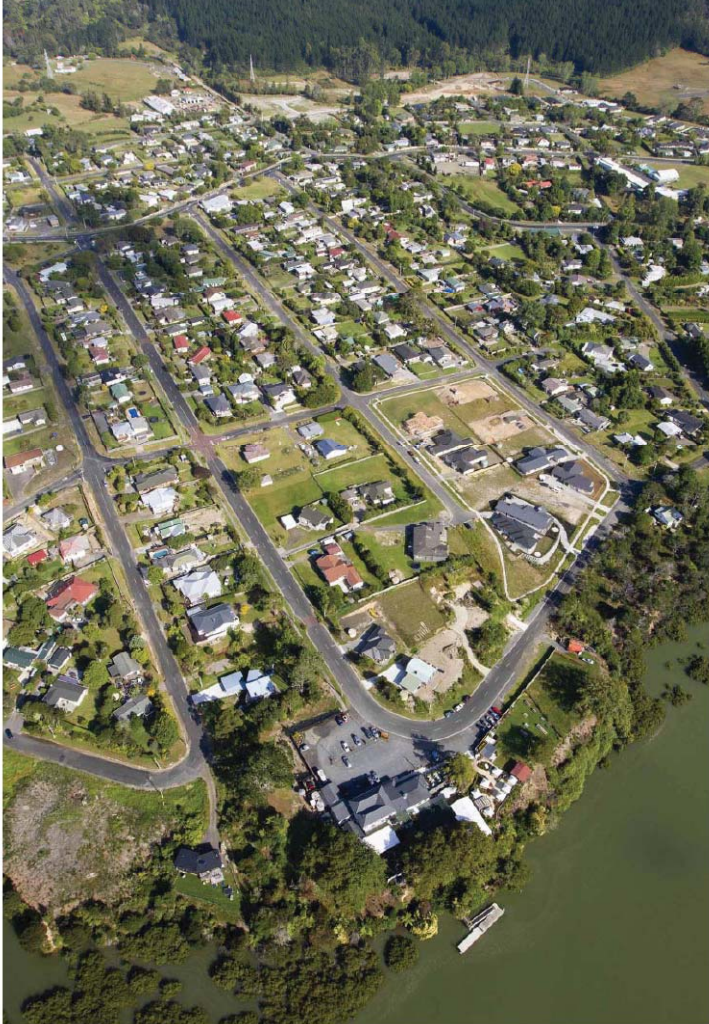
Riverhead, overlooking Riverhead Tavern, Riverhead Forest top of aerial photo.