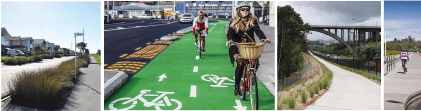
CONNECTIONS IN STREETS and TRANSPORT CORRIDORS