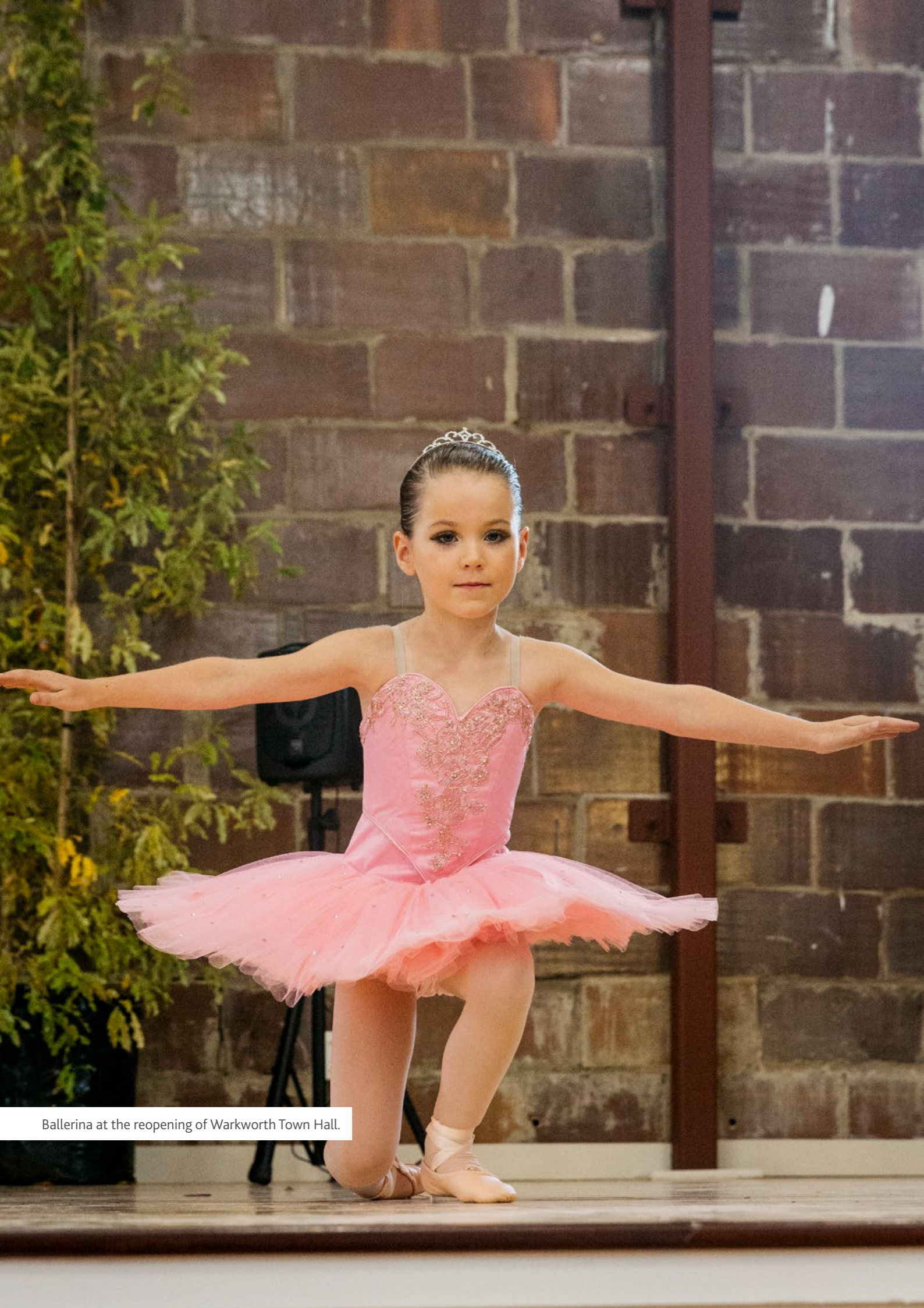
Ballerina at the reopening of Warkworth Town Hall.