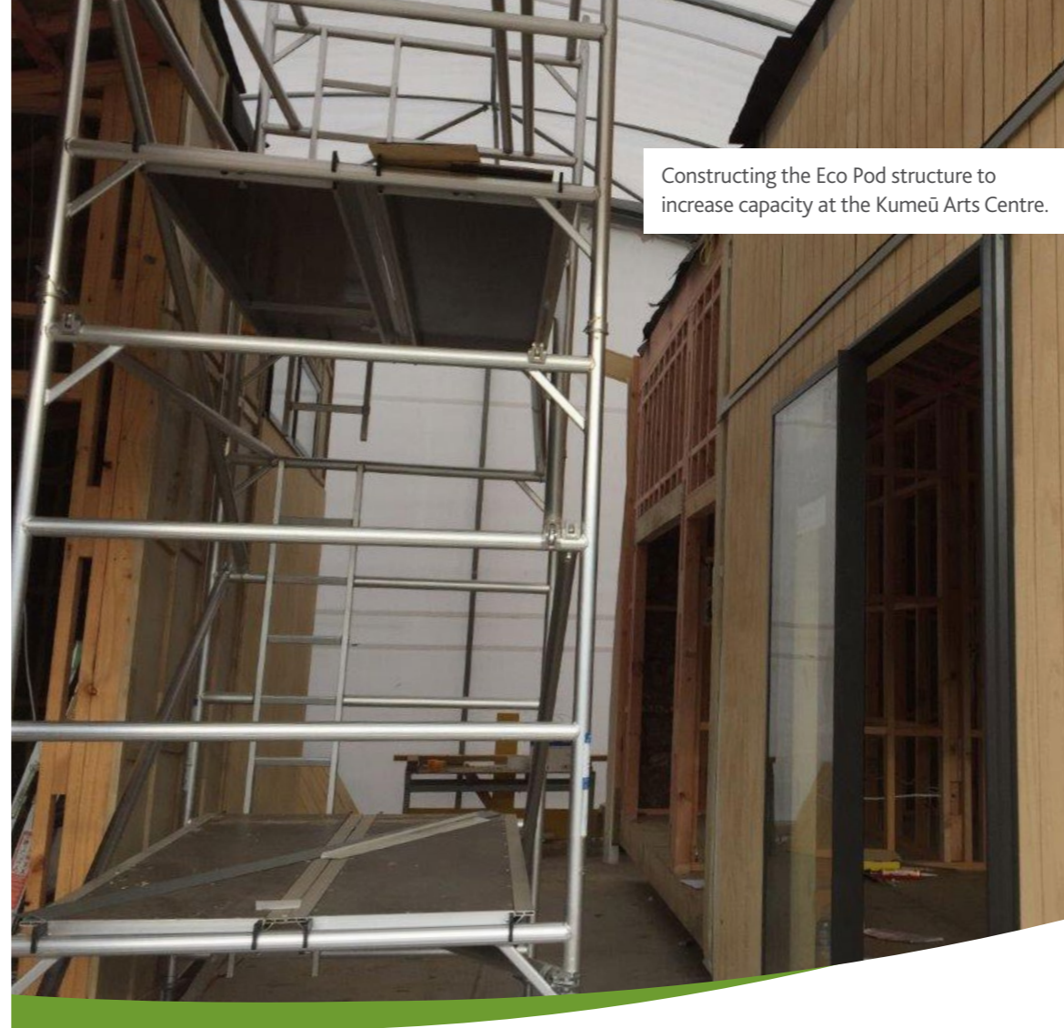
Constructing the Eco Pod structure to increase capacity at the Kumeū Arts Centre.