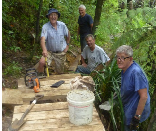
Matheson Bay Neighbourhood Association members upgrading the Kohuroa Stream Track.

Projects like the Helensville Community Recycling Centre are a great example of community empowerment. At the centre, people learn how to repair bicycles, farm machinery and furniture, under the guidance of a skilled volunteer, putting the items back into use and for sale at the centre's shop. The local board was very proud this term to be able to successfully advocate for the recycling centre to stay on the piece of land they have been using for the past few years and save the centre from council plans to sell the land and move the centre elsewhere. The local board was successful in working with various council departments to ensure the recycling centre got the best outcome. The local board would like to see more community recycling centres established and thriving in other parts of Rodney.