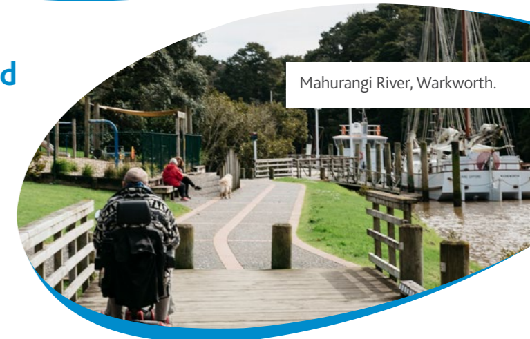
Mahurangi River, Warkworth.

Applications for the fund are assessed on several criteria, primarily being the environmental benefits but also feasibility and good practice, community benefits, and the applicant's contribution. By the end of the first year, over 43,000 plants had been provided for planting, and 322,563m 2 of land was fenced off because of this fund. The fund was oversubscribed during the first round of applications in the 2018/2019 year, with applicants wanting to erect a further 11,000 metres of stock-proof fencing to protect 20 hectares of riparian margin. There is clearly a great demand for this environmentally focussed initiative. The local board is proud to have started such a worthwhile enterprise which will pay large dividends in future years with increased water quality in our streams, rivers and harbours.