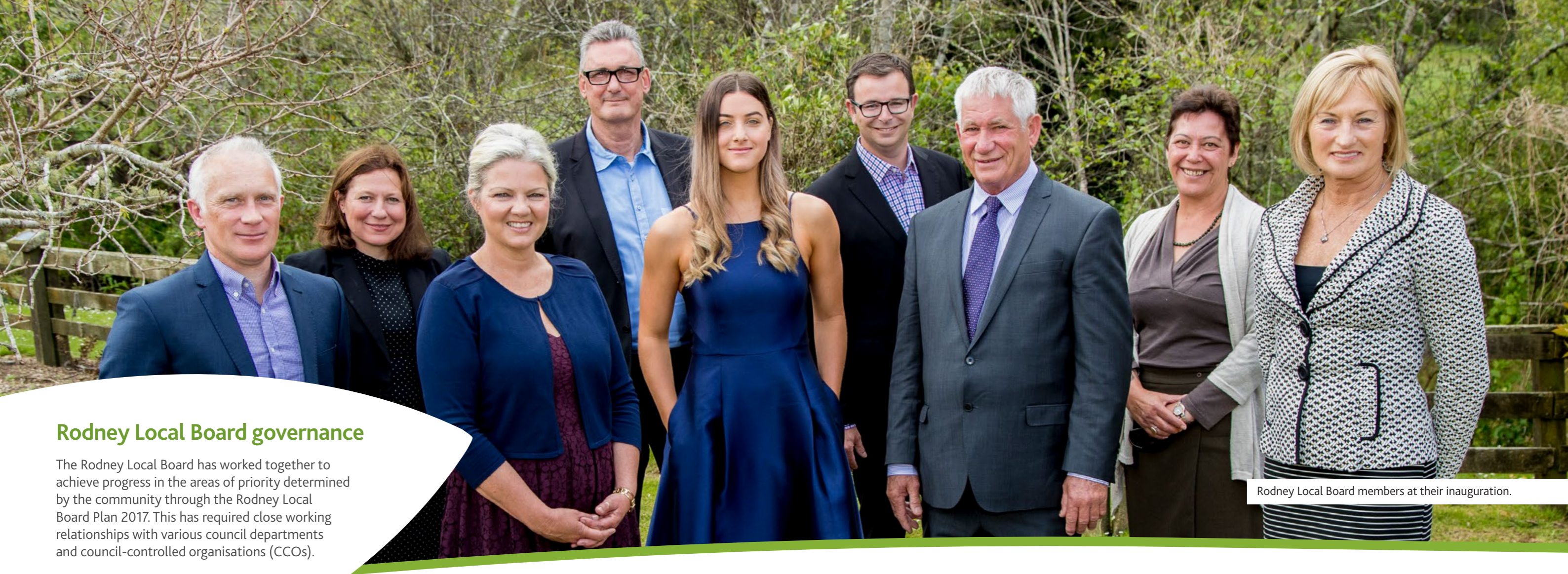
Rodney Local Board members at their inauguration.