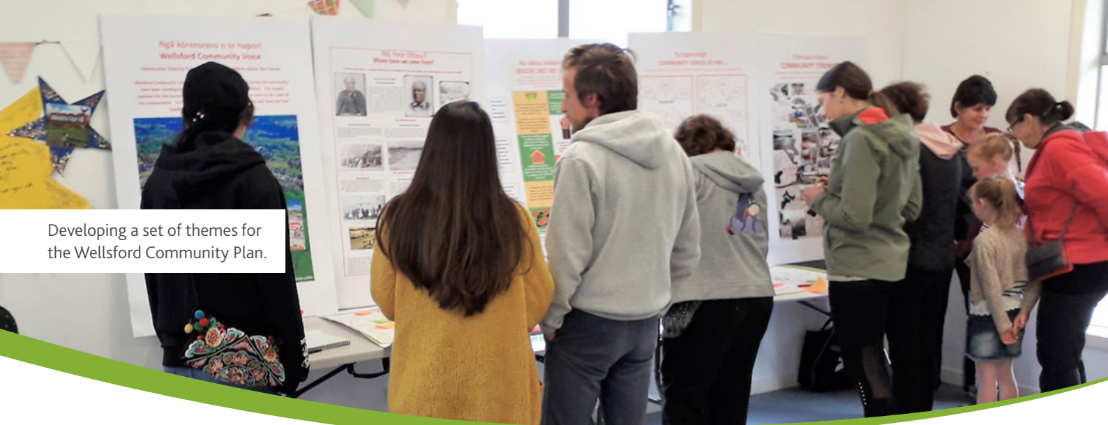
Developing a set of themes for the Wellsford Community Plan.