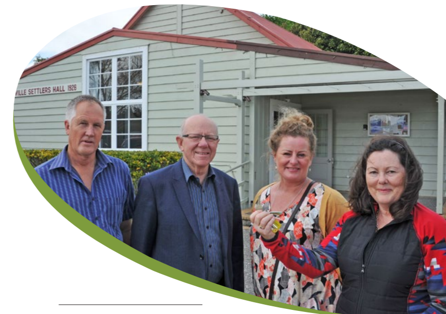
Coatesville Hall committee

The local board continues to work with passionate community groups to ensure that our halls are well utilised hubs for everything from community meetings and bagpipes to bridge clubs and karate lessons. The local board were very proud to be able to reduce the fees and charges for hiring most of our council managed halls this term. The current charges place our council managed halls on par with the costs of private halls in the region.