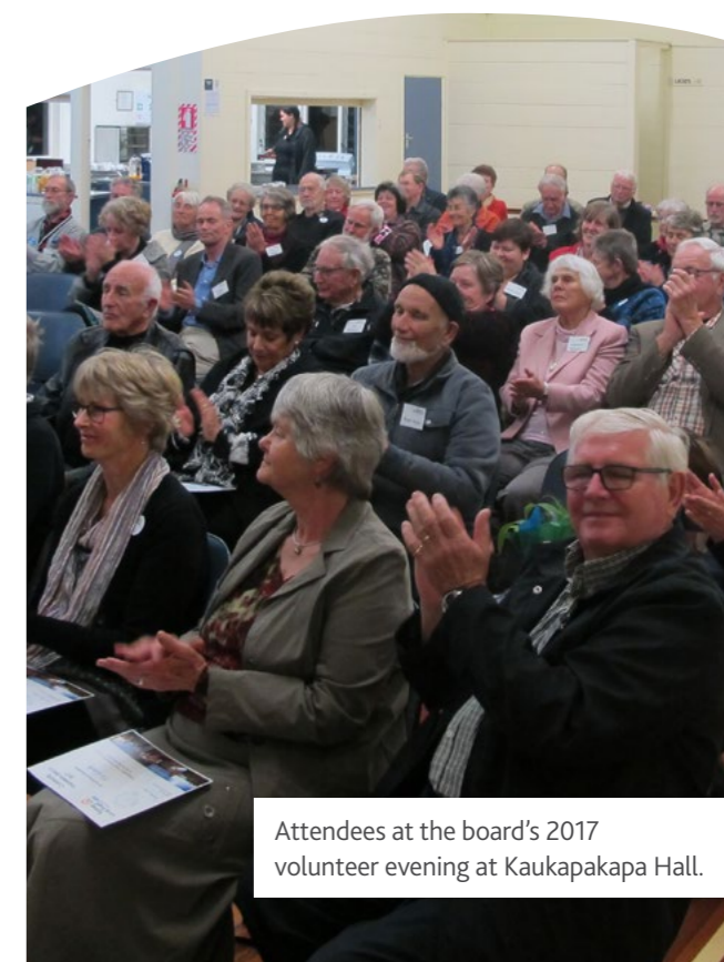
Attendees at the board's 2017 volunteer evening at Kaukapakapa Hall.