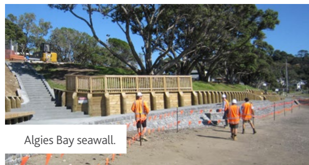
Algies Bay seawall.

Our local parks and sports facilities cater to a wide range of sporting and recreational interests.