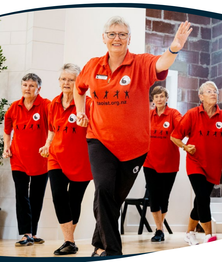
Reopening of Warkworth Town Hall.