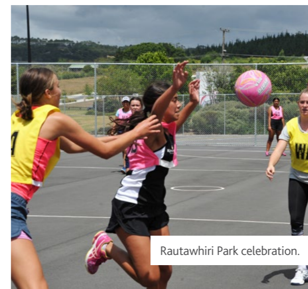
Rautawhiri Park celebration.