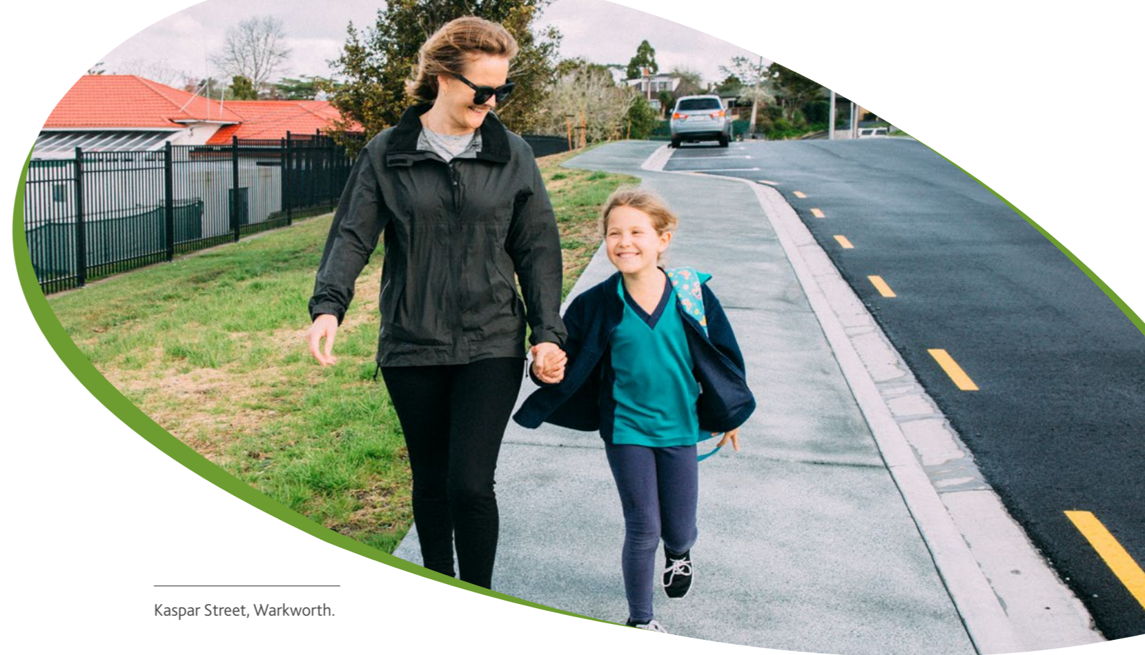
Kaspar Street, Warkworth.

Additionally, the local board launched its own services this term from Wellsford to Warkworth, and from Helensville to Silverdale (via Kaukapakapa) using the transport targeted rate. Now many communities can catch public transport to anywhere in Auckland, from Wellsford to Pukekohe, something we have never been able to do before. The local board are also excited to be able to launch the service from Westgate to Albany, servicing Riverhead and Coatesville in May 2019 and give these communities back a service that they lost years ago. Even better, those with a Gold Card can make use of the free travel options with the appropriate AT HOP card, making public transport affordable and possible for so many Rodney residents. This is a momentous change for Rodney which has never had such an investment in public transport before. The local board is proud to have been able to deliver such a great leap forward this term.