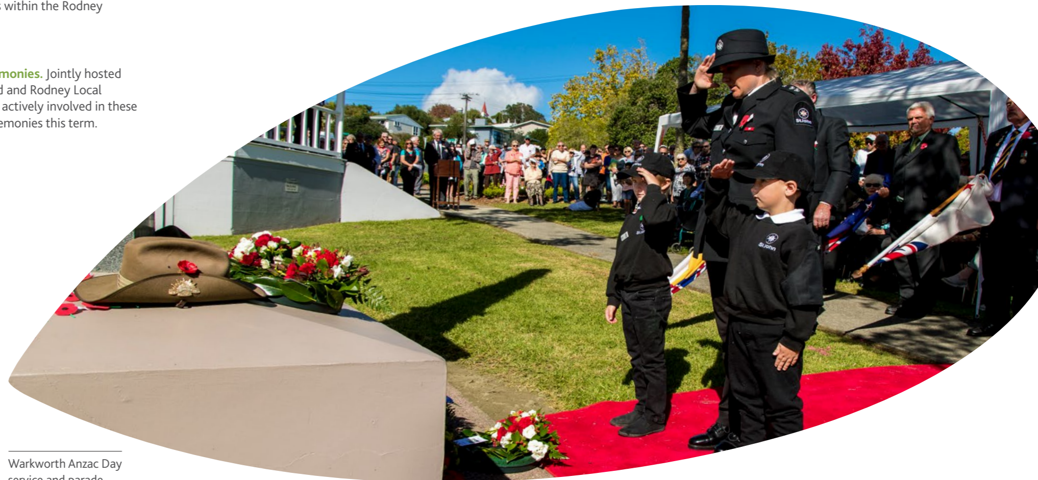
Warkworth Anzac Day service and parade.