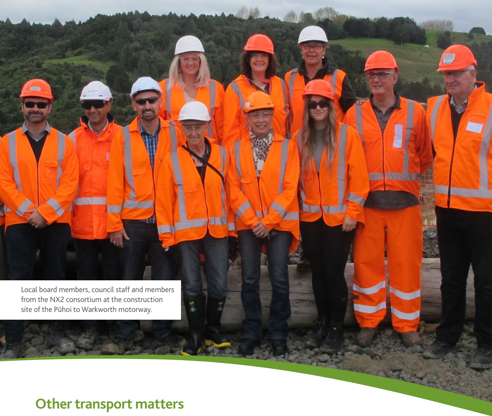
Local board members, council staff and members from the NX2 consortium at the construction site of the Pūhoi to Warkworth motorway.