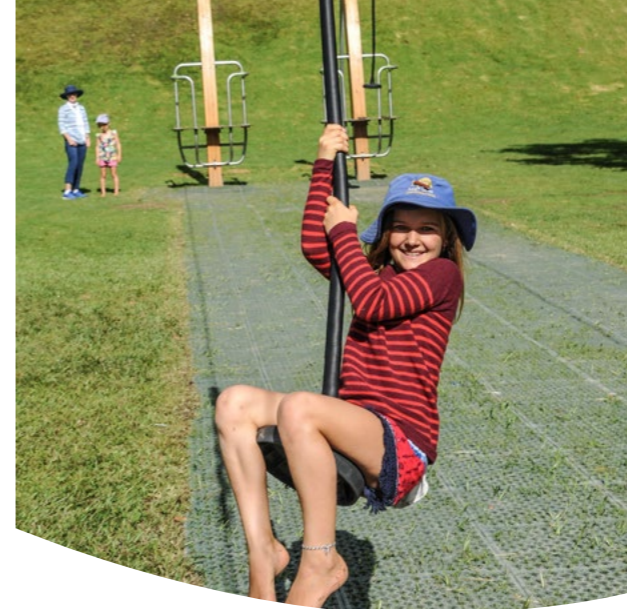
Lucy Moore Park.

Northern area citizenship ceremonies. Jointly hosted by Hibiscus and Bays Local Board and Rodney Local Board. Local board members are actively involved in these ceremonies. We have had 15 ceremonies this term.