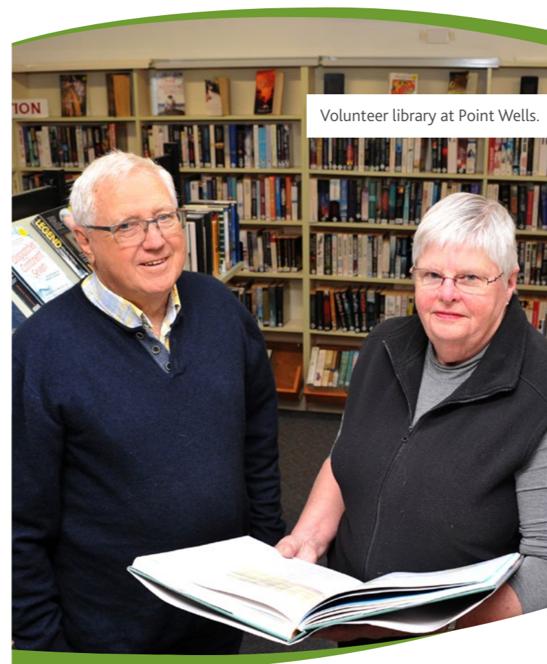
Volunteer library at Point Wells.