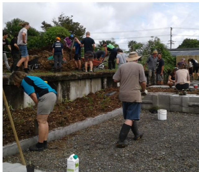
A community planting day at the Huapai Hub.