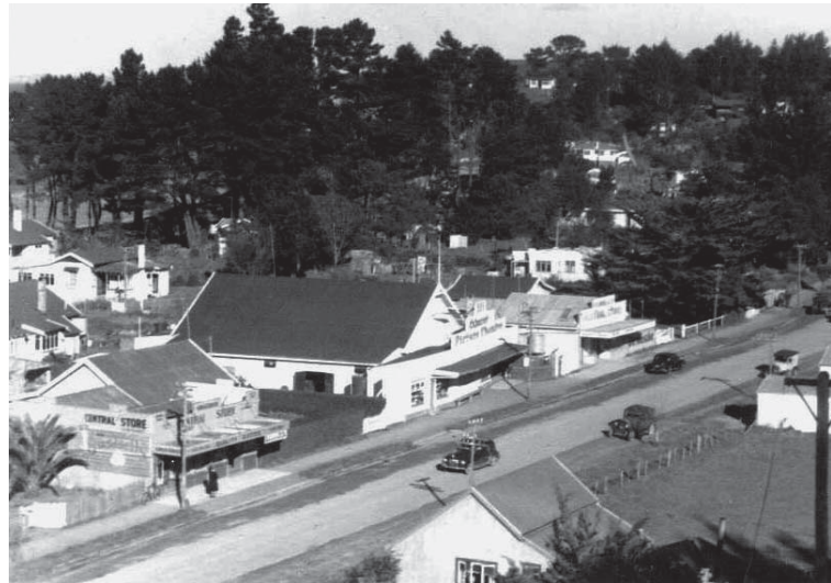
The 555 Theatre and Cabaret with the Central Store next door, 1946.