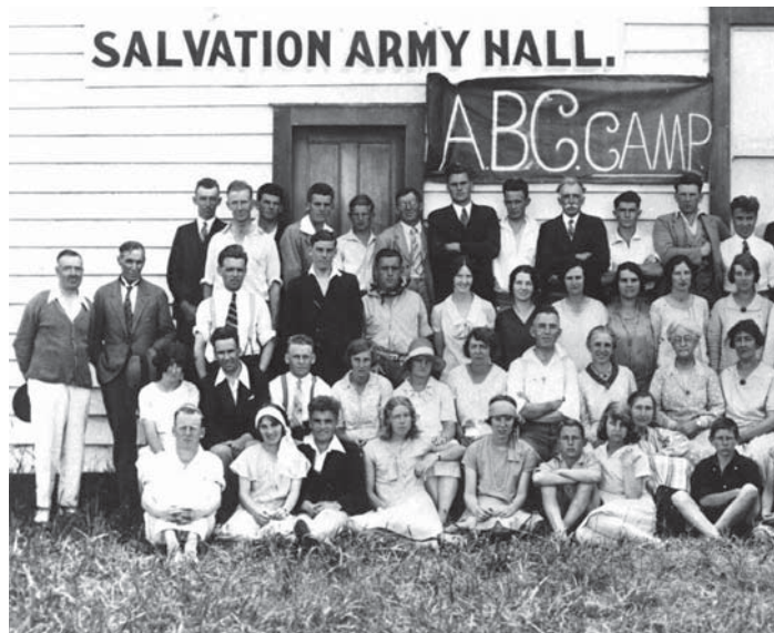
The camp was used by a number of groups including the brethren, shown here assembled outside the hall, c1929.

We hope you have enjoyed this heritage walk.