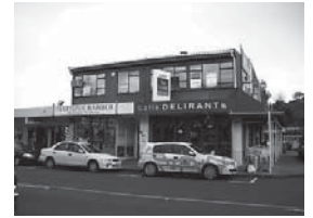
Venture Buildings, c1970.

The Venture buildings were erected in the early 1950s as retail and commercial space. Amongst the building's long-term tenants was the East Coast Bays Borough Council, who held their meetings on the first floor of this building until the 1970s when the new council offices opened in Glen Road. Early meetings were often the scene of heated debate providing entertainment for the many locals who attended.