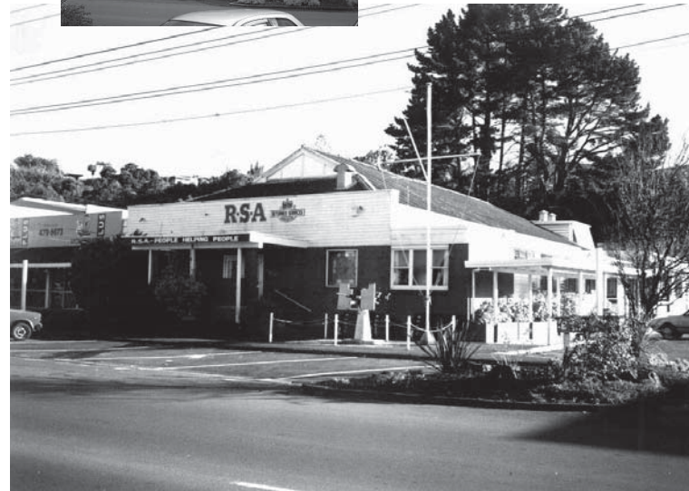
The original RSA building (with additions), as it appeared just prior to its demolition 1995. With a membership of over 3,000 the East Coast Bays RSA is one of the largest the country.