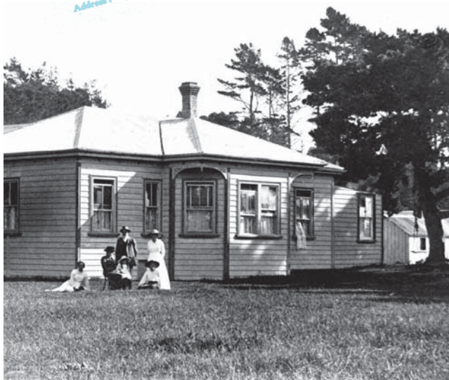
Facilities at the Brown guesthouse included the first local shop. The bay's first post office was run from a small room off the back verandah.