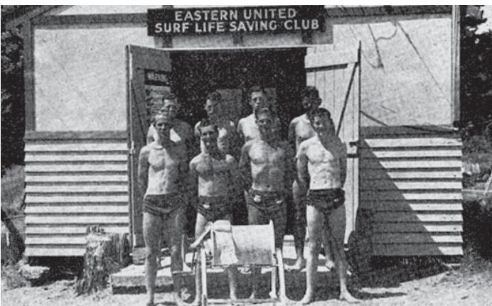
Members of the club outside the clubhouse, 1945.

In December 1932 the Browns Bay Surf Club was formed to serve the beaches from Long Bay to Campbells Bay. Two years later a clubhouse was built on a site provided by the Browns Bay Progressive and Ratepayers Association and the club became known as the Eastern United Surf Life Saving Club. The club held regular life saving demonstrations and met with success at numerous national surf life saving championships. Falling membership saw the club join the North Piha Surf Club, and in 1979 the surf club building was demolished.