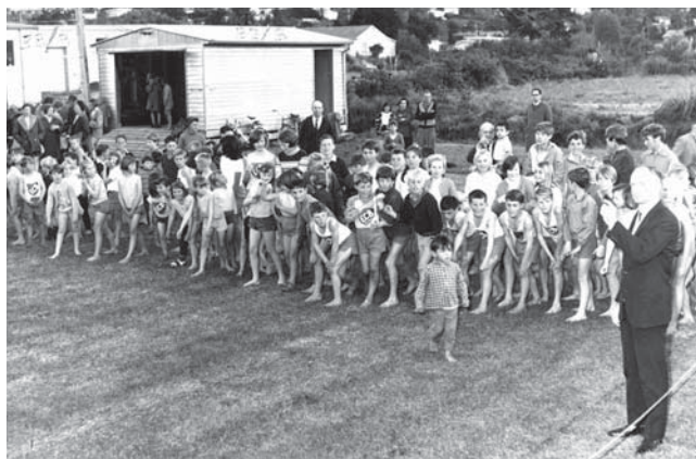
Children of the East Coast Bays Athletic Club await the starting gun at Freyberg Park.