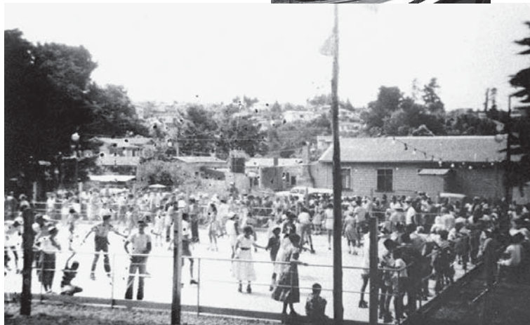
Skating at the rink, 1955.