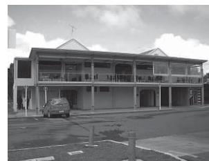
Original Progress Hall with members of the Browns Bay Progressive and Ratepayers Association.

Walk down the side of the Progress Hall and over the footbridge. Then proceed down onto the beach where the World War II machine gun emplacement can be seen under pohutukawa trees growing just above the beach.