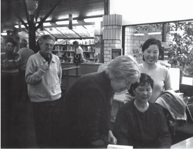
East Coast Bays Library interior.