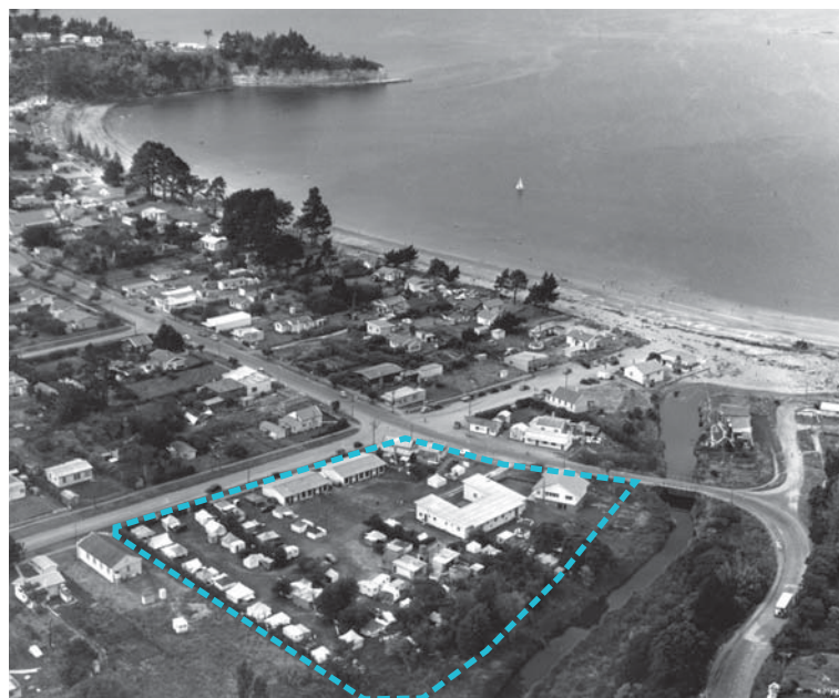
Brouns Bay Camping Ground, January 1953. Photo courtesy of Geosmart neg. 32323.