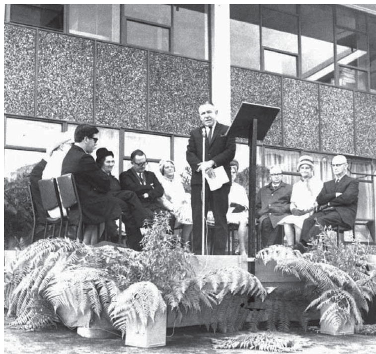
Opening of the East Coast Bays Borough Council building. Norman King, M.P. is speaking.

In the early 1970s this building was erected as the first purpose-built home of the East Coast Bays Borough Council, the third local body to serve the area. Local government at the bay dates back to the 1860s when the area was gazetted as part of the Lake District, and in 1876 administration passed to the newly formed County of Waitemata. The county comprised of an enormous area measuring some 600 square miles (1550 square kilometres). By the early 1950s it was clear that the growing eastern area of the county required a more truly local government. A petition signed by nearly half of the eligible voters in the area was sent to the Ministry of Internal Affairs, and in 1954 Browns Bay became part of the new East Coast Bays Borough. The new borough council, serving a population of 7500, presided over an area with poor roading, few footpaths and no water reticulation, sewerage or refuse collection services. The years that followed saw an improvement in local amenities and services, while the opening of the Auckland Harbour Bridge encouraged rapid population growth. Browns Bay had the largest area of flat land in the East Coast Bays area, and was the commercial hub of the borough. In 1975 East Coast Bays attained city status. The year 1989 brought further changes when the East Coast Bays area was amalgamated as part of the new North Shore City Council area.