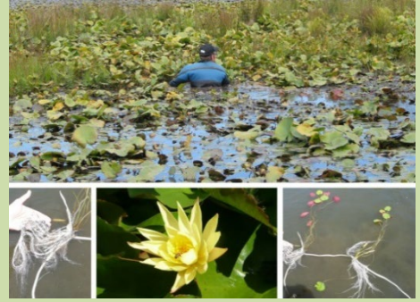
Rohan Wells, NIWA

Mexican water lily is a perennial bottom-rooted aquatic herb with floating heart-shaped leaves and yellow flowers borne above the water surface from October to December. It forms dense mats which can reduce dissolved oxygen levels in the water column by preventing gas exchange between water and air, and may suppress submerged aquatic plants by shading. Impacts on fish, zooplankton and other species resulting from low dissolved oxygen are probable.