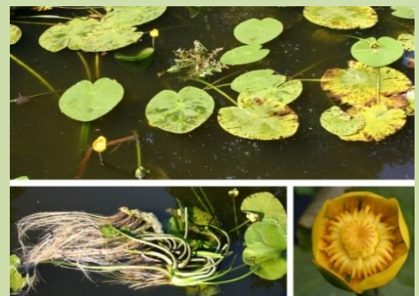
Rohan Wells, NIWA

Yellow water lily is a perennial aquatic plant with both floating oval leaves and submerged very thin leaves. Flowers are yellow and held above the water surface in spring-summer. Dense mats may suppress submerged aquatic plants by shading and can have indirect impacts on plankton by providing refuges from fish predation. Invasion can alter patterns of nutrient storage in sediment and may reduce dissolved oxygen levels in the water column.