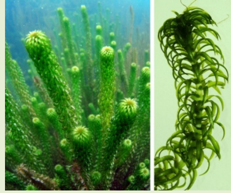
Rohan Wells, NIWA

Oxygen weed is a bottom-rooted submerged perennial aquatic herb with downward curving leaves, arranged in spirals on the stem. It is capable of forming dense stands; displacing native aquatic herb species, altering habitat availability for fish and invertebrates, and affecting dissolved oxygen levels by reducing gas exchange. The stands also can impede recreational water access to water bodies.