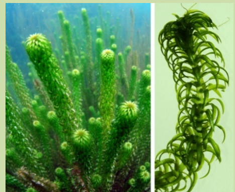
Rohan Wells, NIWA

Oxygen weed is a bottom-rooted submerged perennial aquatic herb with downward curving leaves, arranged in spirals on the stem. It is capable of forming dense stands; displacing native aquatic herb species, altering habitat availability for fish and invertebrates, and affecting dissolved oxygen levels by reducing gas exchange. The stands can also impede recreational water access to water bodies.