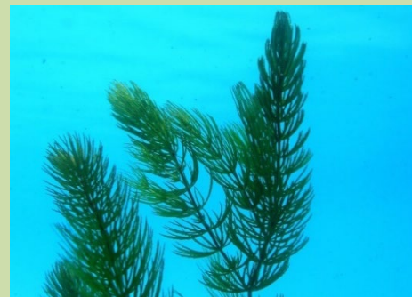
Rohan Wells, NIWA

Hornwort is a perennial submerged aquatic plant up to 7m tall which can be anchored to sediment by stems, or forms free-floating mats. Leaves are 10-40mm long, narrow, branched and whorled forming complex architecture. Hornwort forms dense monospecific stands which can displace all native submerged vegetation down to 15m depth. The dense stands alter water flow, increase flooding risk and impede recreational access of waterbodies. Because it can grow to greater depths than other aquatic pest plants, it is the species likely to have greatest impacts on deep-water charophyte meadows. Kōura are also likely to be especially impacted due to requirement for open habitat.