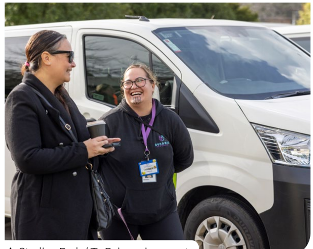
▲ Starling Park / Te Poi naming event

West Wave Aquatic Facility's comprehensive renewals programme, combined with the significant damage caused to the facility during flooding early in 2023, has led to ongoing closures of the facility while remediation work takes place. Understandably, this has impacted on visitor experience, and we expect there to be ongoing negative sentiment from the community until the facility reopens in the second quarter of the next financial year.