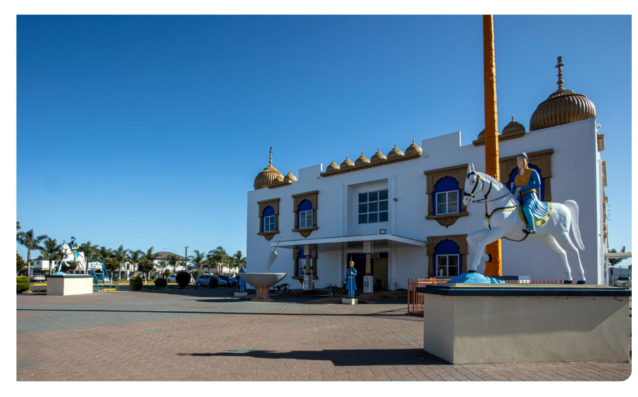
▲ Relationships continue to be forged with the Sikh community at Gurdwara Sri Kalgidhar Sahib at Takanini.

On the cover: The population of Papakura continues to be one of the most diverse across the city.