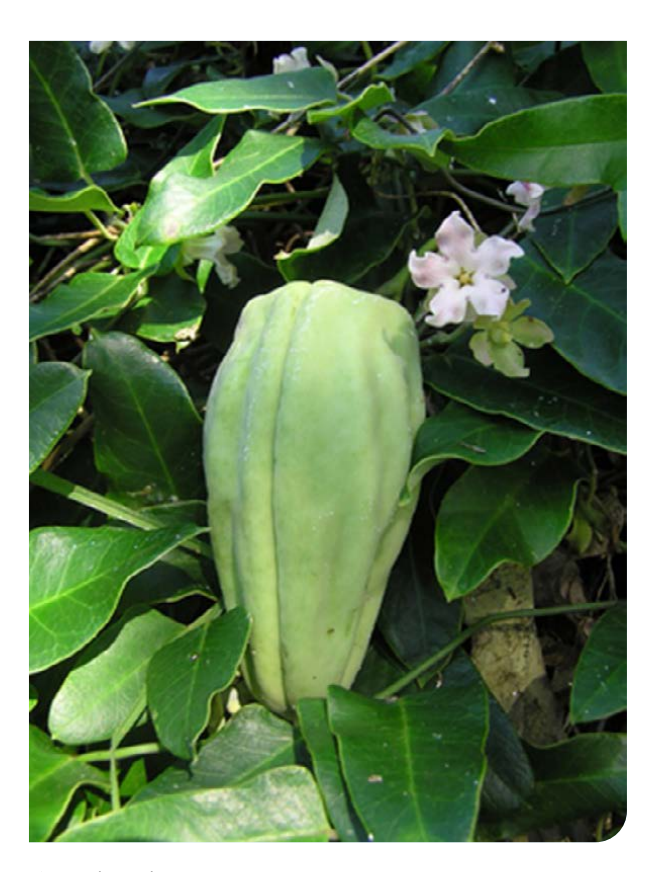
▲ Moth pod

When removing this weed from your backyard, remember to wear protective gloves and remove it from the roots along with any pods. Put them in a secure plastic bag and send to landfill via your regular council rubbish bins or through a community weed bin in your area.