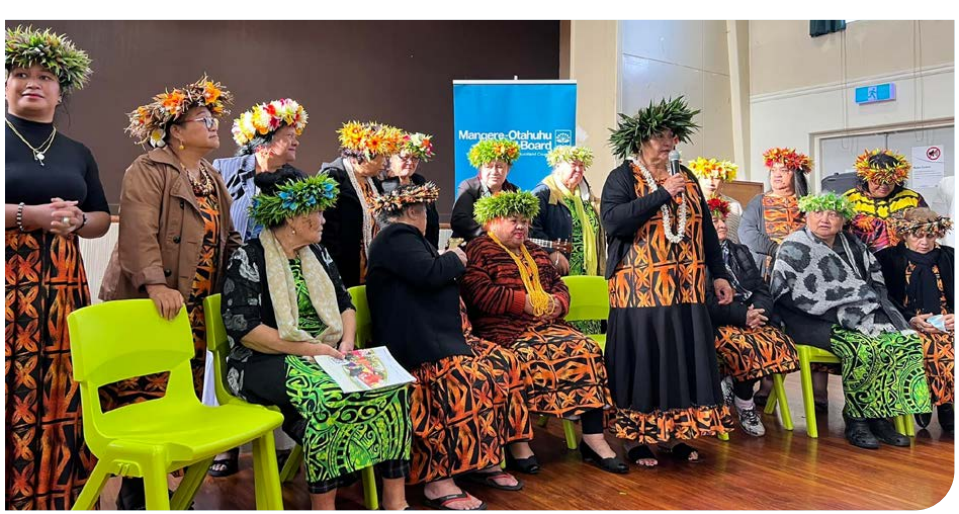
■ Age Friendly Directory Launch