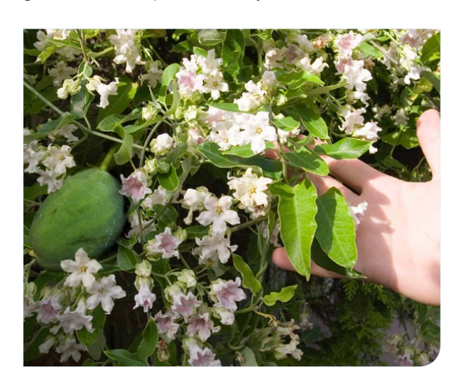
▲ Moth plant

"When we posted about the competition, lots of people chipped in with the location of moth plants on their properties, so the teams collected a pretty good number of pods," she says.