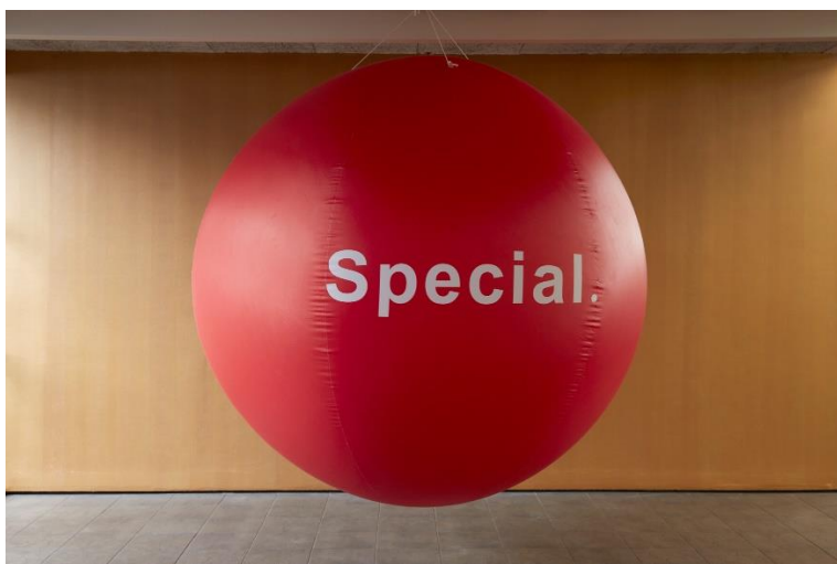
Elisabeth Pointon Special offer. , 2018 inflatable blimp and gold paint commissioned by Te Tuhi, Auckland

Benjamin Work created a wall painting which deconstructs the Tongan royal flag in order to address the adoption of imperial symbols, and the subsequent devaluing of traditional motifs, to fit within the narrative of civilisation imposed by the English, French and Spanish colonial powers. The work reverses this relationship by incorporating indigenous symbols of wealth and power.