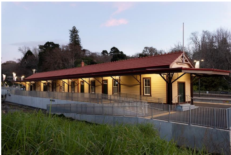
Te Tuhi Studios at Cheshire St

Te Tuhi Studios at Cheshire St are located within the Parnell Train Station Building, on the platform at 23 Cheshire St, Auckland. The complex includes studio space for up to nine artists in four shared spaces, and a test/gallery space. The studios contribute to a vibrant arts and cultural community in Auckland, combining principles of collaboration, experimentation and inclusiveness, and engaging with the wider arts sector and the general public through public programmes including open studios, exhibitions and events.