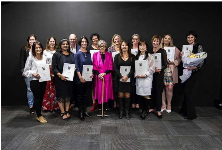
2019 Nanette Cameron School of Interior Design graduates

Art Today courses are year-long discussion groups. With no set programme, the course material and topics considered come out of current events in the art world, be they in Auckland, New Zealand, New York, London, Sydney or anywhere else. The discussion covers exhibitions to visit locally and interesting art places to visit overseas. Class trips are made to galleries in Auckland, and students have the opportunity to visit art events in other places with the group.