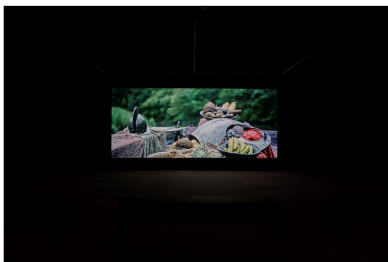
John Akomfrah Tropikos , 2016 (install view) single channel colour video, 5.1 sound 36 minutes 41 seconds

Te Tuhi strategically selects a range of artists from emerging talent to renowned international figures and offers them significant opportunities to create new work.