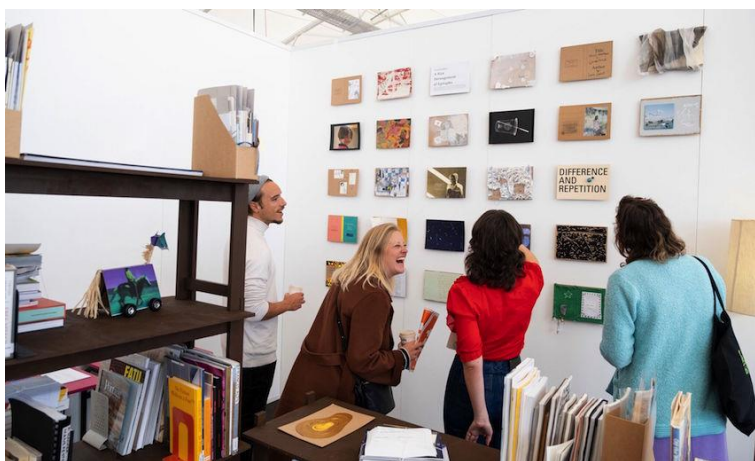
Samoa House Library Reading Room at Auckland Art Fair, in collaboration with Ngātahi

In 2019 Ngātahi members (Artspace Aotearoa, Corban Estate Arts Centre, Gus Fisher Gallery, McCahon House, Objectspace, ST PAUL St Gallery, Te Tuhi and Te Uru Waitākere Contemporary Gallery) presented a project at Auckland Art Fair in collaboration with Samoa House Library (SHL), an experimental arts library and open education platform established in response to the closure of the University of Auckland's specialist arts libraries. For the Fair, Samoa House Library presented a reading room, a transitory space that reflects the fundamental importance of research and criticality to contemporary arts.