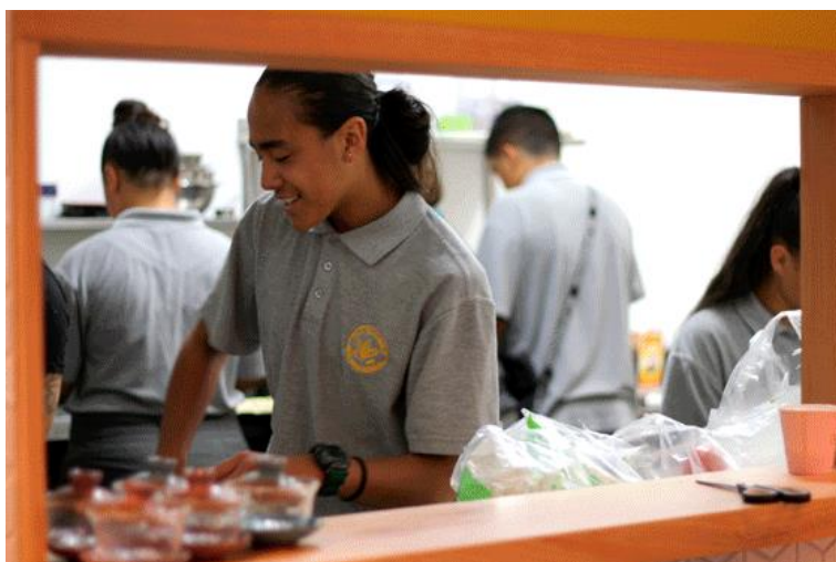
Ngā Tapuwae Young Creatives programme cooking their end of project banquet

Te Tuhi's Young Creatives programme is a series of peer-led projects working with young people who are not engaged in the arts to work collaboratively with artists and peers to explore their ideas and current issues, using a contemporary art framework and using contemporary art practices to communicate their ideas to a wider audience. In 2018 Te Tuhi piloted the programme with a group of students from Te Kura Māori o Ngā Tapuwae who are outside of the traditional high school environment. In 2019 Te Tuhi is working with a group of rangatahi from Youth Horizons, who are in out-of-home care.