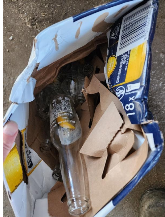
Cardboard box full of beer bottles