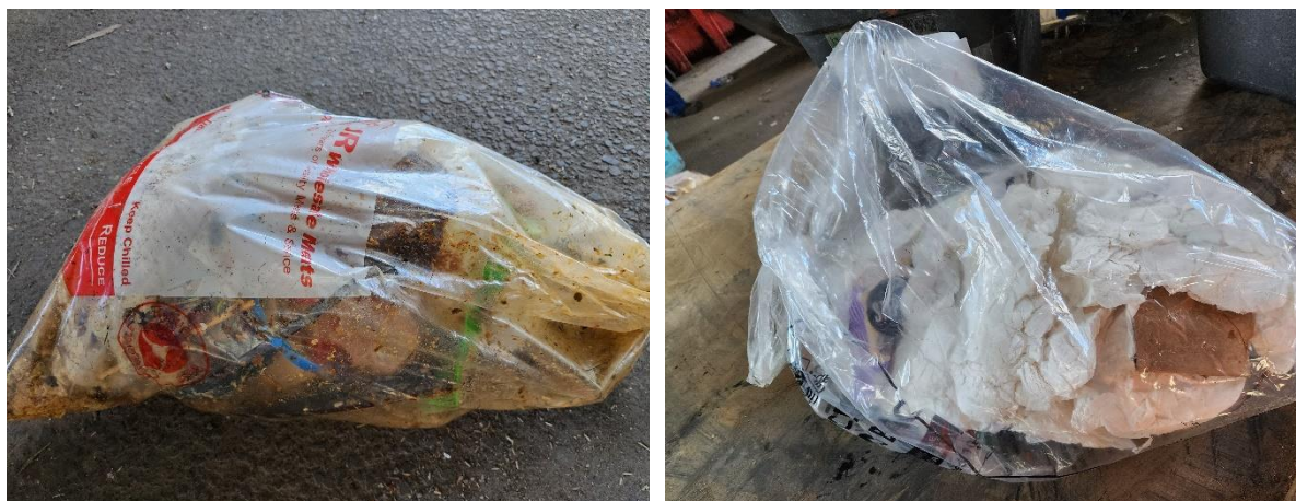
Example of bag containing mostly contamination Example of bag containing mostly contamination