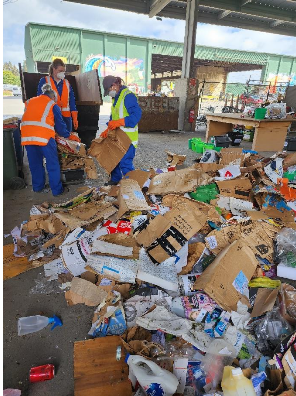
Pile of recycling with cardboard being removed for weighing