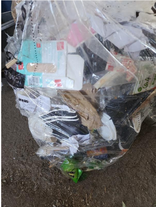
Example of bag containing some contamination