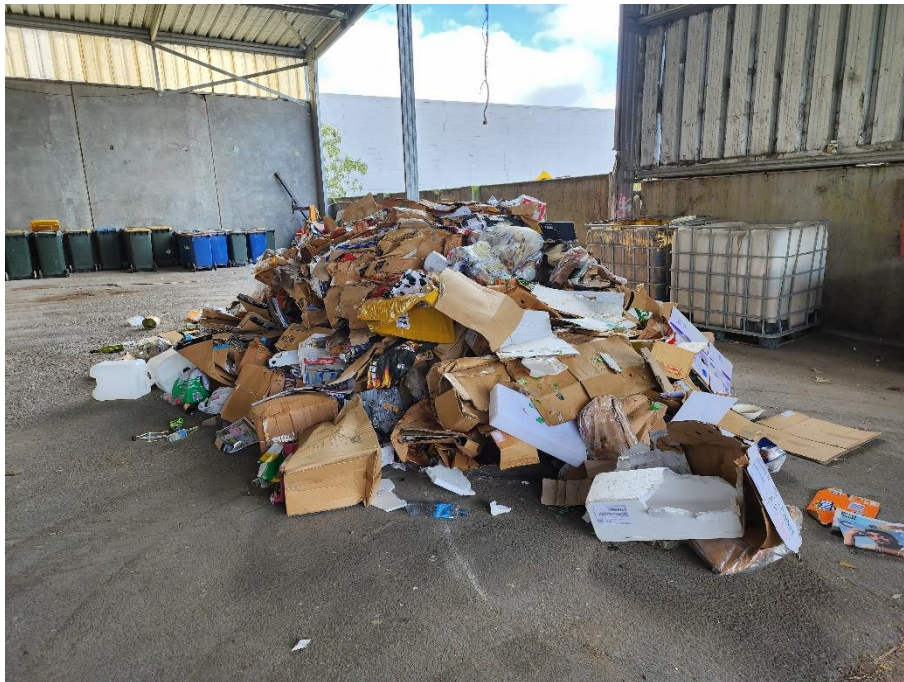
Truck load of materials from the morning collection

On Tuesday 18 October an entire truck load of recycling bags and cardboard collected between 04:30 and 07:30 that morning, was delivered to the Waitakere Transfer Station. Late on the 18 October, a second truck load of recycling bags and cardboard were delivered. These were collected from the same area between 17:00-19:30 hrs.