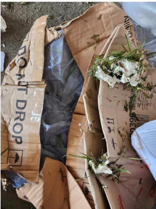
Cardboard box containing soft plastic