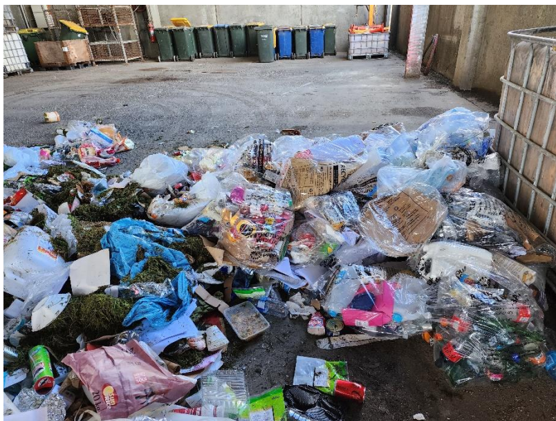
Pile of bagged recycling separated from loose materials

The recyclable materials were sorted into the categories shown in Appendix A. These categories captured detail on the recyclable materials present as well as the composition of the contamination.