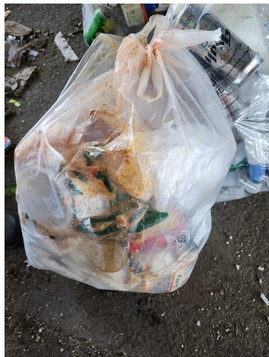
Example of bag containing mostly contamination