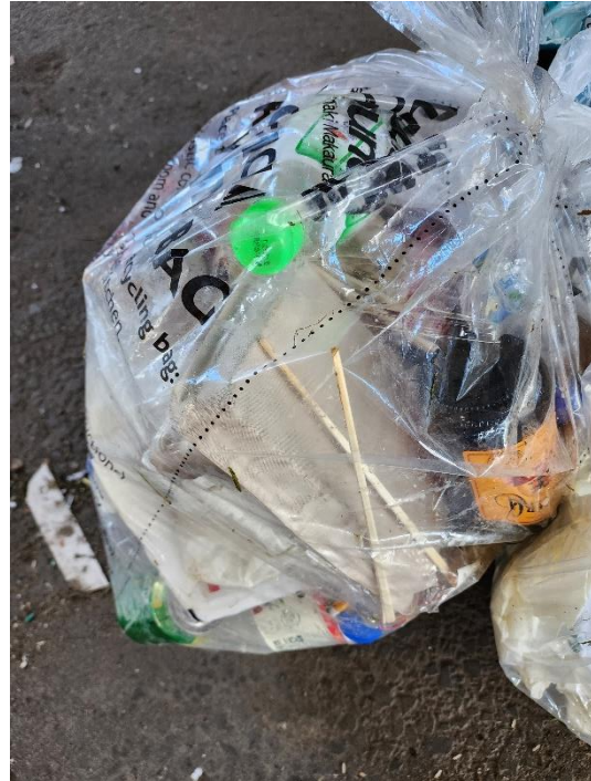
Example of bag containing some contamination