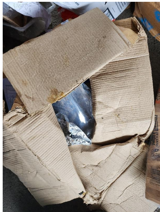
Cardboard box containing soft plastic