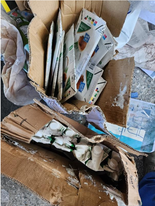
Cardboard box full of empty Tetrapak containers