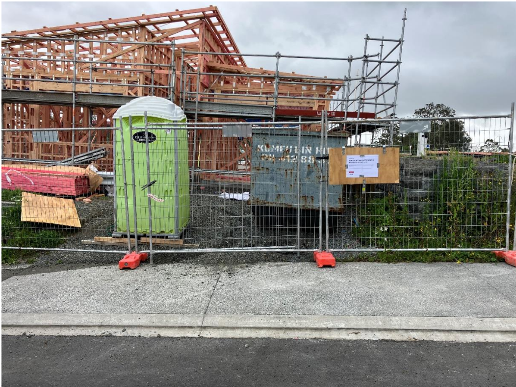
FIGURE 1: SITE SECURITY FENCING.

The site was fully fenced and locked after hours. A 9m3 skip bin was provided by our contractor inside the fenced area which was for the sole use of the project site. Signage was installed to ensure all waste produced on that site was deposited in the skip and to deter illegal dumping.