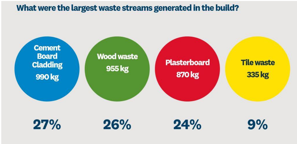
FIGURE 10: THE FOUR LARGEST WASTE STREAMS FROM THE BUILD BY WEIGHT.

Total waste stream by weight (Including concrete and spoil):