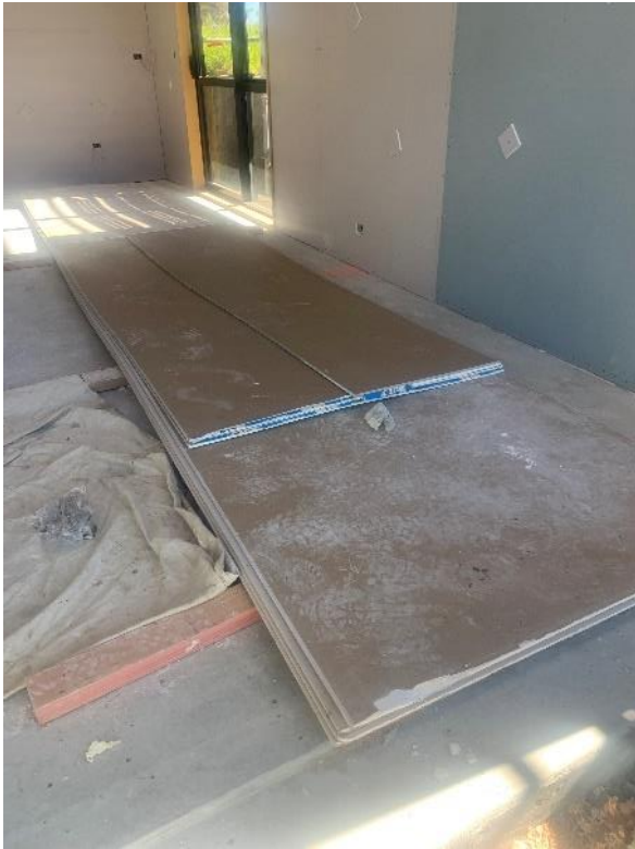
FIGURE 15: FULL SHEETS OF PLASTERBOARD LEFT OVER TO BE TRANSFERRED TO THE NEXT HOUSE IN THE DEVELOPMENT.