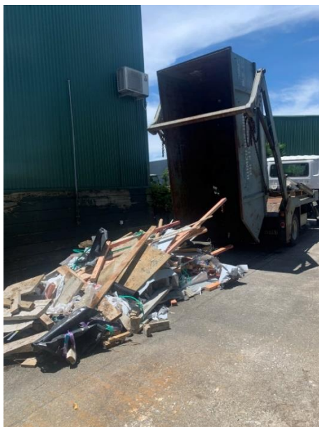
FIGURE 4: FIRST SKIP BEING TIPPED AT WAITAKERE TRANSFER STATION.