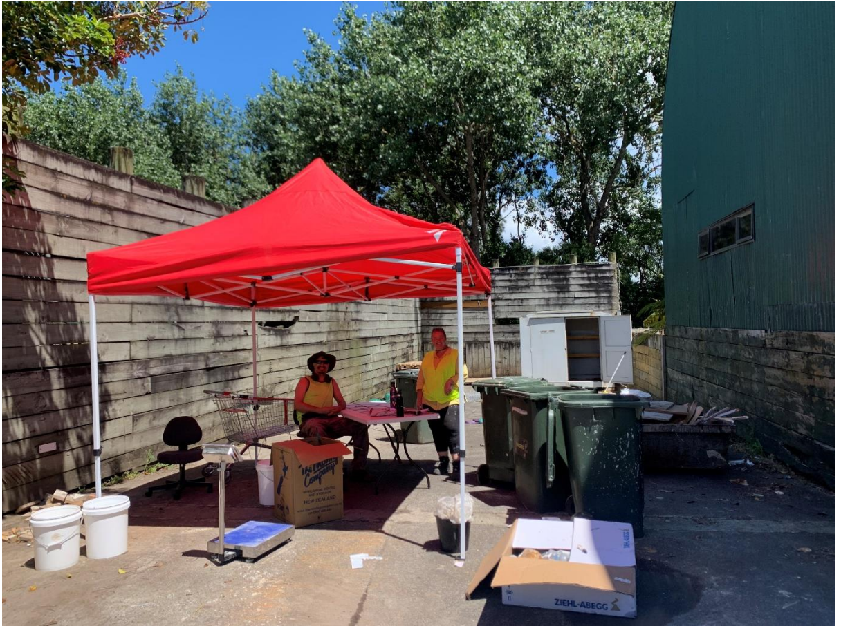
FIGURE 7: WASTE SORTING BINS AND PLATFORM SCALES SETUP.