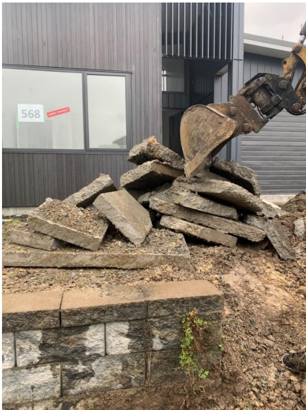
FIGURE 17: CONCRETE FOOTPATH CUT AND STACKED READY FOR DISPOSAL PRIOR TO VEHICLE CROSSING INSTALLATION.

Aside from 35 kg of paver off cuts, there was very little landscaping waste (no deck).