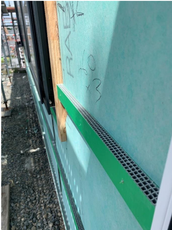
FIGURE 12: RAB BOARD WITH HORIZONTAL PVC CAVITY BATTEN (PRIOR TO ABODO VERTICAL CLADDING).

A delay with the supply of the Abodo cladding supply meant that RAB (Rigid Air Barrier) board was required over that section of framing which created additional waste. The James Hardie RAB board product is unable to be recycled so those offcuts plus the PVC plastic cavity battens used would become landfill. Total weight of the offcuts was 5kg so relatively insignificant. Worth noting that the GIB Weatherside RAB board has a gypsum core which is able to be recovered although that was not used on this project.