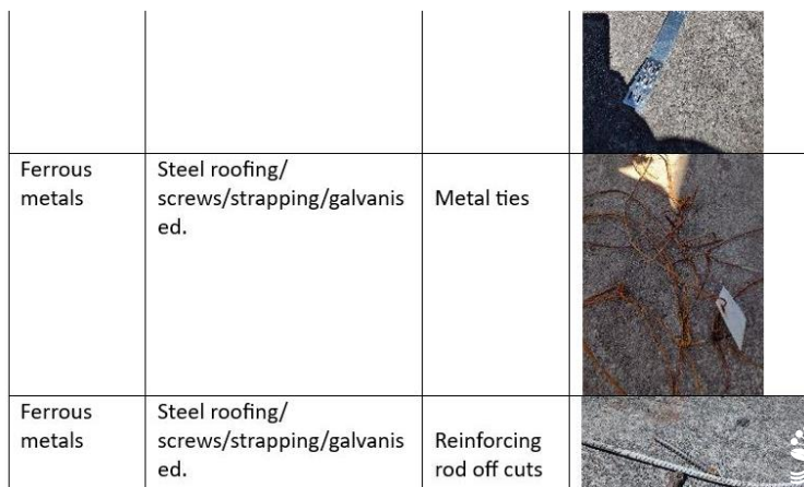
FIGURE 8: EXAMPLE OF THE WASTE MATERIAL CATALOGUE.

Once the waste was sorted and weighed, the data was then aggregated on a spreadsheet with the weight, volume/ length and a photograph of each individual waste item recorded. There were over 1000 rows to that spreadsheet so too many to easily summarise here.