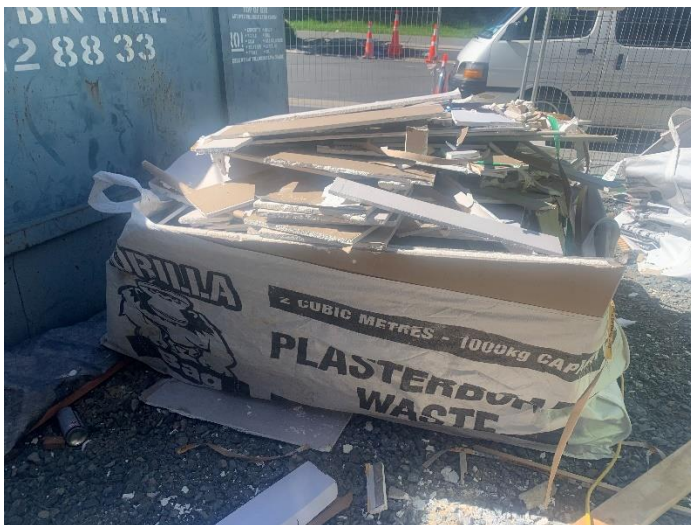
FIGURE 16: 2M3 PLASTERBOARD WASTE BAG READY FOR COLLECTION.