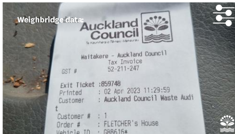
FIGURE 3: WEIGHBRIDGE DISPOSAL DOCKET EXAMPLE.

When nearing full (as per monitoring by Council staff), the bin was swapped out by our collection contractor with the full bin being tracked from site to the weighbridge at the Council owned Waitakere Transfer Station. The bin was weighed over the weighbridge and recorded on a special account created for the audit (using preloaded tare weight for truck and empty bin). The waste was then tipped out of the skip on to a clear pad/ bunker ready for sorting. A tarpaulin was used to cover the pile to ensure loose material was contained.