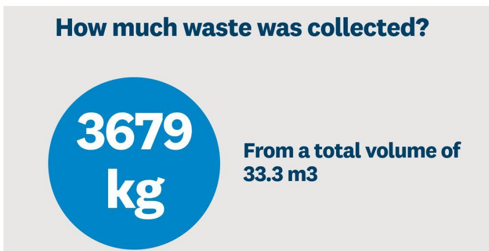
FIGURE 9: TOTAL WEIGHT AND VOLUME OF WASTE PRODUCED DURING THE BUILD (EXCLUDES SPOIL AND CONCRETE).