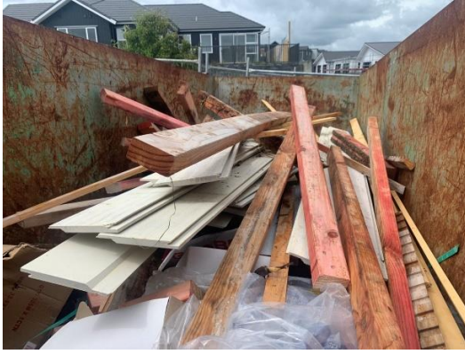
FIGURE 2: SECOND SKIP FILLING UP ON SITE DURING CLADDING STAGE.