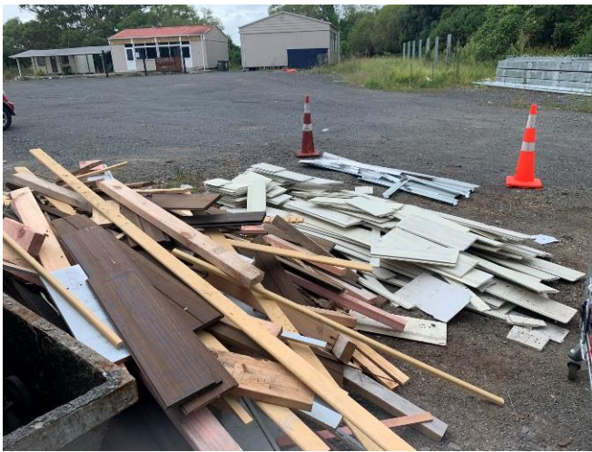
FIGURE 5: PRE-SORT IN TO WASTE TYPES.