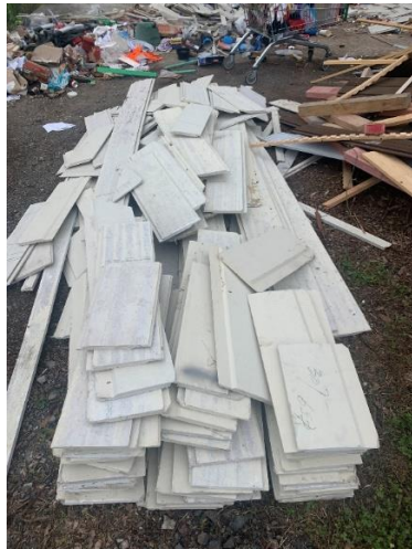
FIGURE 6: SORTED LENGTHS OF FIBRE CEMENT BOARD.