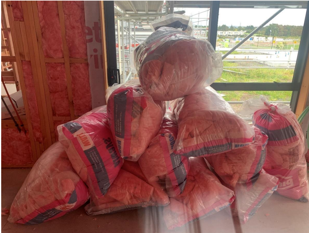
FIGURE 13: BAGGED INSULATION OFFCUTS READY FOR COLLECTION.