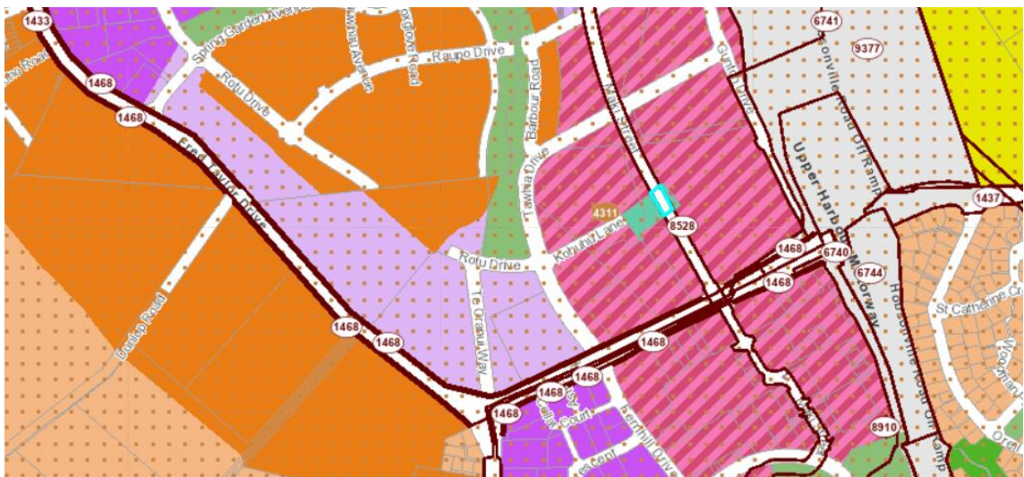
Figure 2 Designation 1468 from Spring Garden Avenue to Upper Harbour Highway