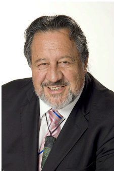
Hon Dr Pita R Sharples Minister of Māori Affairs

I look forward to working with Māori land owners to build on these successes in order to assist them to achieve their aspirations for their Māori land.