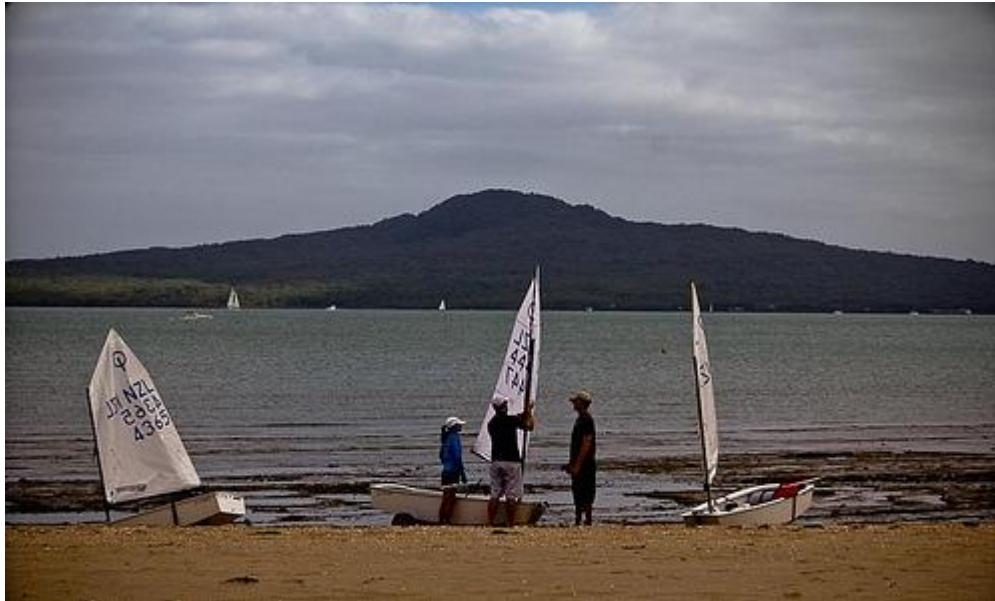
Public access to the coast – Mission Bay