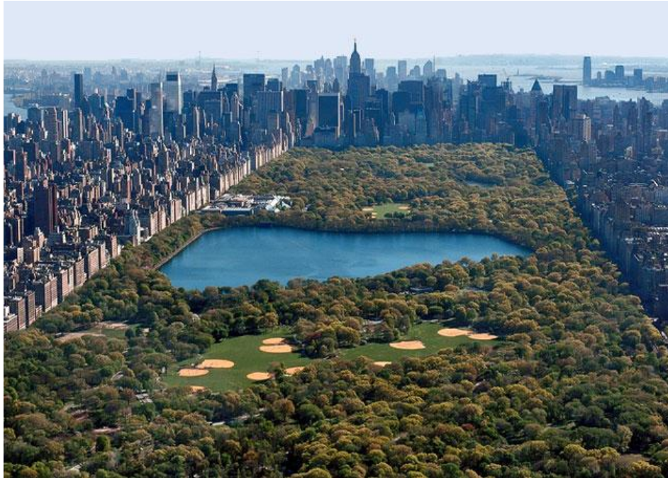
Central Park – New York

There is increasing demand for commercial recreational activities on public open space in the form of concessionaires, clubrooms with cafes, restaurants, venue hire. Parks policy will guide what can/can not be approved.