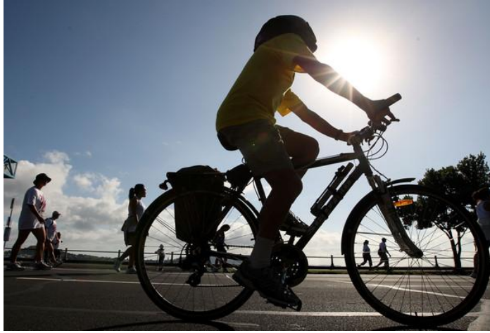
Tamaki Drive - Auckland