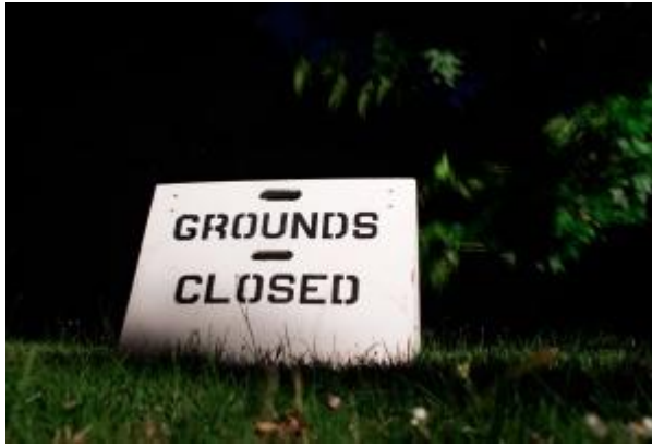
Sports field closures during winter