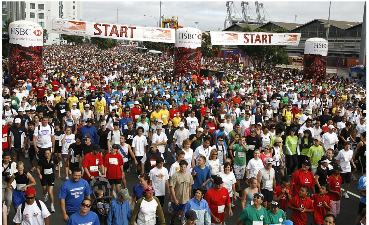
Round the bays fun run- Auckland