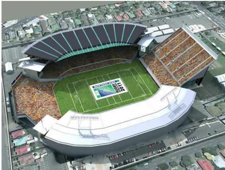
Eden Park – Mt Eden