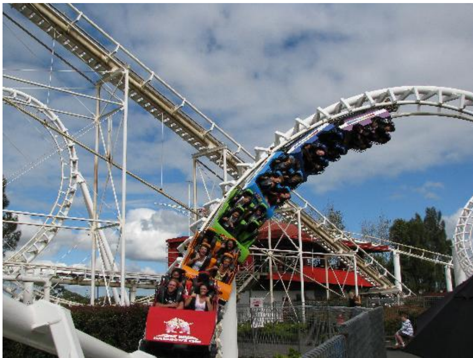
Rainbows End - Manukau