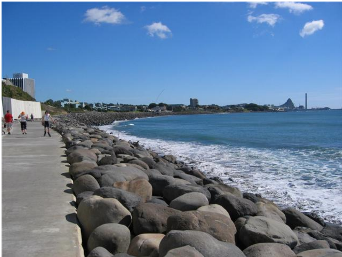
Coastal walkway – New Plymouth