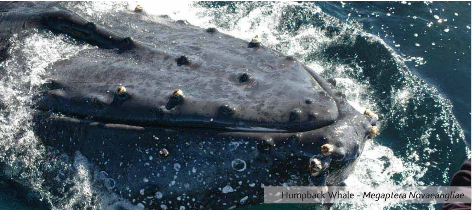
Humpback Whale - Megaptera Novaeangliae