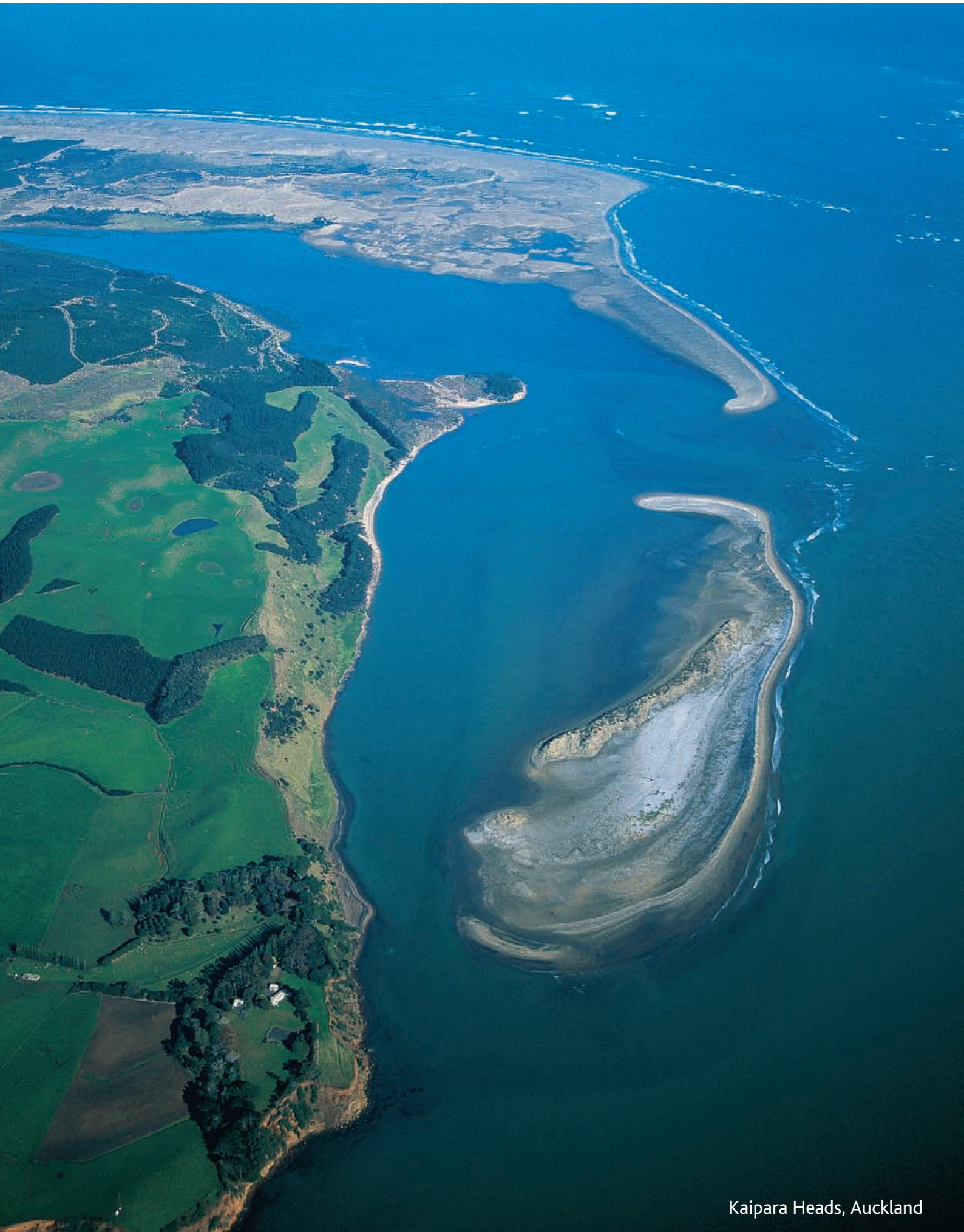
Kaipara Heads, Auckland