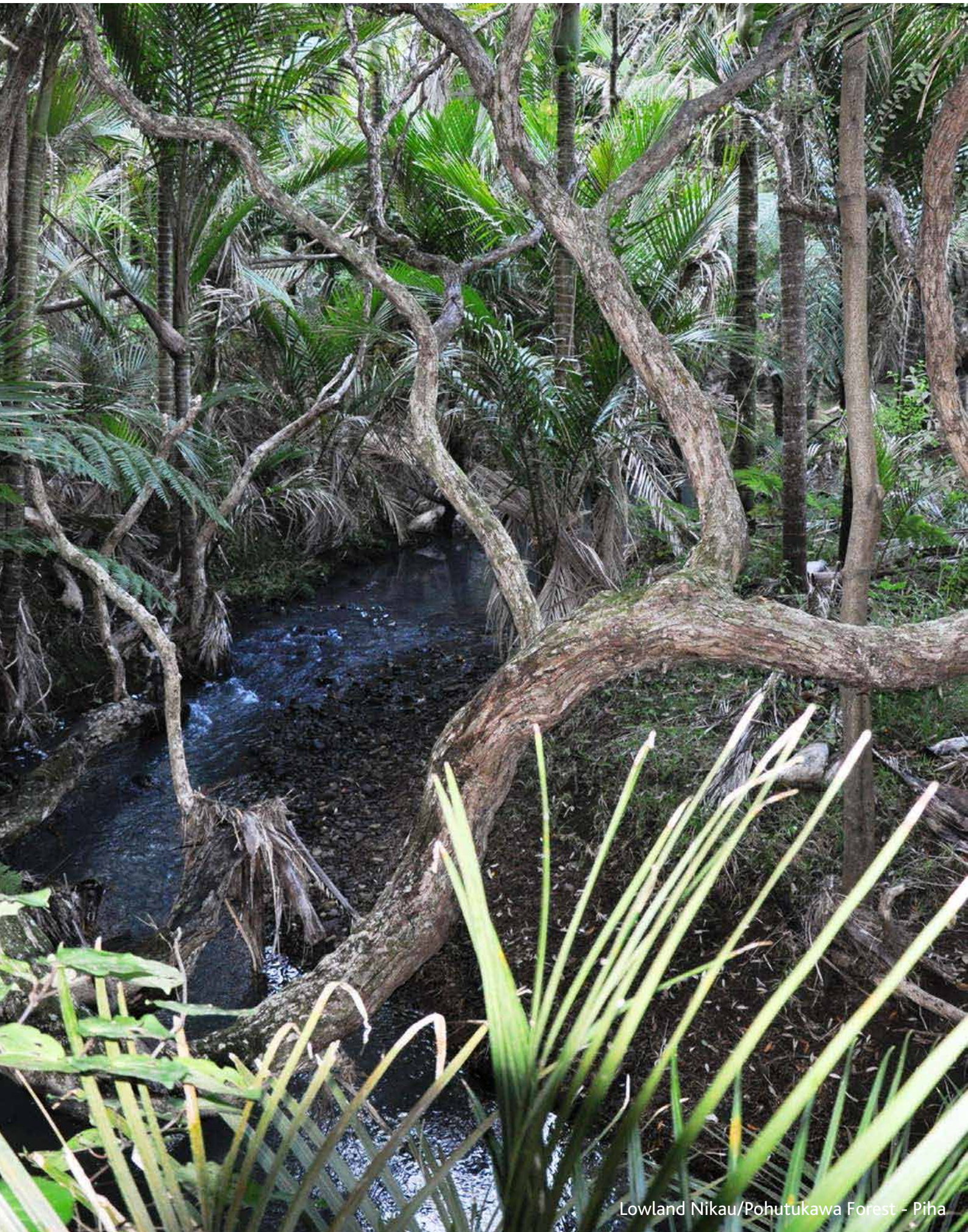
Lowland Nikau/Pohutukawa Forest - Piha