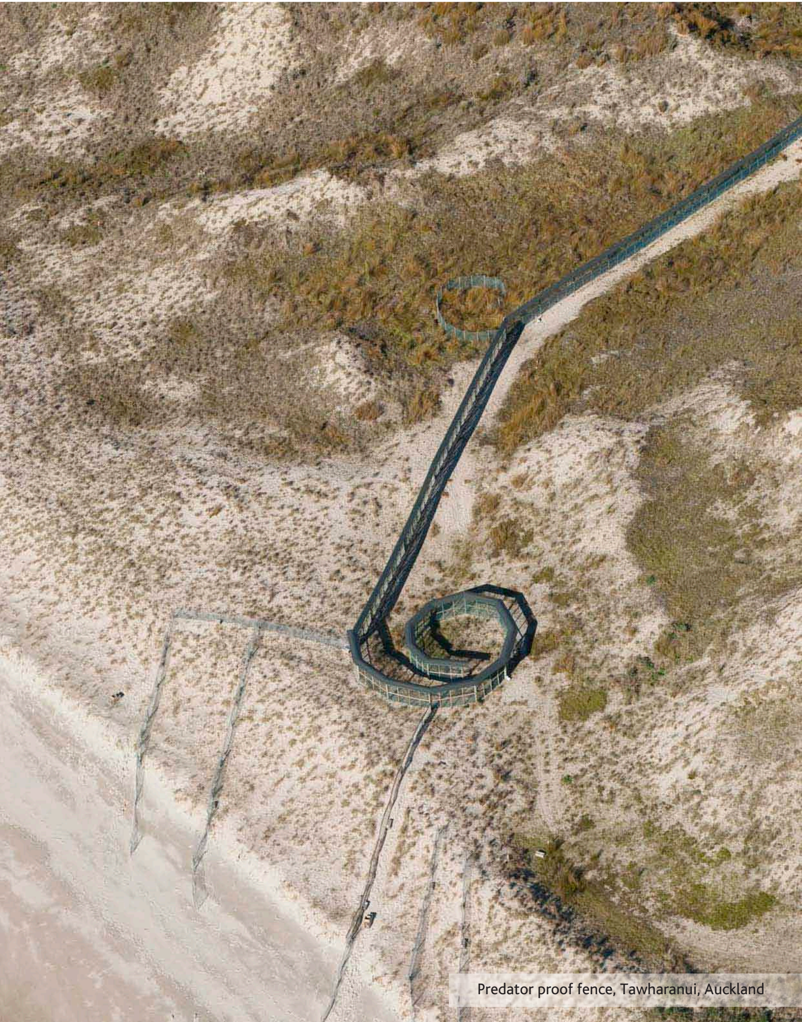
Predator proof fence, Tawharanui, Auckland