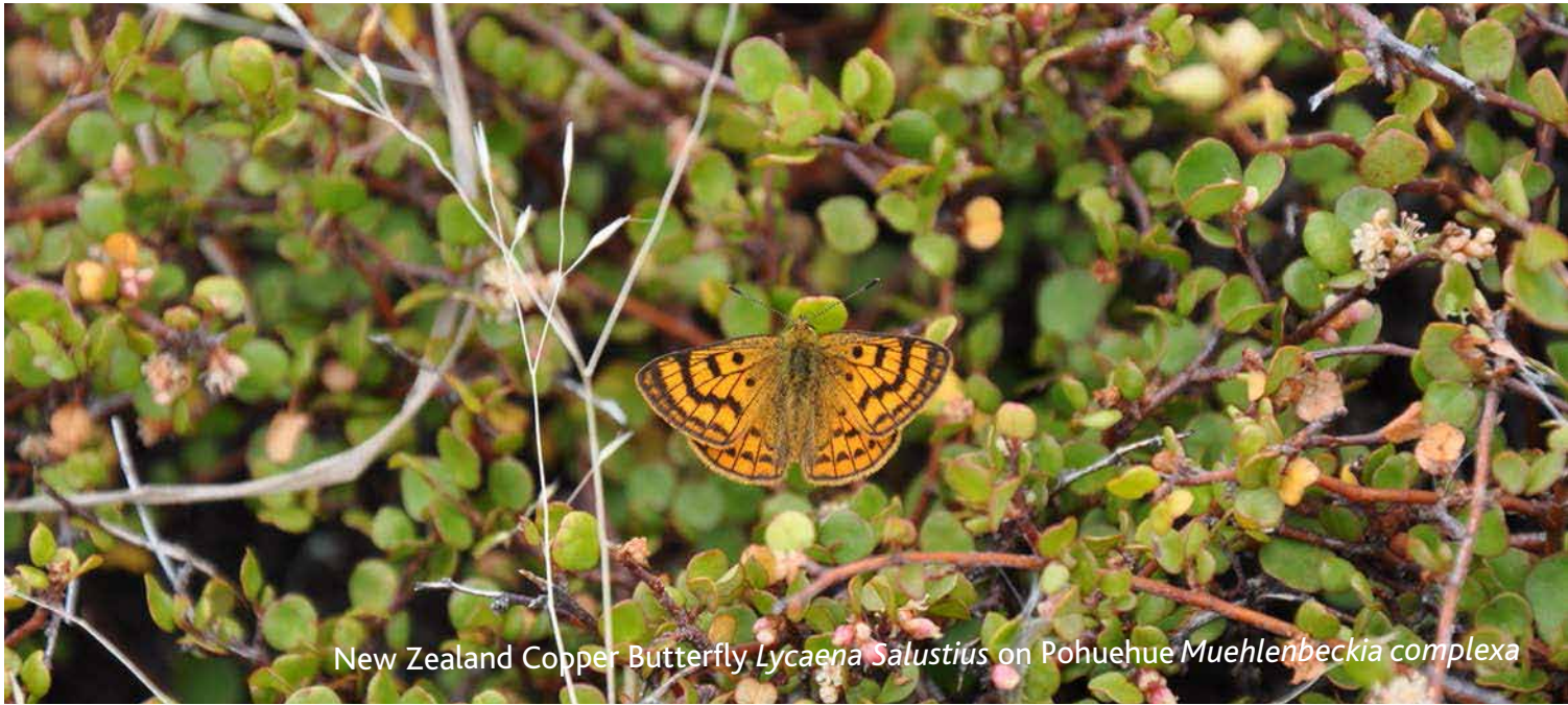
New Zealand Copper Butterfly Lycaena Salustius on Pohuehue Muehlenbeckia complexa