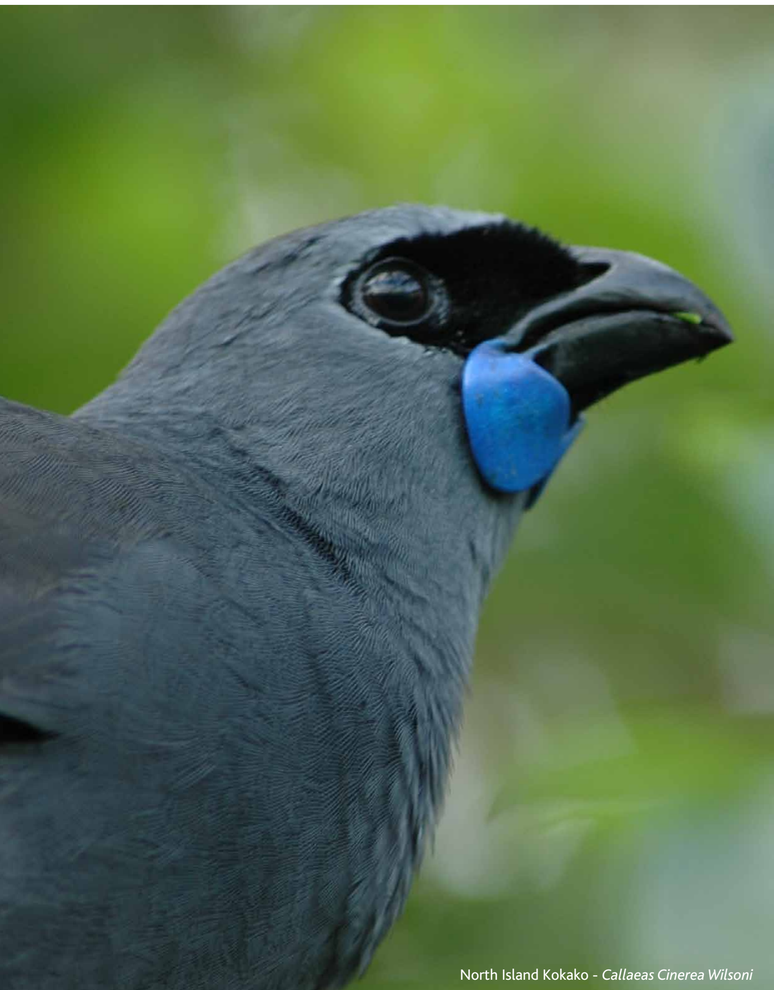
North Island Kokako - Callaeas Cinerea Wilsoni