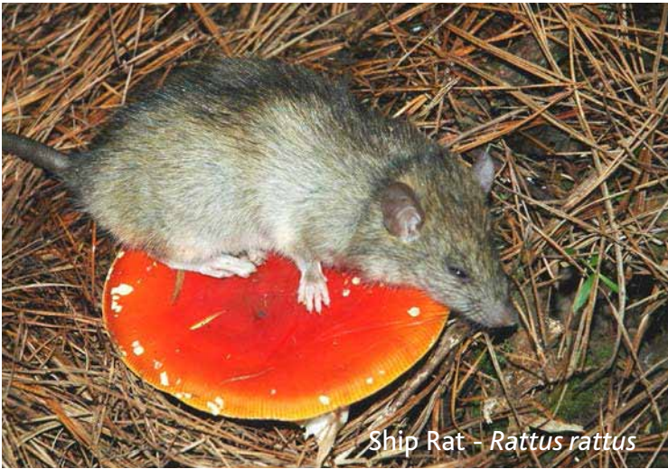
Ship Rat - Rattus rattus