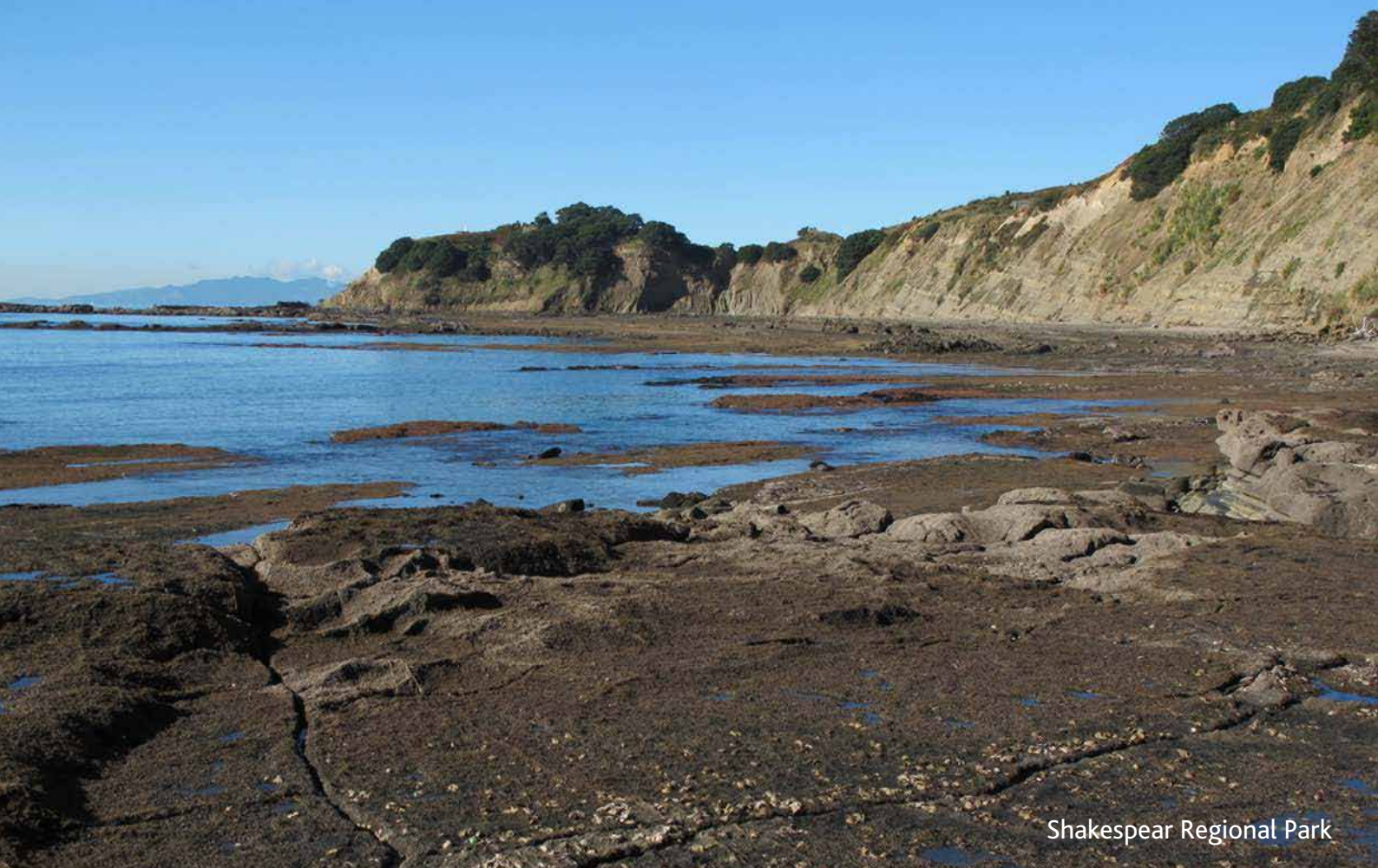
Shakespear Regional Park