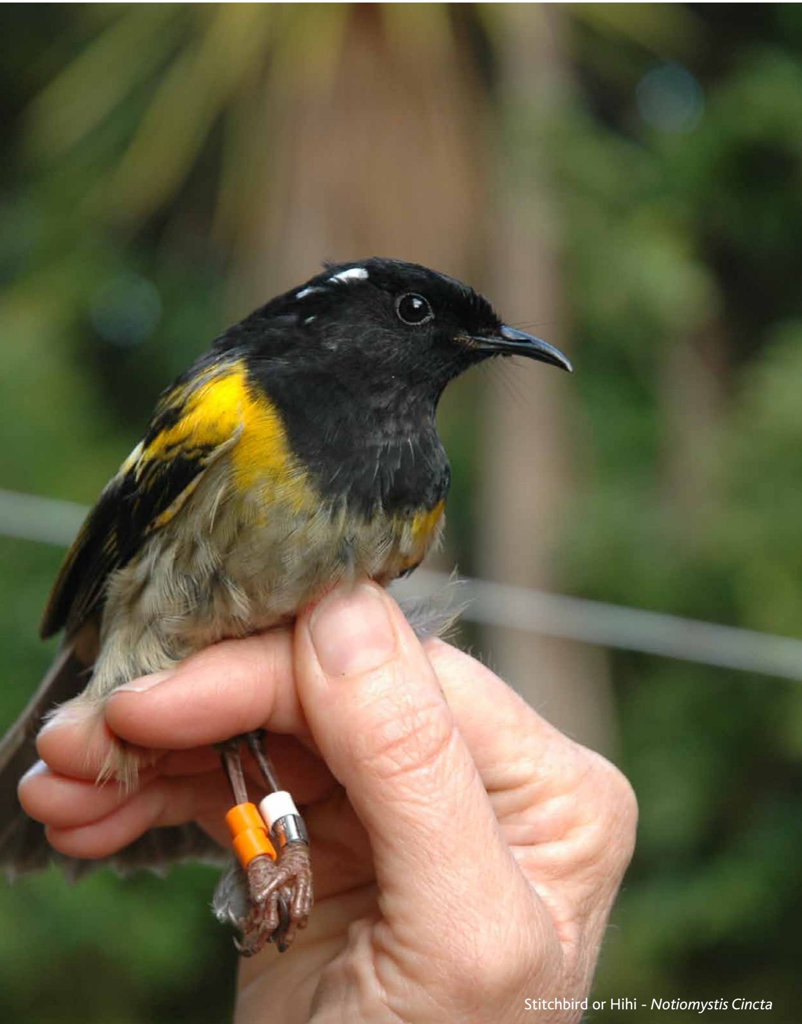
Stitchbird or Hihi - Notiomystis Cincta