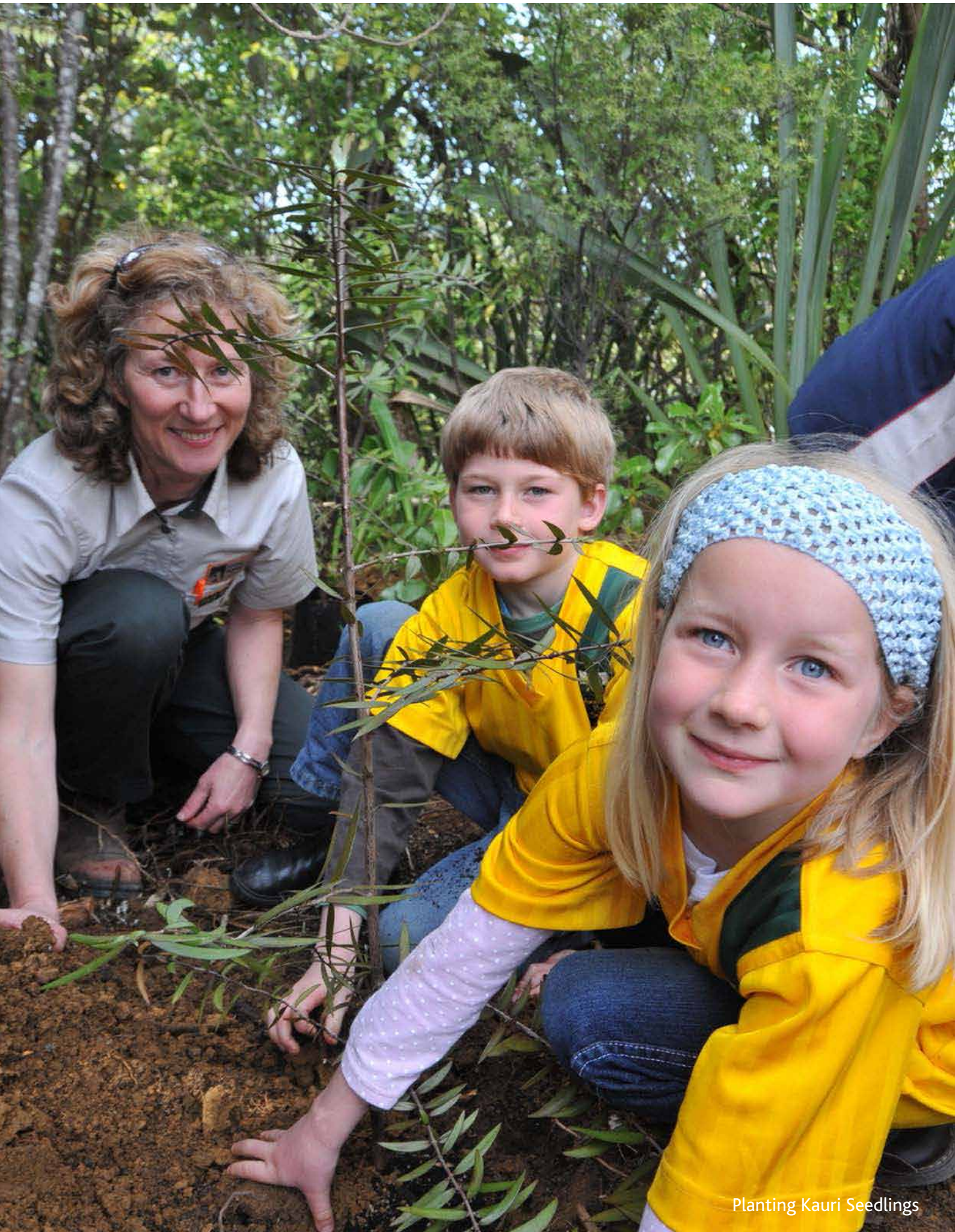
Planting Kauri Seedlings