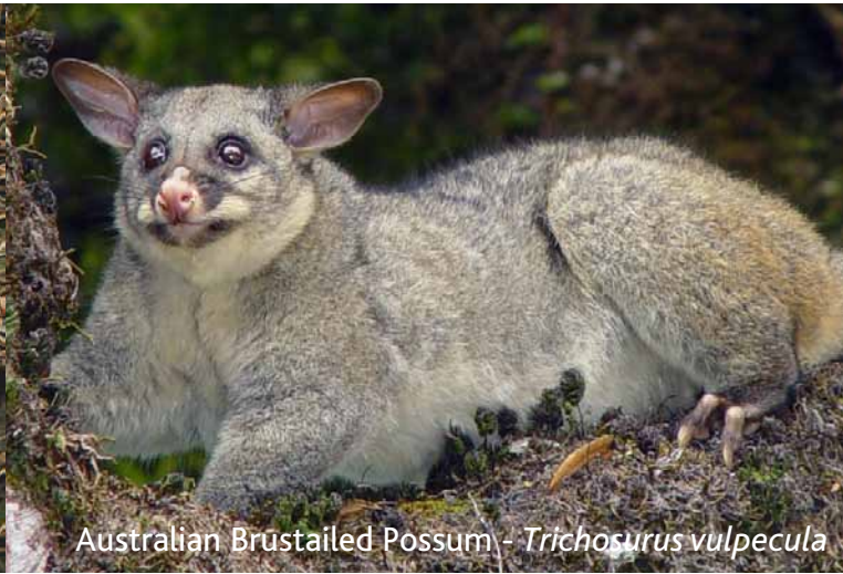
Australian Brushtailed Possum - Trichosurus vulpecula

It is intended that this strategic approach direct the Council's actions in all areas of its responsibilities, including as the largest single landowner in the region, with direct control over many areas important for biodiversity. It will give guidance in the development and implementation of statutory plans, in the provision and maintenance of infrastructure, and in the provision of advice and resources to the community. It is also hoped that it will give guidance to Local Boards on achieving their identified goals.