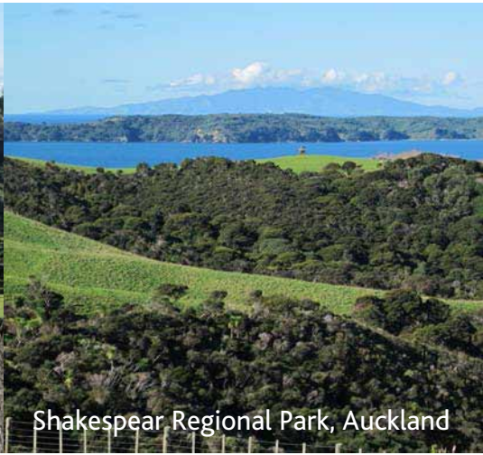
Shakespear Regional Park, Auckland