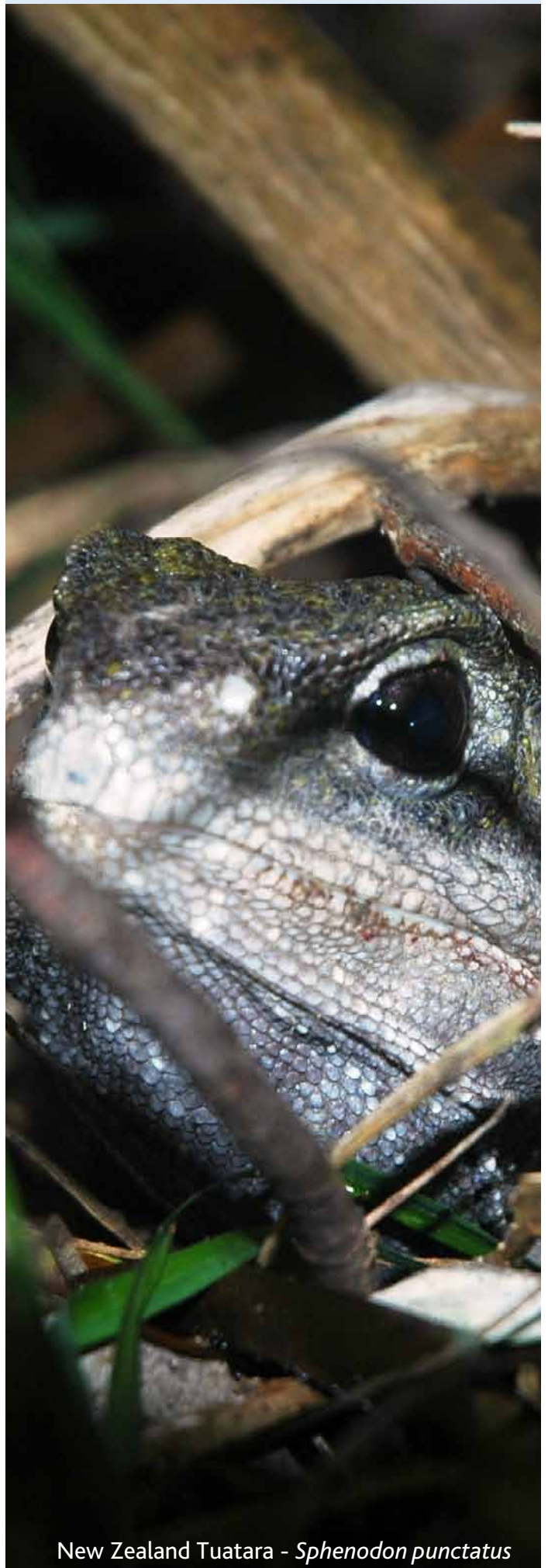
New Zealand Tuatara - Sphenodon punctatus

The first goal seeks enhanced community and individual action to conserve and sustainably use indigenous biodiversity, based on a well-educated, motivated and co-ordinated community that shares the responsibility for and benefits of our biodiversity. The second goal seeks protection of iwi and hapu interests in indigenous biodiversity. The third goal provides guidance on an appropriate course of direct action for biodiversity and states: "Maintain and restore a full range of remaining natural habitats and ecosystems to a healthy functioning state, enhance critically scarce habitats, and sustain the more modified ecosystems in production and urban environments; and do what else is necessary to maintain and restore viable populations of all indigenous species and subspecies across their natural range and maintain their genetic diversity."