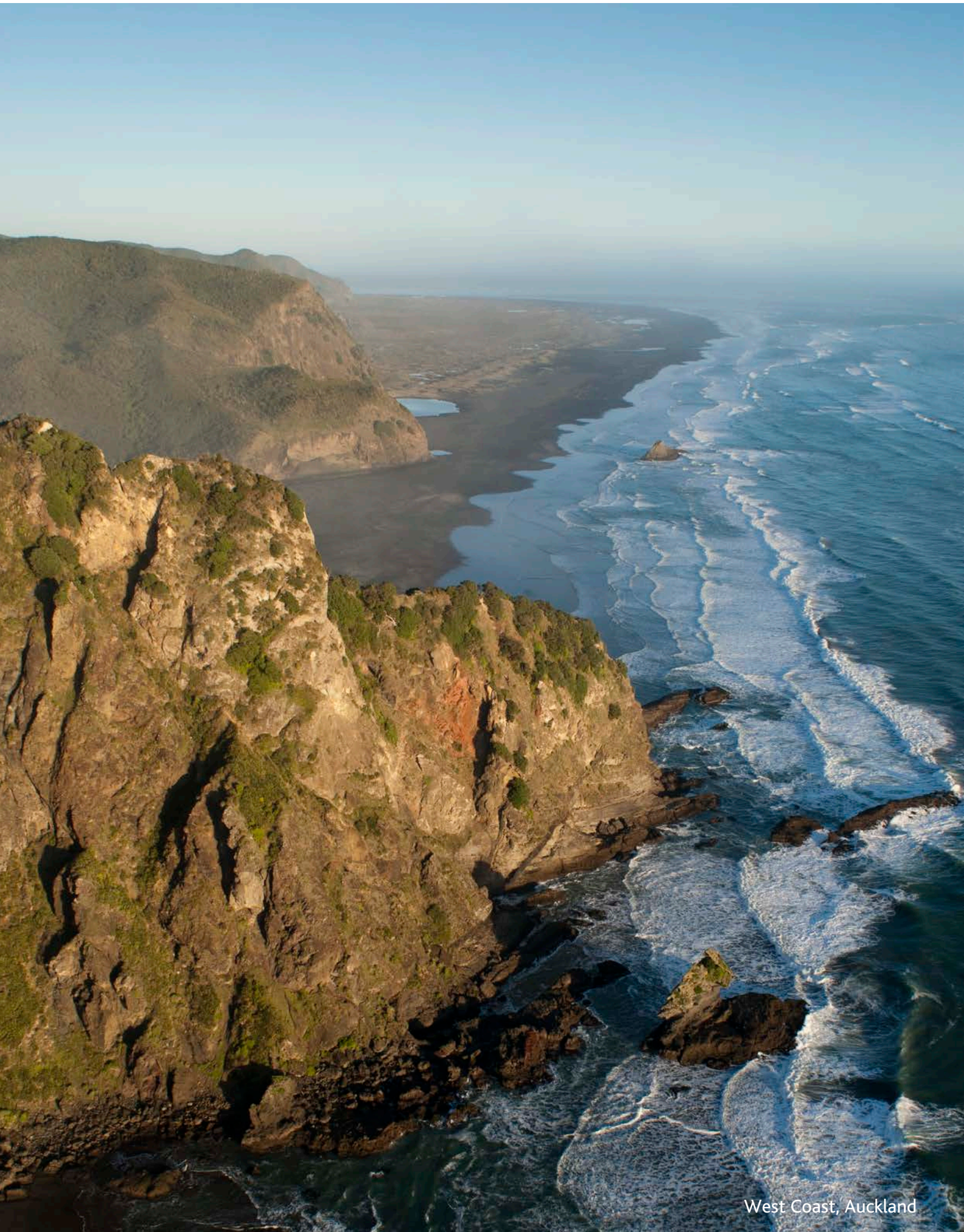
West Coast, Auckland